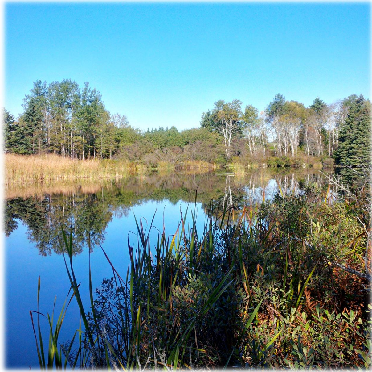
Graves Island Provincial Park