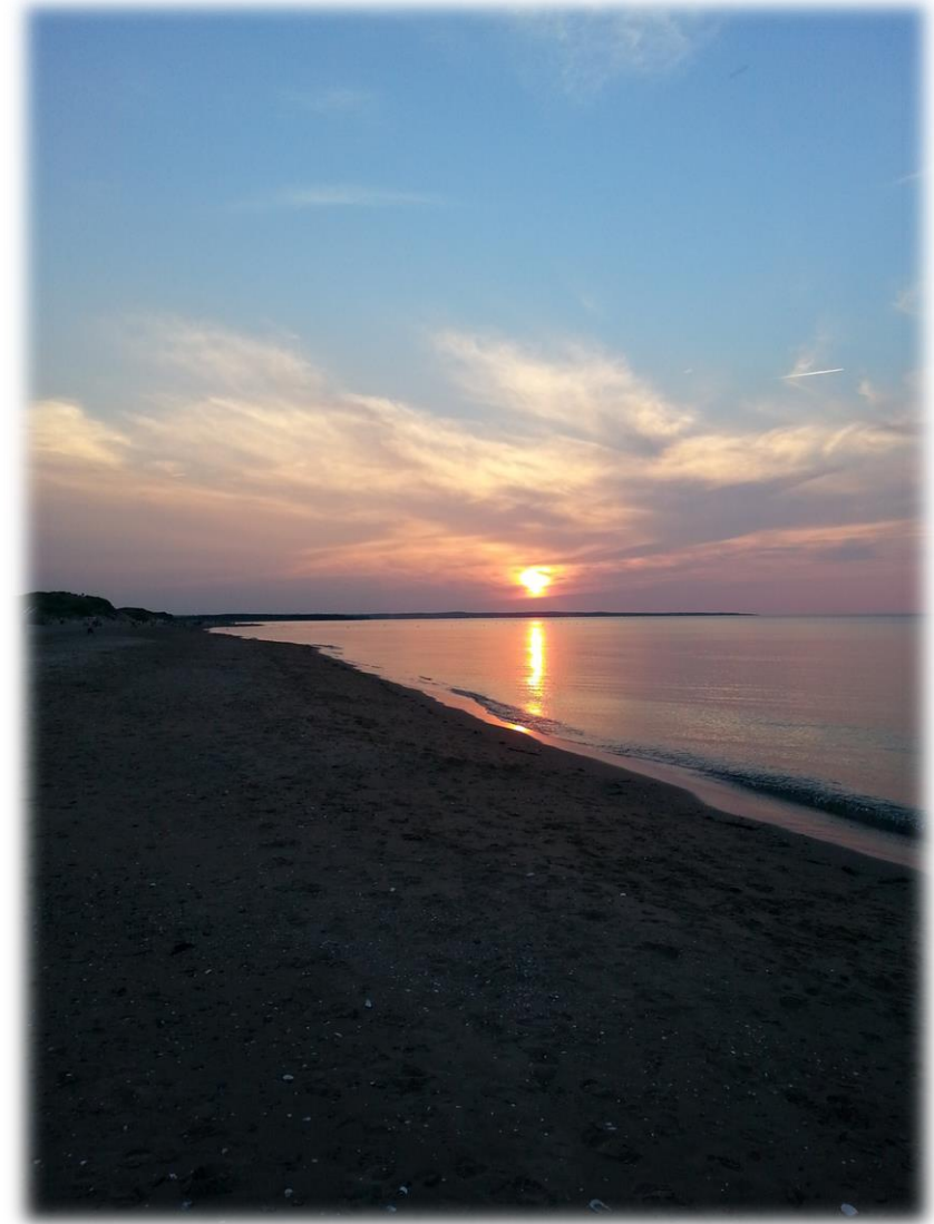
Sunset at Brackley Beach, PEI

Please remain seated in your pew to receive Communion.