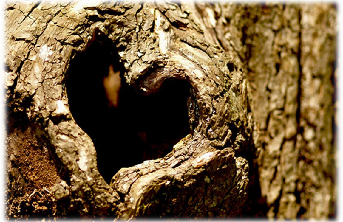
Meu Coracao/My Heart, Record number: [54138]

To help us maintain Social Distancing, once everyone in your pew has received communion, Please stand and exit the building