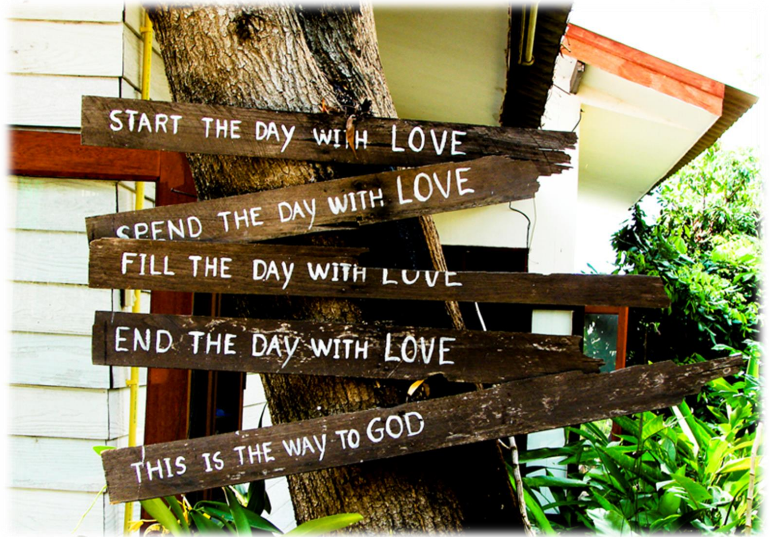
Wooden Love Sign, Record number: [57756]