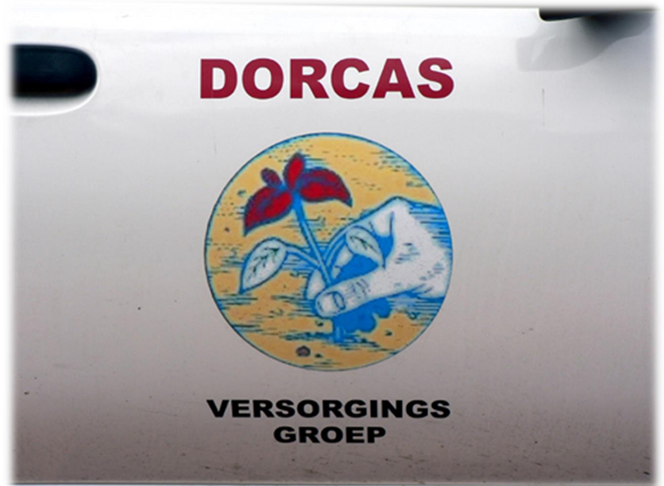
Logo of the Dorcas Care Group, Record number: [54336]

The Offering Plate will not be passed to respect Social Distancing