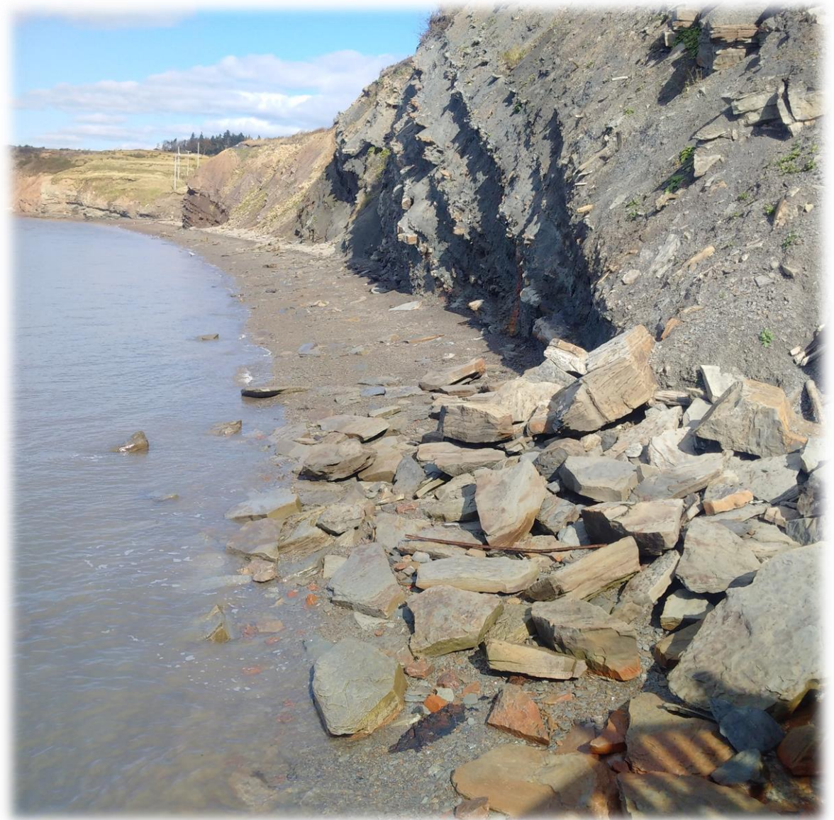
Joggins Fossil Cliffs