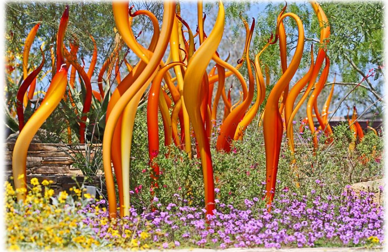
A New Spirit -- Dale Chihuly, Desert Botanical Garden, Phoenix, AZ