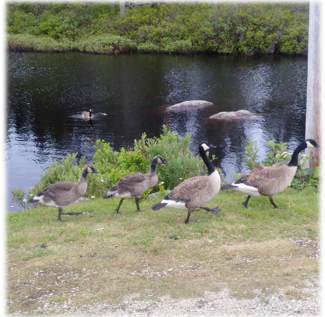
Family of Geese, Aspotogan