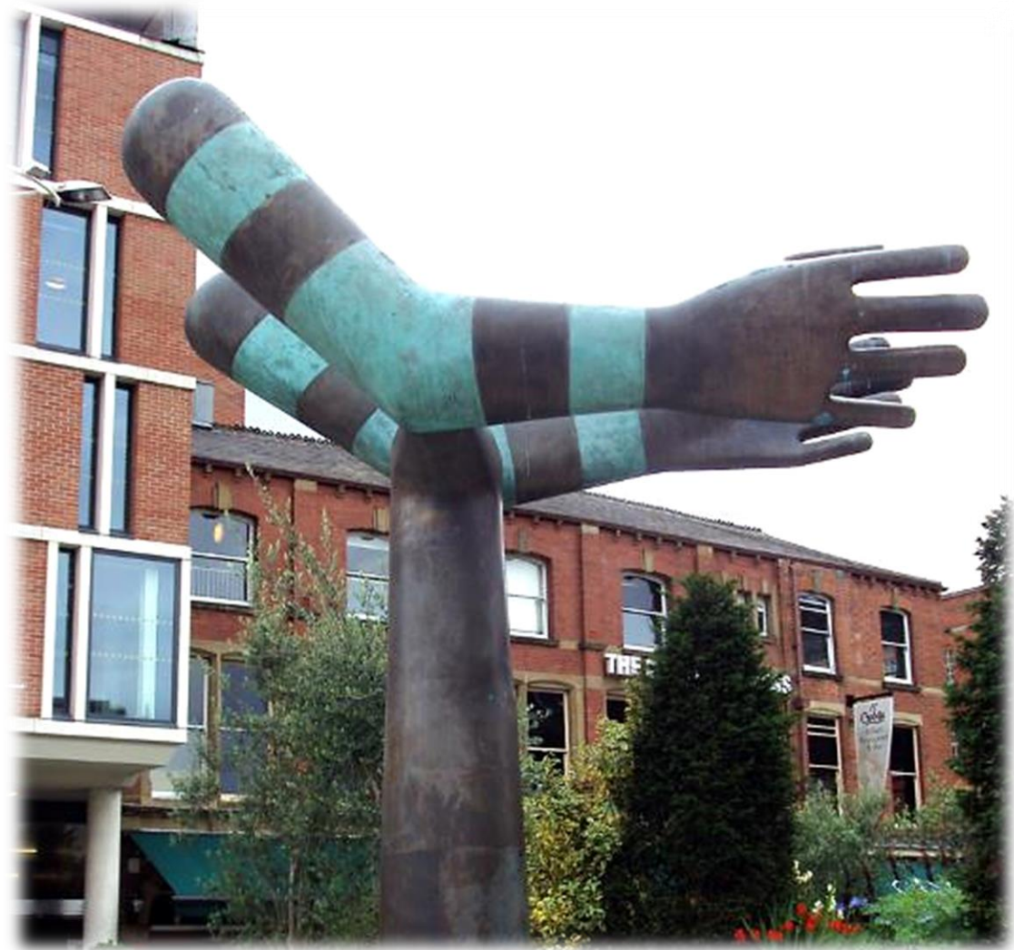
Helping Hands, Mandela Gardens Leeds, England