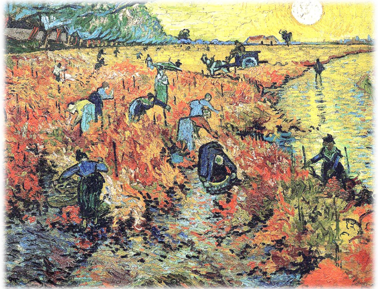
The Red Vineyard -- Vincent van Gogh, Pushkin Museum, Moscow, Russia

The Gospel of Christ according to Matthew 21: 23-32