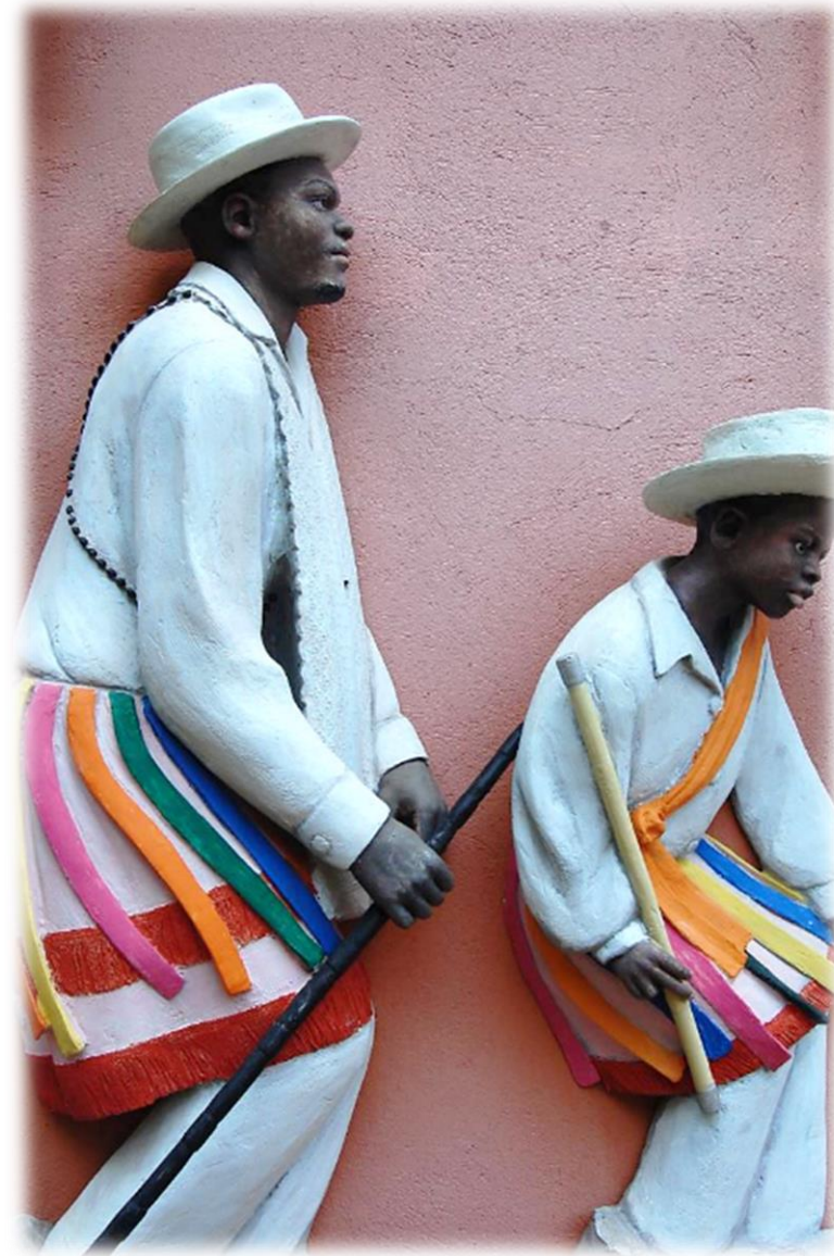
Processing to Church Inhotim Art Museum Inhotim, Brazil