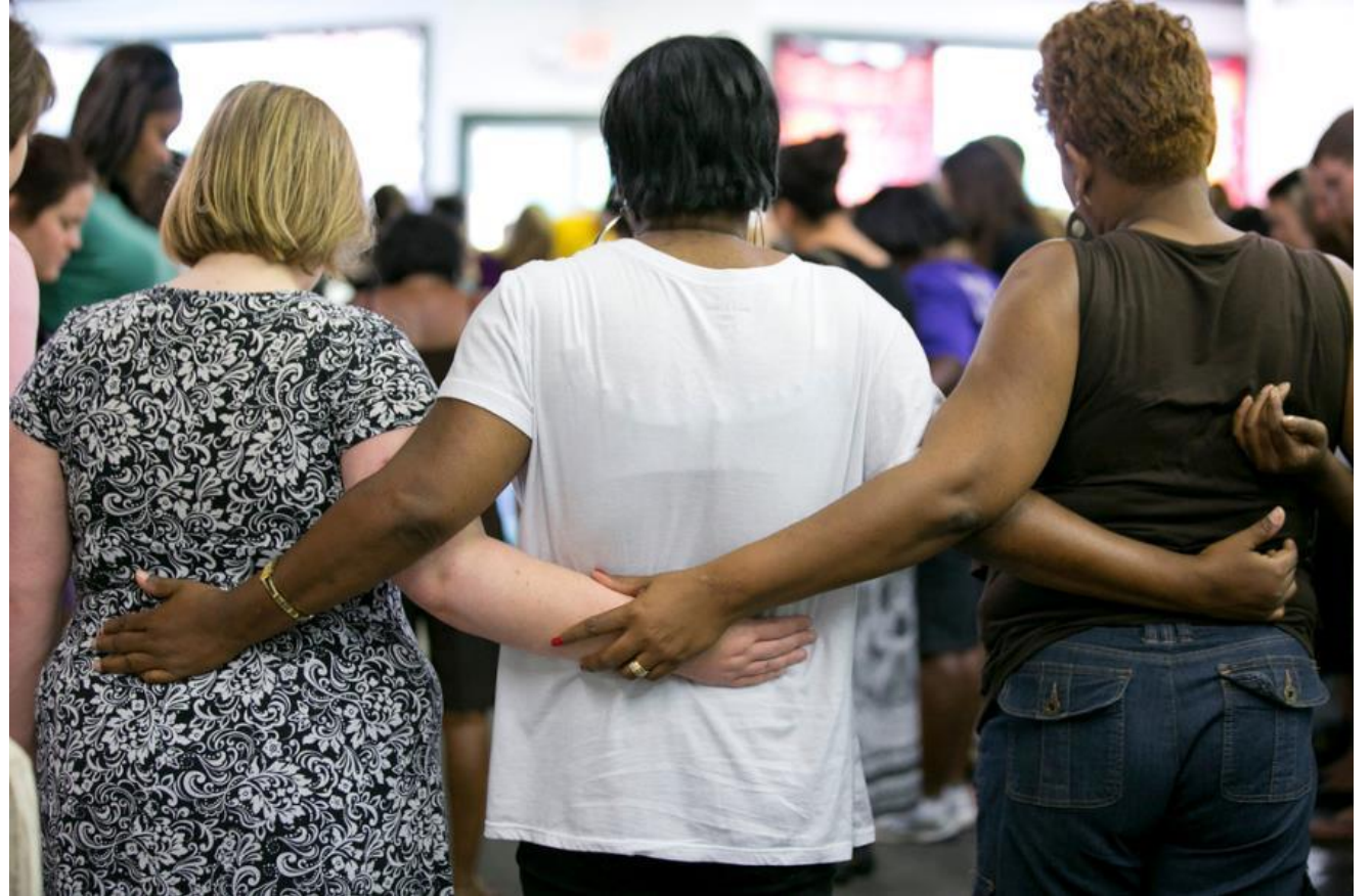
Praying Together, Thistle Farms Ministry, Nashville, TN