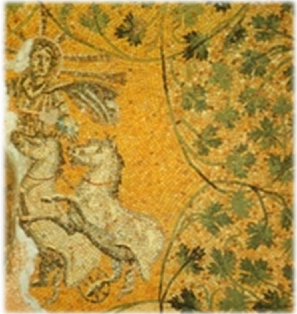
Christ as Sol Invictus