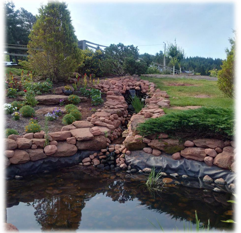
Garden of Hope, PEI