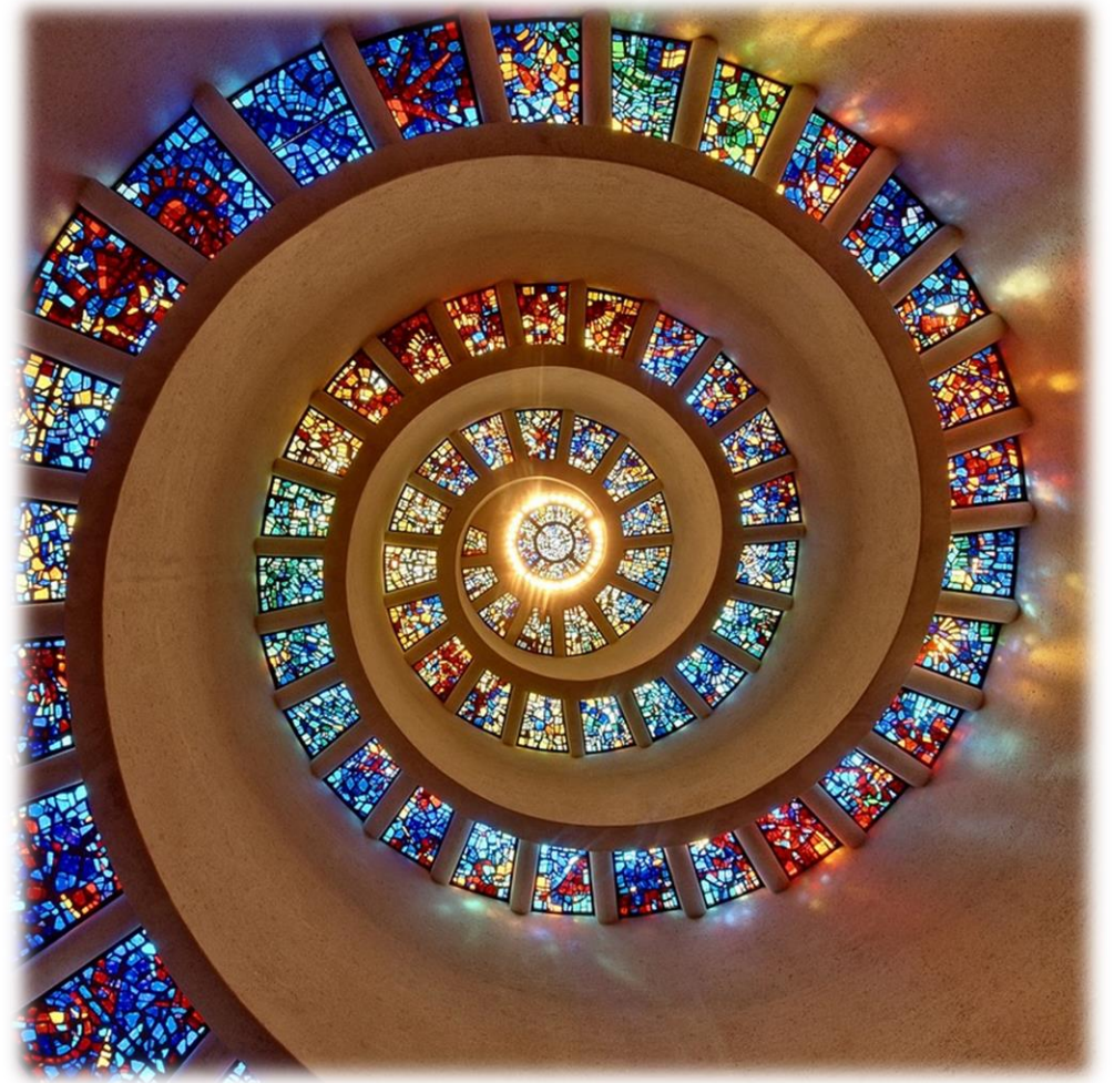
Thanks-Giving Chapel, Johnson, Philip, 1906-2005