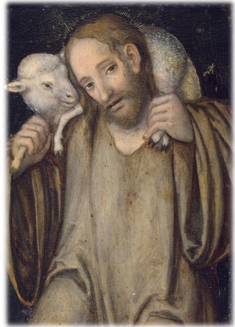
Christ as the Good Shepherd, Cranach, Lucas, 1515-1586