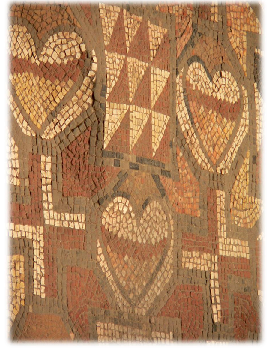
Mosaic from Lullingstone Villa, Record number: [54395]

Open our hearts, O Lord, to give heed to what is said by your Son.