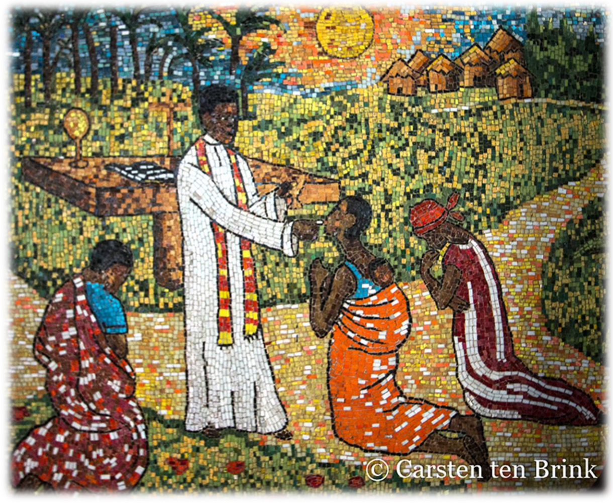
Sharing Communion, Unidentified mosaic artist Record number: [57809]

Please remain seated in your pew to receive Communion.