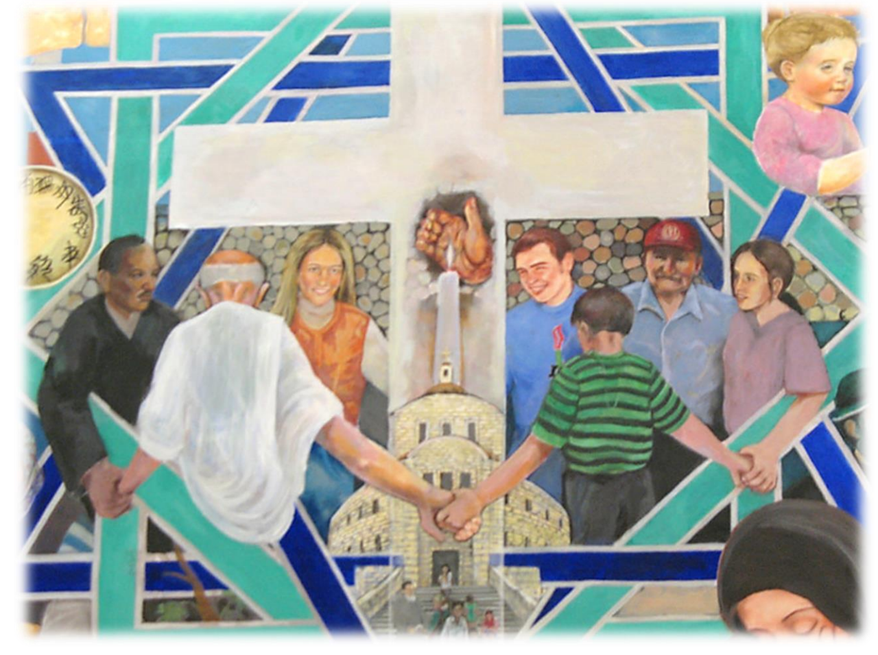
Reconciliation, Niwano Peace Auditorium, Haifa, Israel