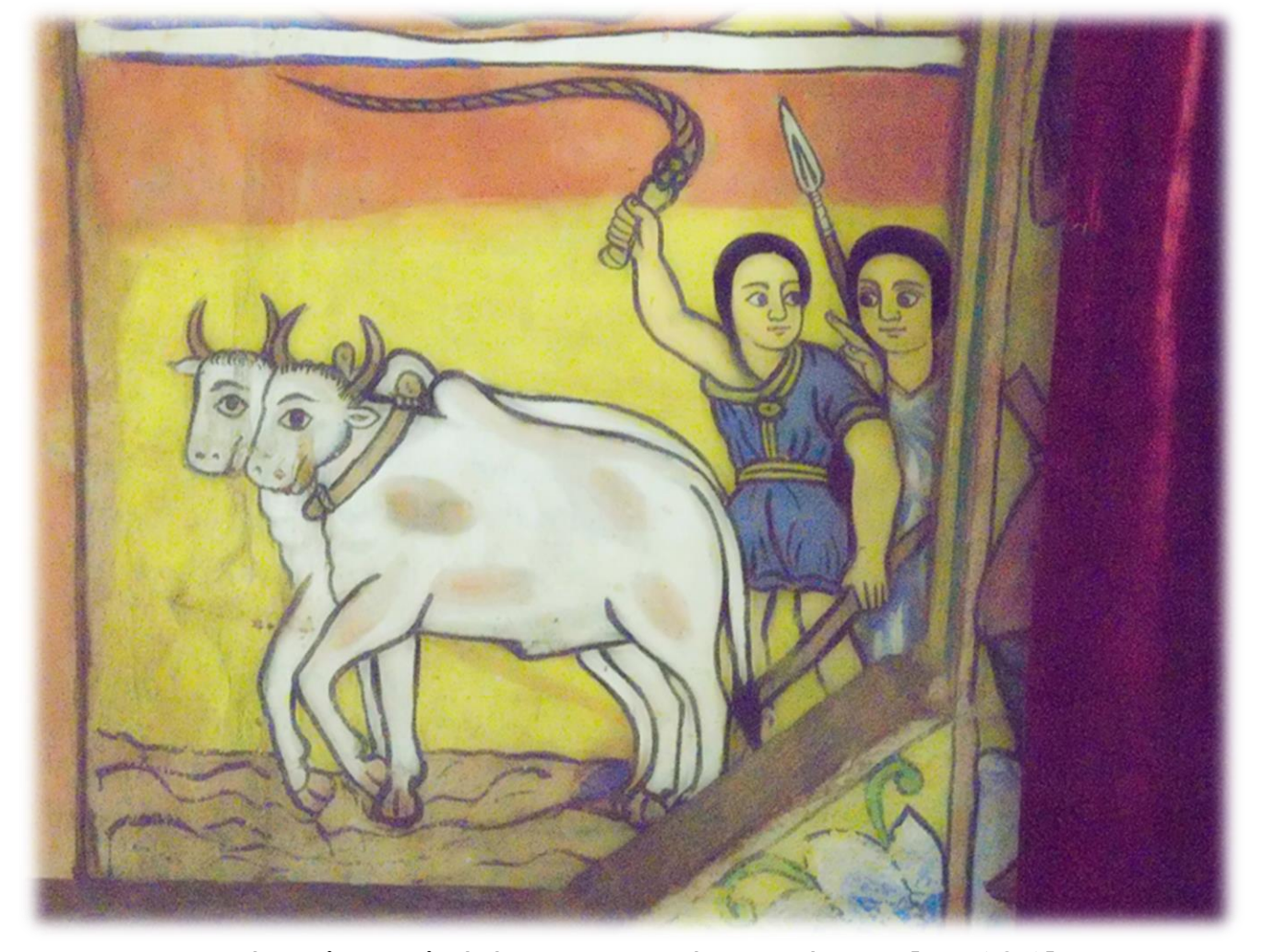
Plowing Fields, Record number: [57606]