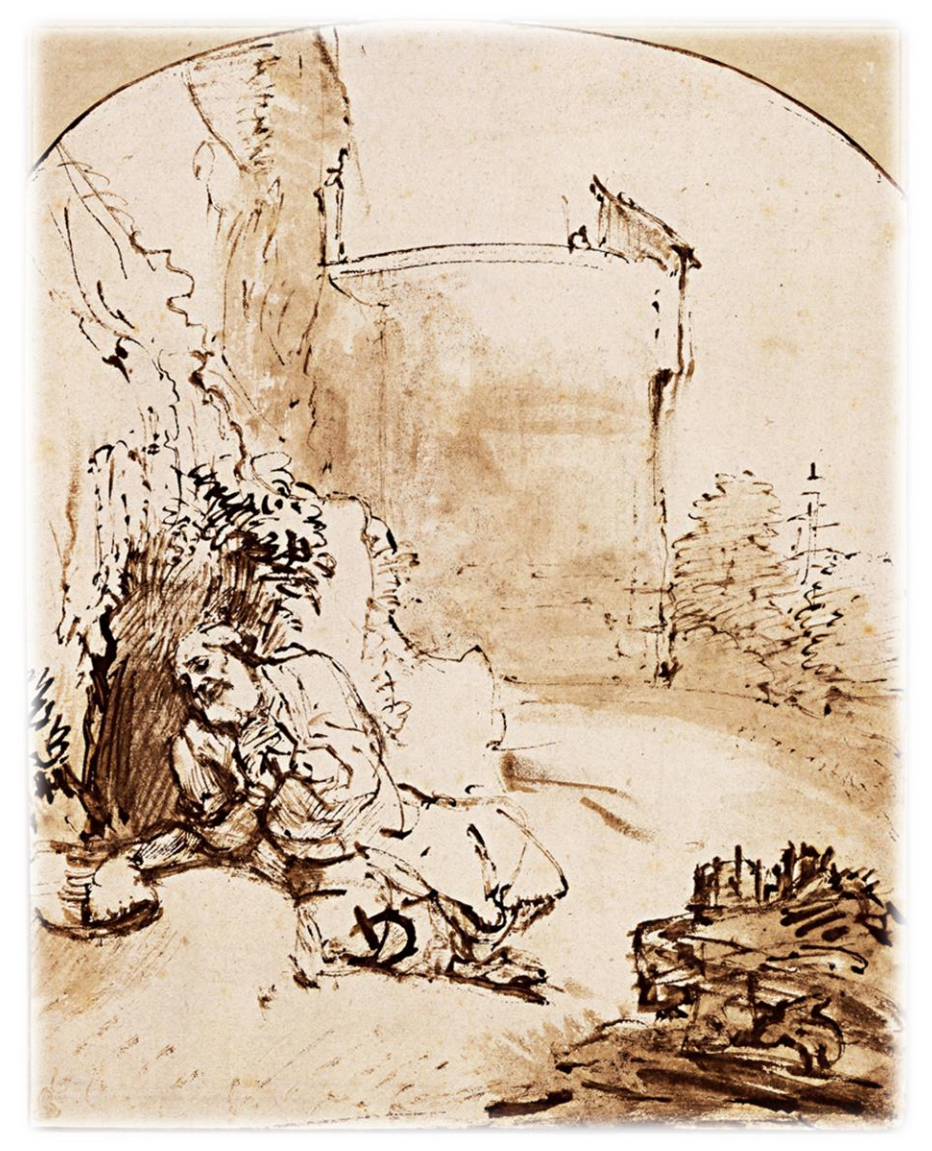
Prophet Jonah Before the Walls of Ninevah Rembrandt Albertina Museum Vienna, Austria