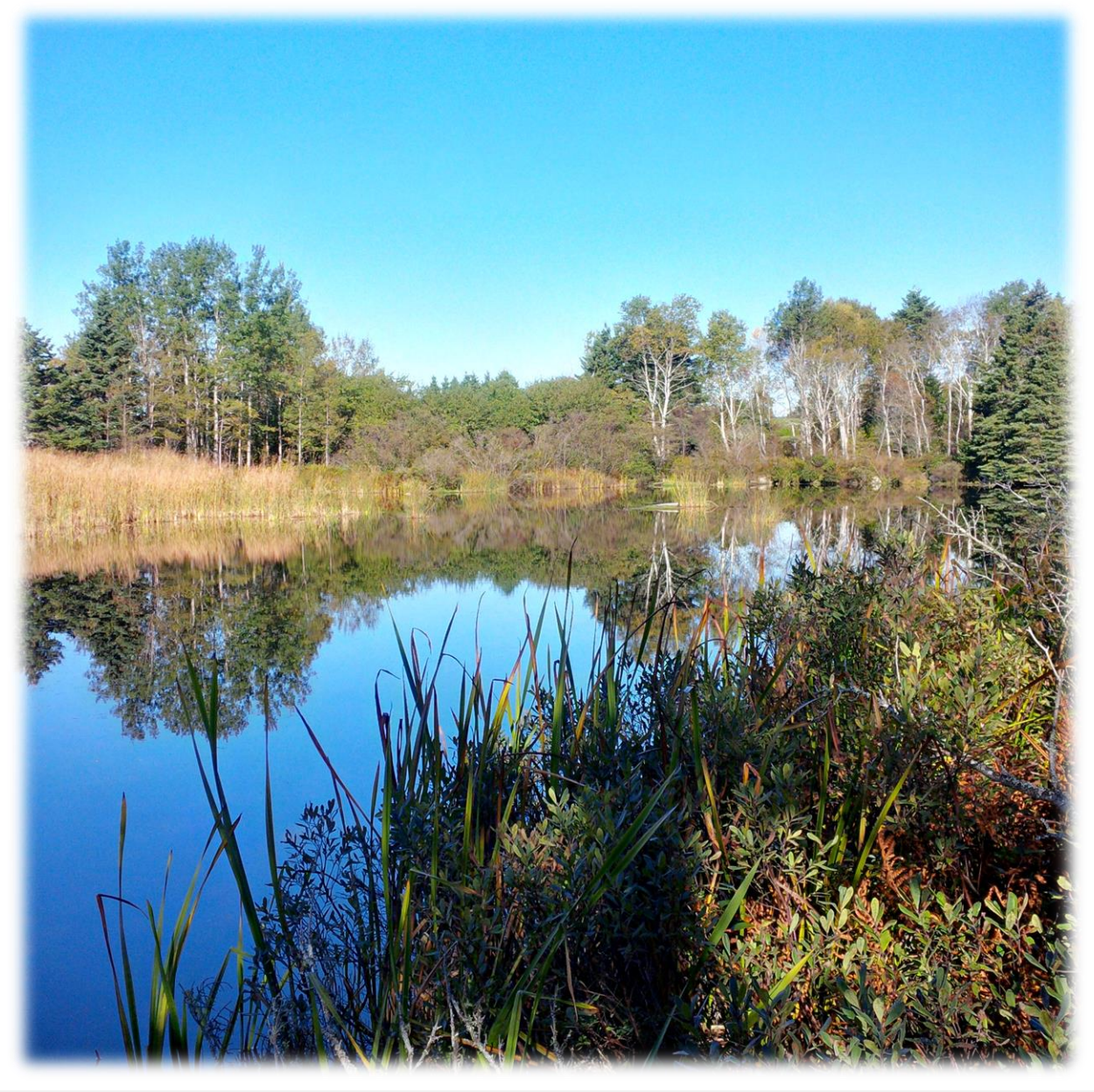
Graves Island Provincial Park