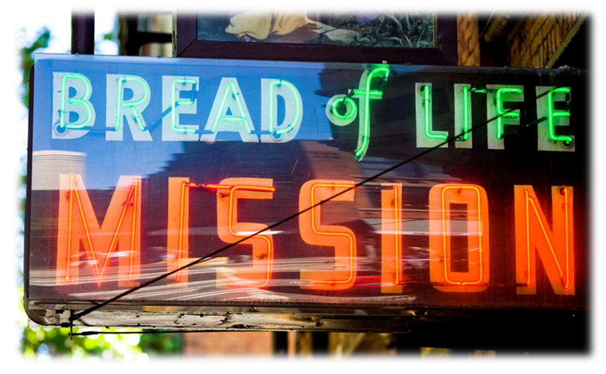
Bread of Life Mission, Record number: [56581]

Please help us maintain Social Distancing by exiting once everyone in your pew has received communion. Thank you!