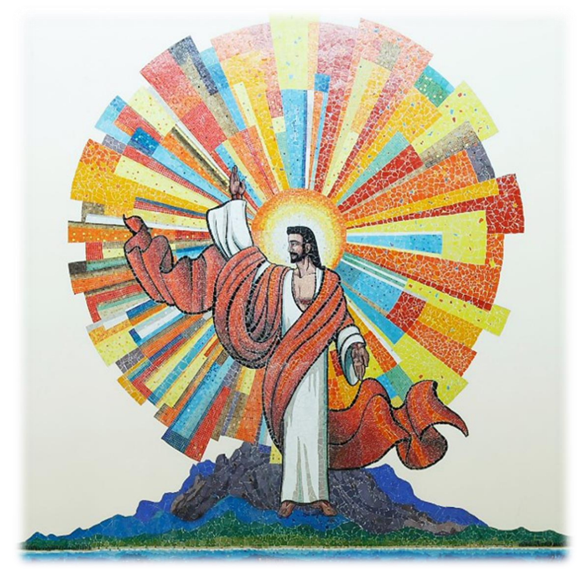
Christ Mosaic, Record number: [57444]