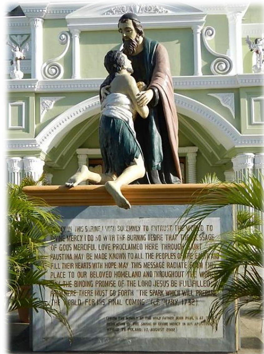
National Shrine of Divine Mercy Marilao, Philippines