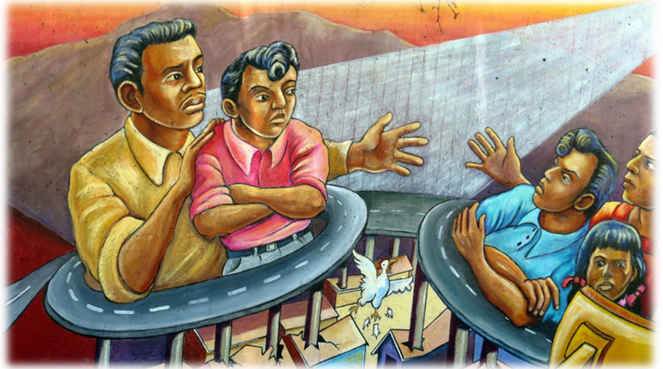
History of Los Angeles Mural, detail of one section, Los Angeles, CA