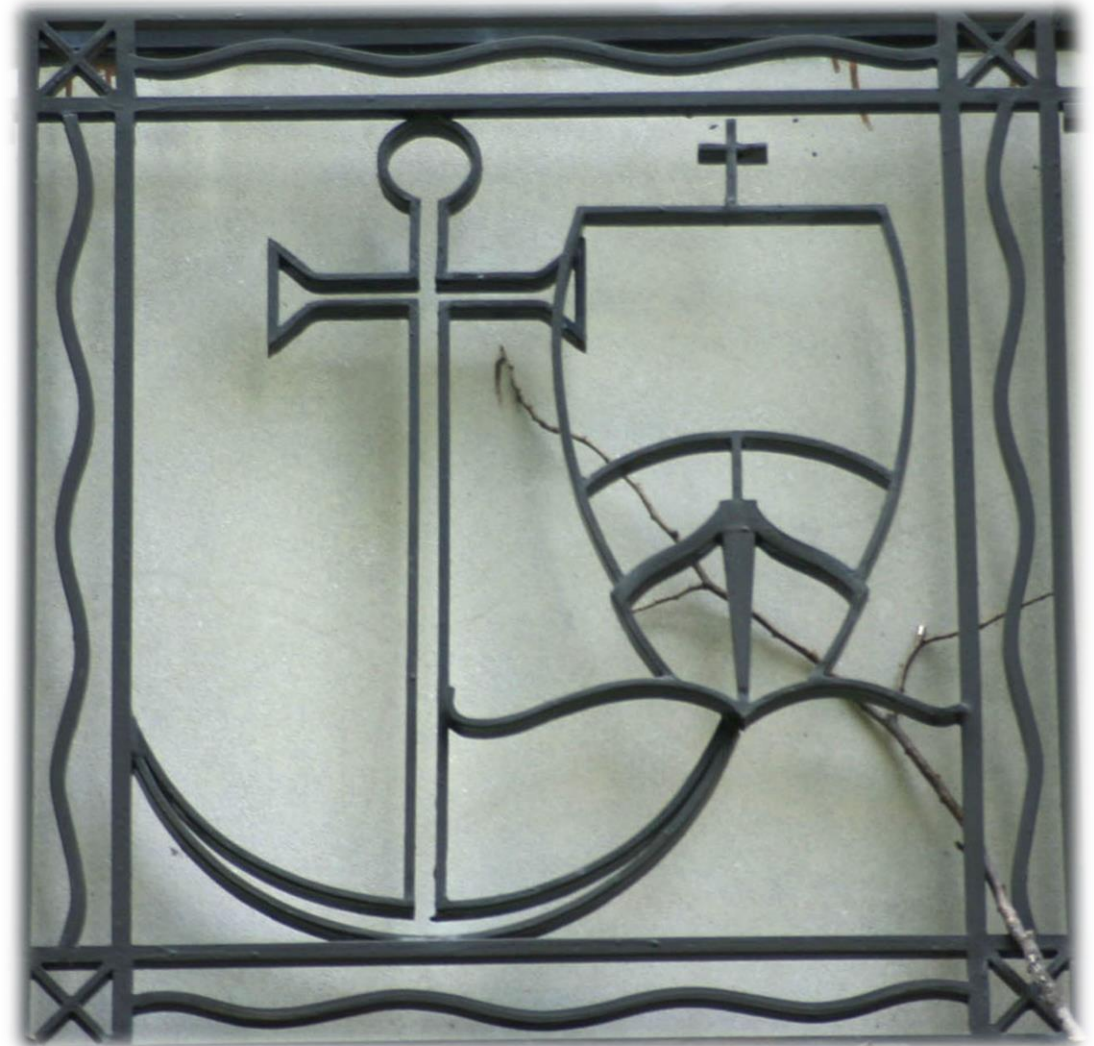
Cross-Anchor with Ship, Record number: [46034