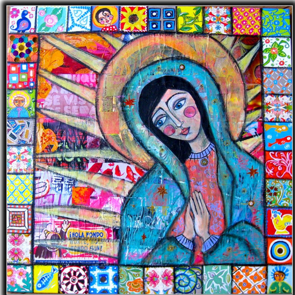
Merciful Mother, Multi-media