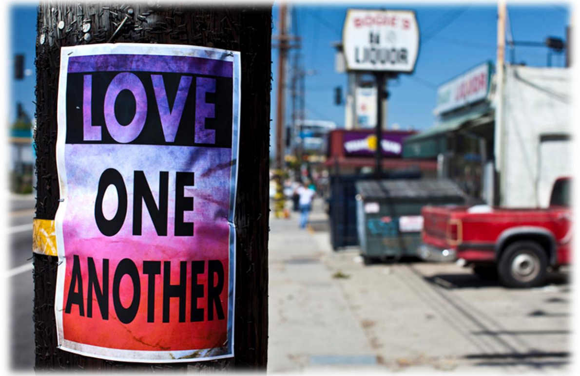
Love One Another, Record number: [55171]

A new commandment I give to you, that you love one another as I have loved you. John 13.34