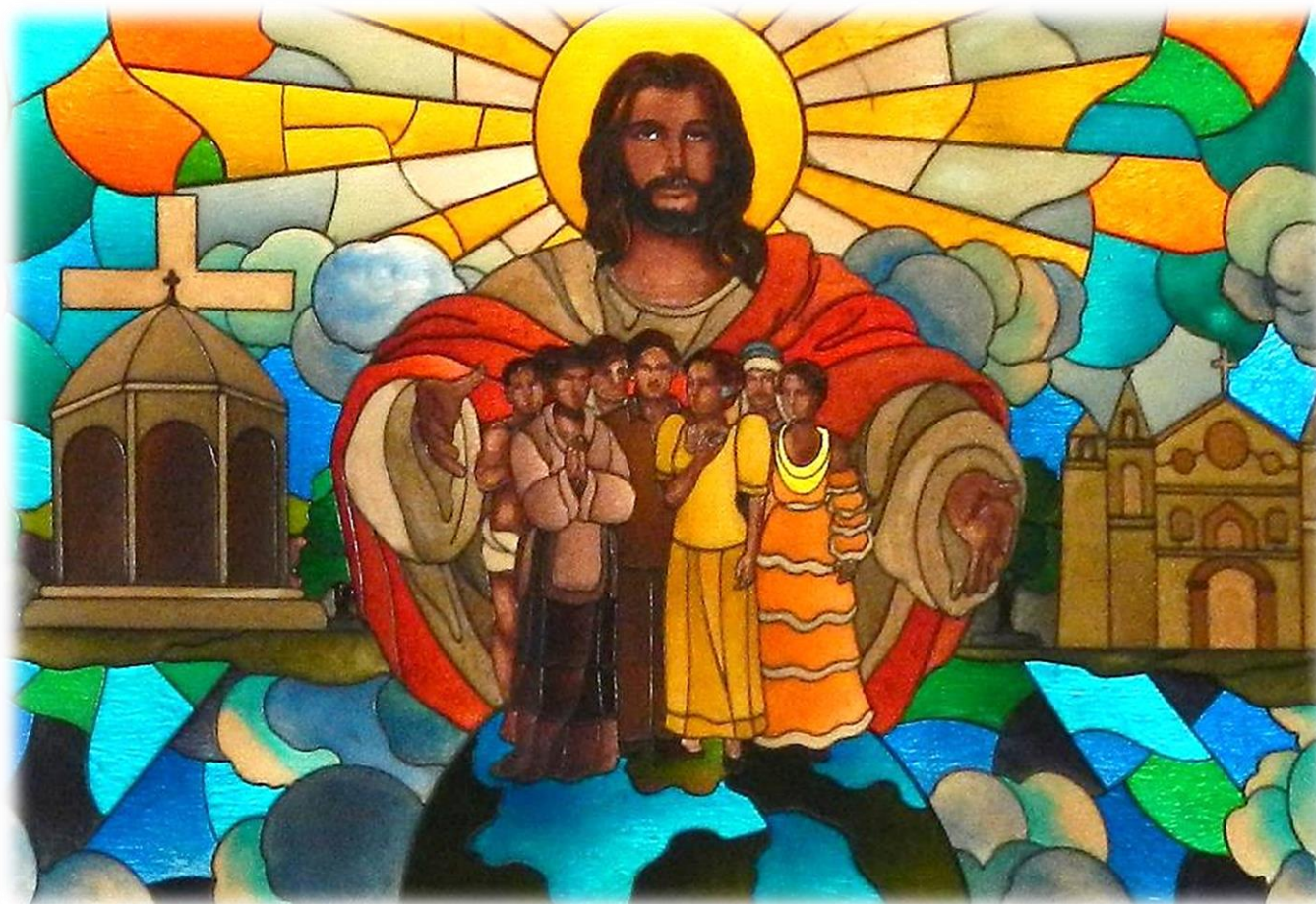
Christ Cares for All -- Church of the Natividad, Pangasinan, Philippines