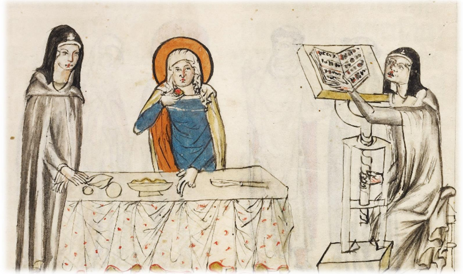
St. Hedwig of Silesia Listening to a Reading -- Getty Center, Los Angeles, CA