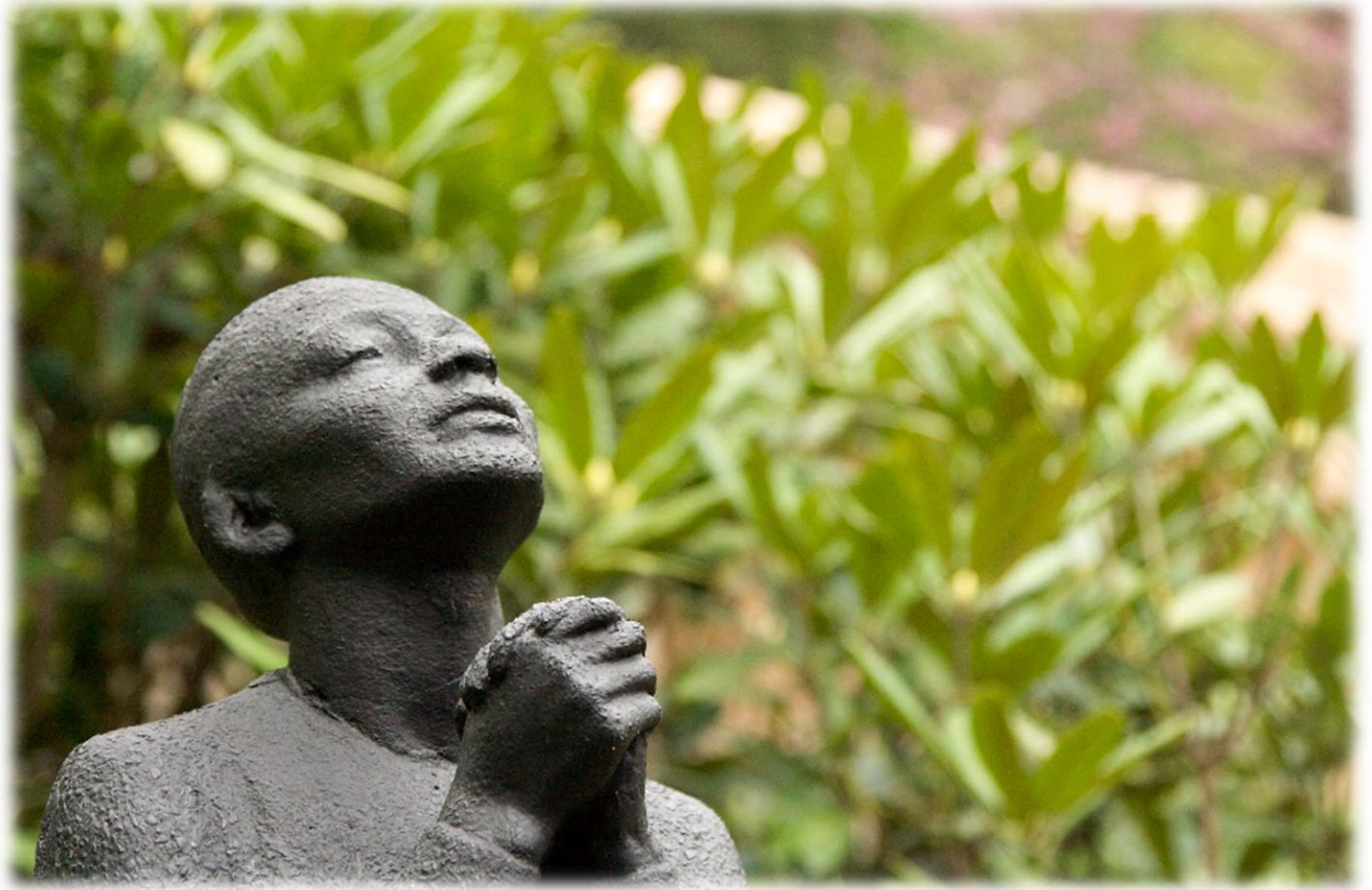
Rose McClendon in Prayer -- Richmond Barthe, Fallingwater, PA