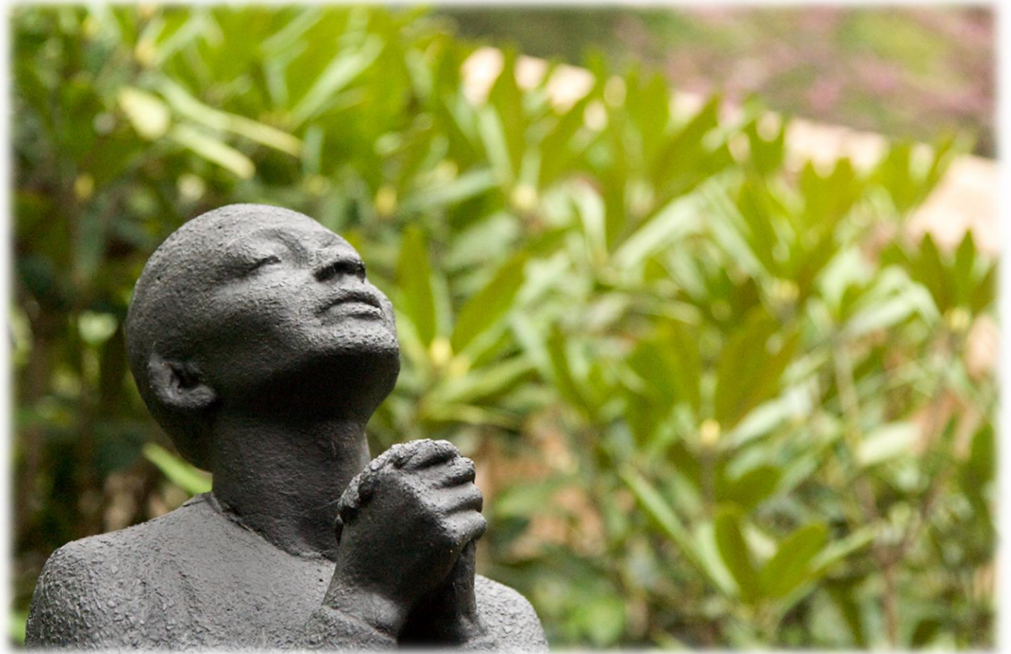
Rose McClendon in Prayer -- Richmond Barthe, Fallingwater, PA