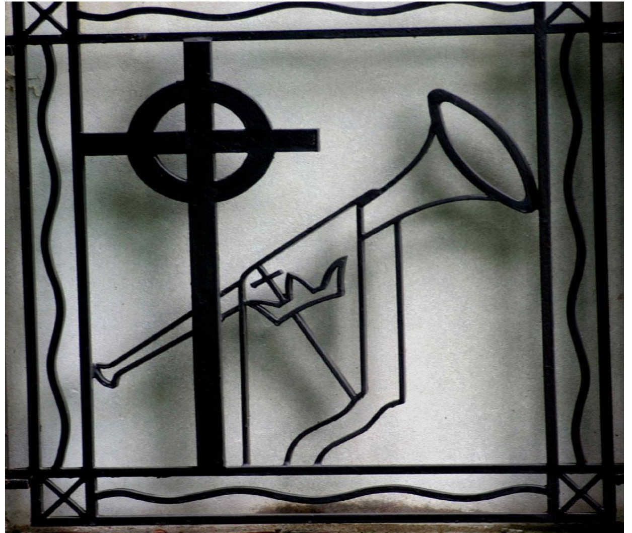
Cross with Trumpet, a project of the Vanderbilt Divinity Library Benton Chapel, Vanderbilt University, Nashville, TN