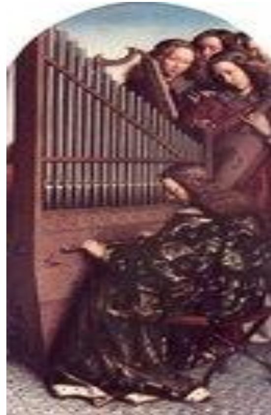
Altar of the Mystical Lamb – Angels Playing Music Hubert van Eyck Ghent altarpiece, Ghent, Belgium