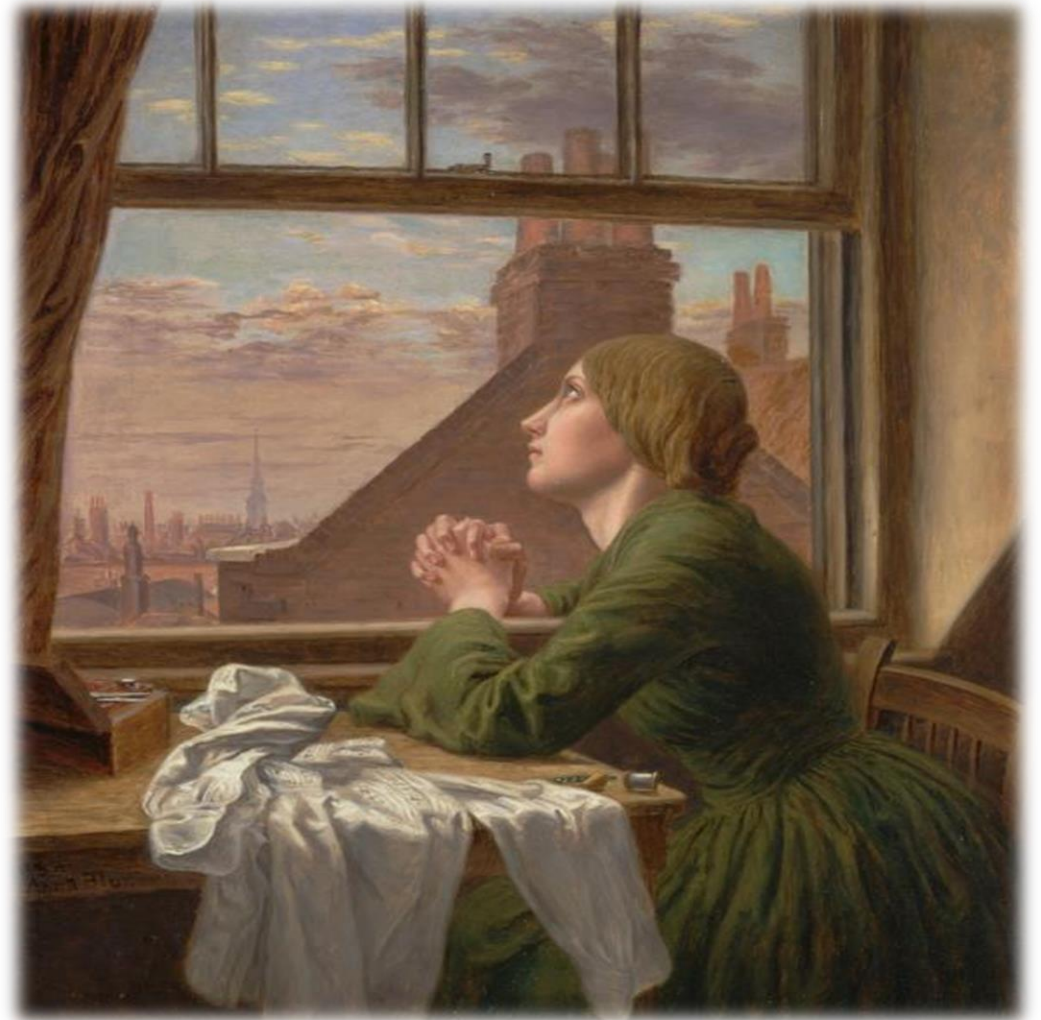
The Seamstress, Anna Blunden Yale Center for British Art, New Haven, CT

Let us offer our lives and gifts to God, trusting that the God of righteousness will purify them, like a new garment, and refine them, like silver and gold, so that they may be worthy of praise and pleasing to the Lord.