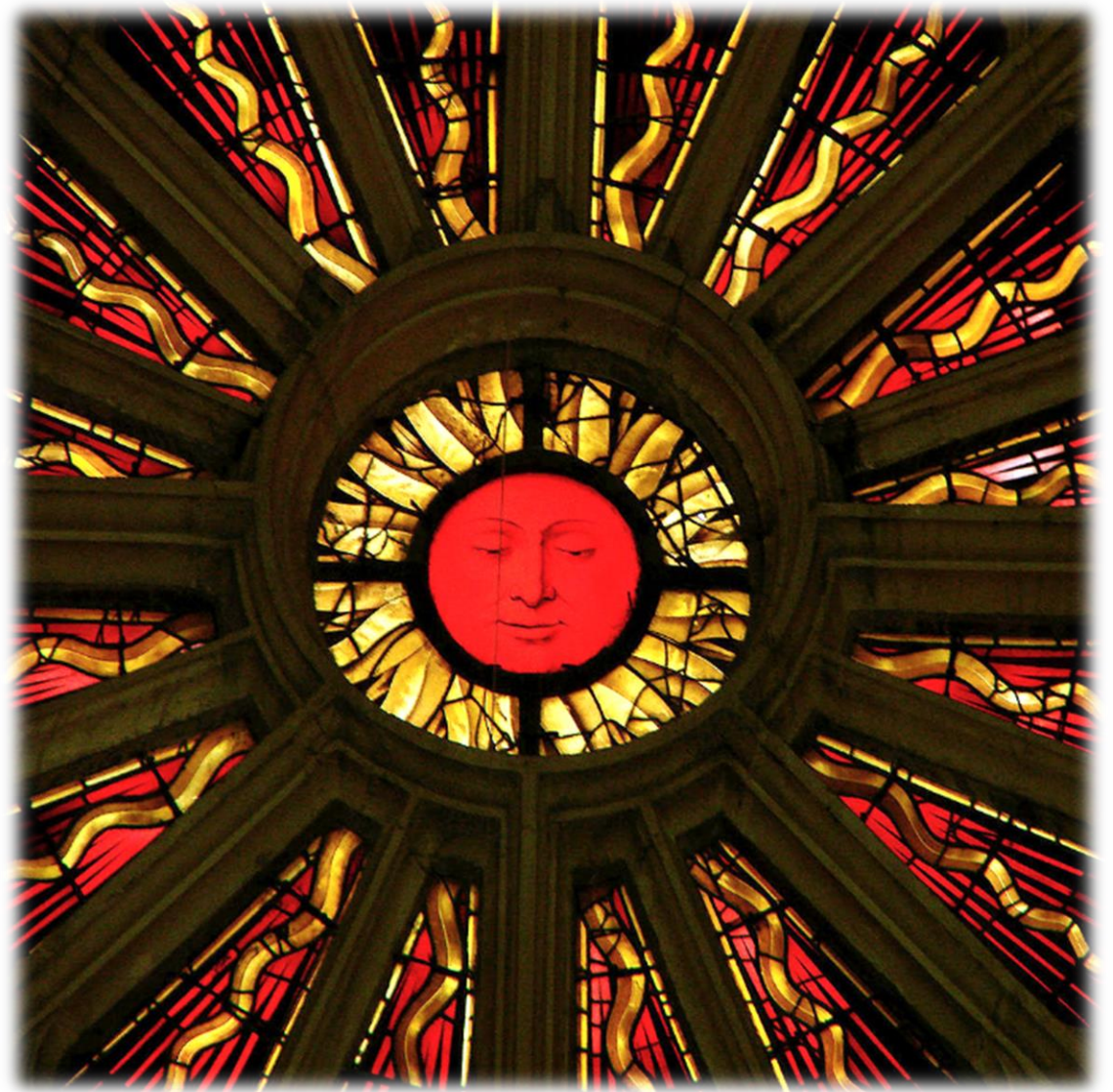
God's Shining Face, Church of St. Nicolas Saint-Nicolas-de-Port, France