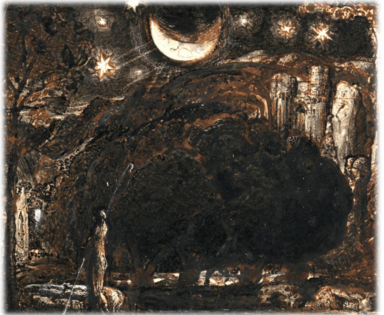
Shepherd, Palmer, Samuel, 1805-1881