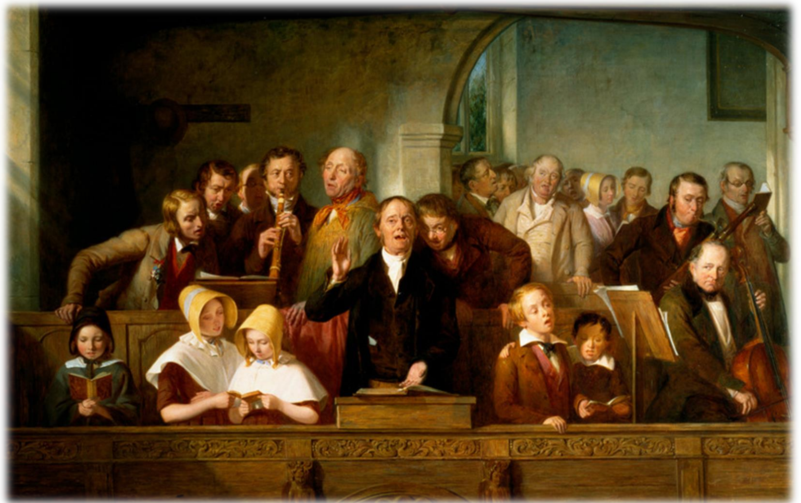
Village Choir, Webster, Thomas George, 1800-1886