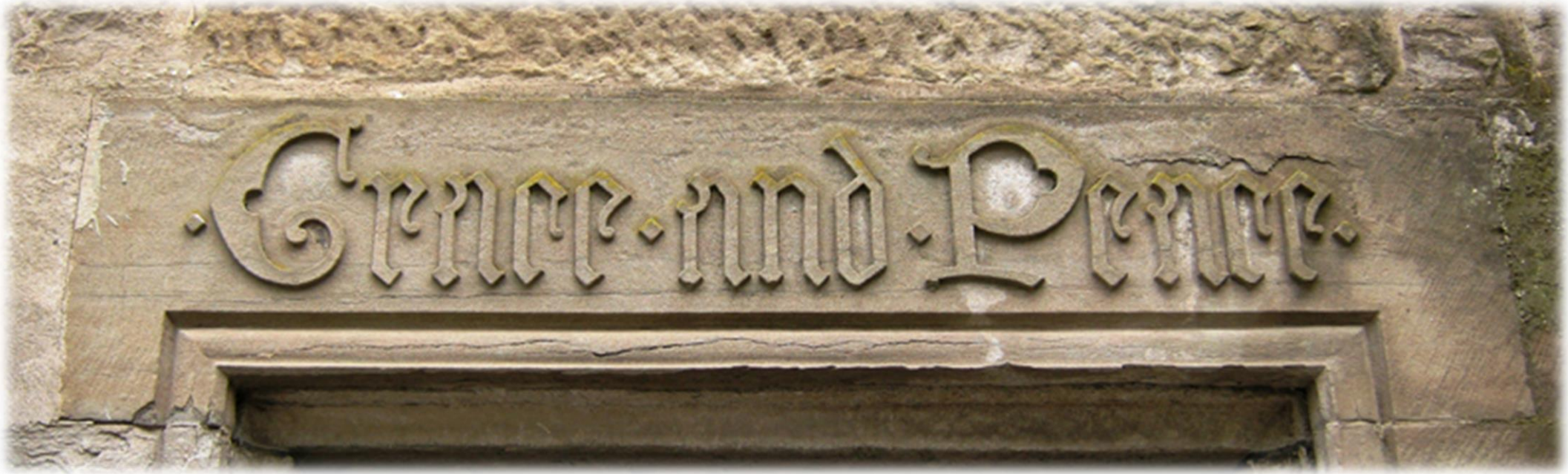
Grace and Peace

Please help us maintain Social distancing by exiting, row by row, beginning at the back of the Church. Thank you.