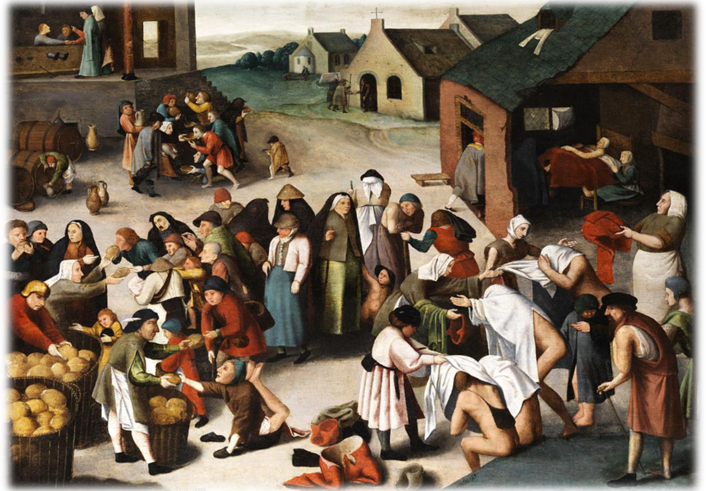
Seven Acts of Mercy, P. Bruegel

Gospel of Christ According to Matthew 25: 31-46