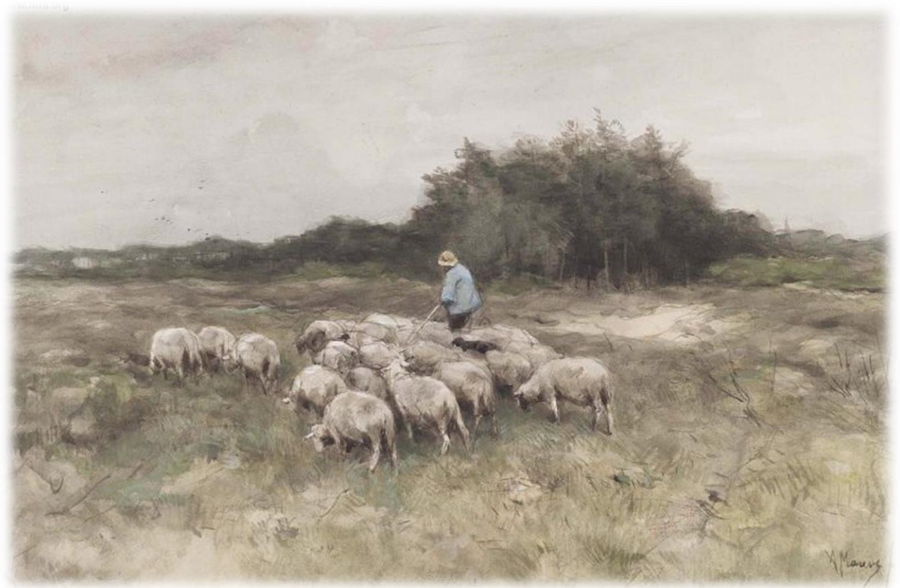
Landscape with Shepherd and Sheep, Mauve, Anton, 1838-1888