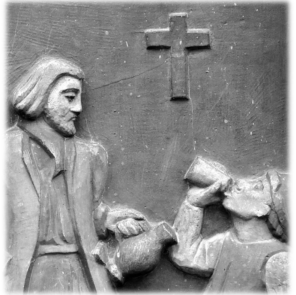
Food for the Hungry, Drink for the Thirsty