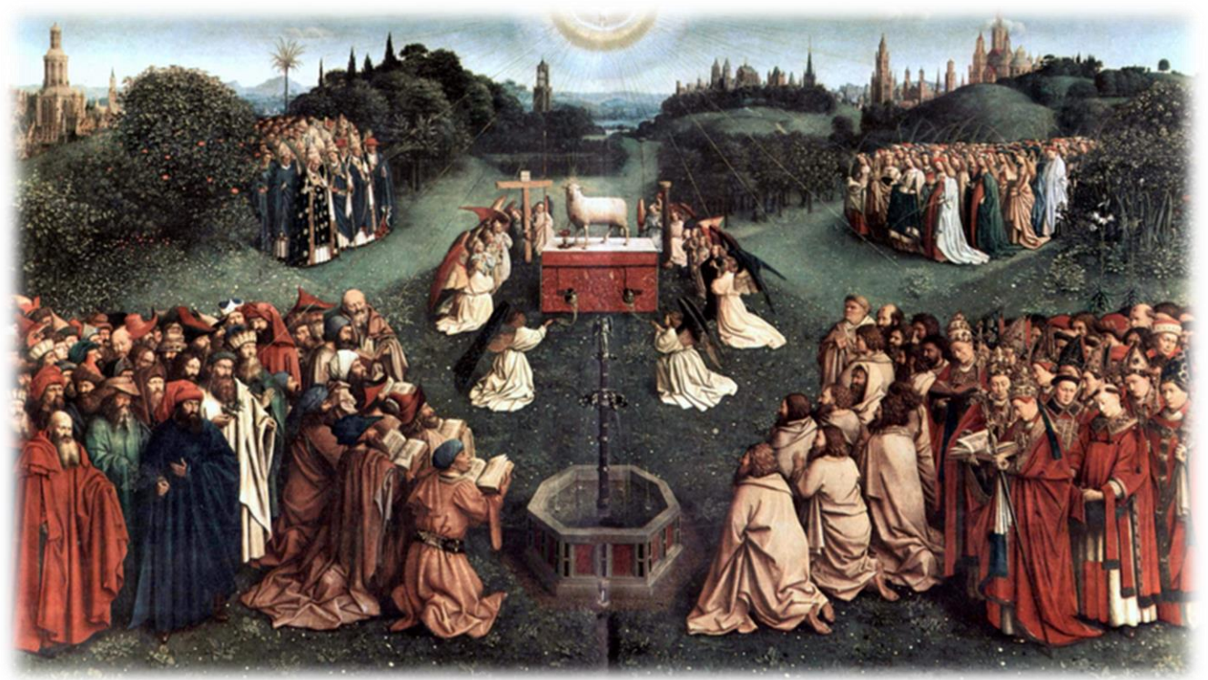
Altar of the Mystical Lamb, The Arrival of the Mystical Lamb