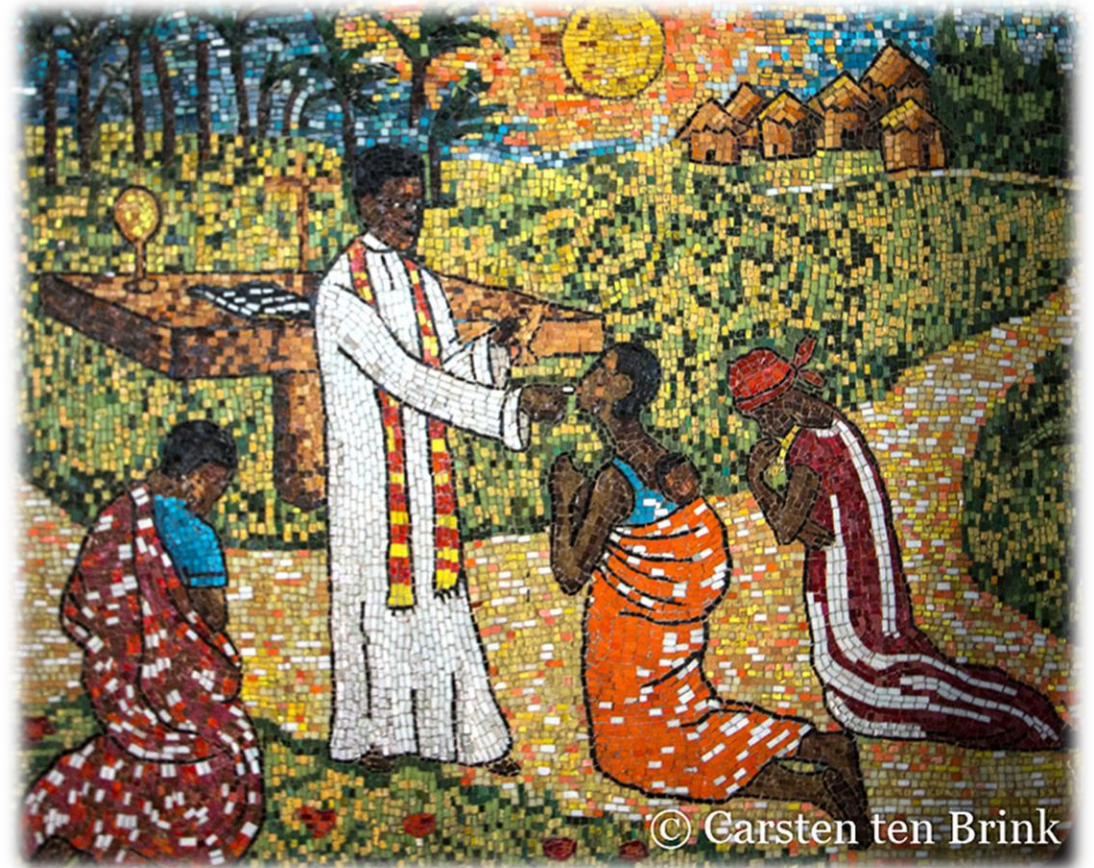
Sharing Communion, Unidentified mosaic artist

Will You Come and Follow Me Love Divine, All Loves Excelling