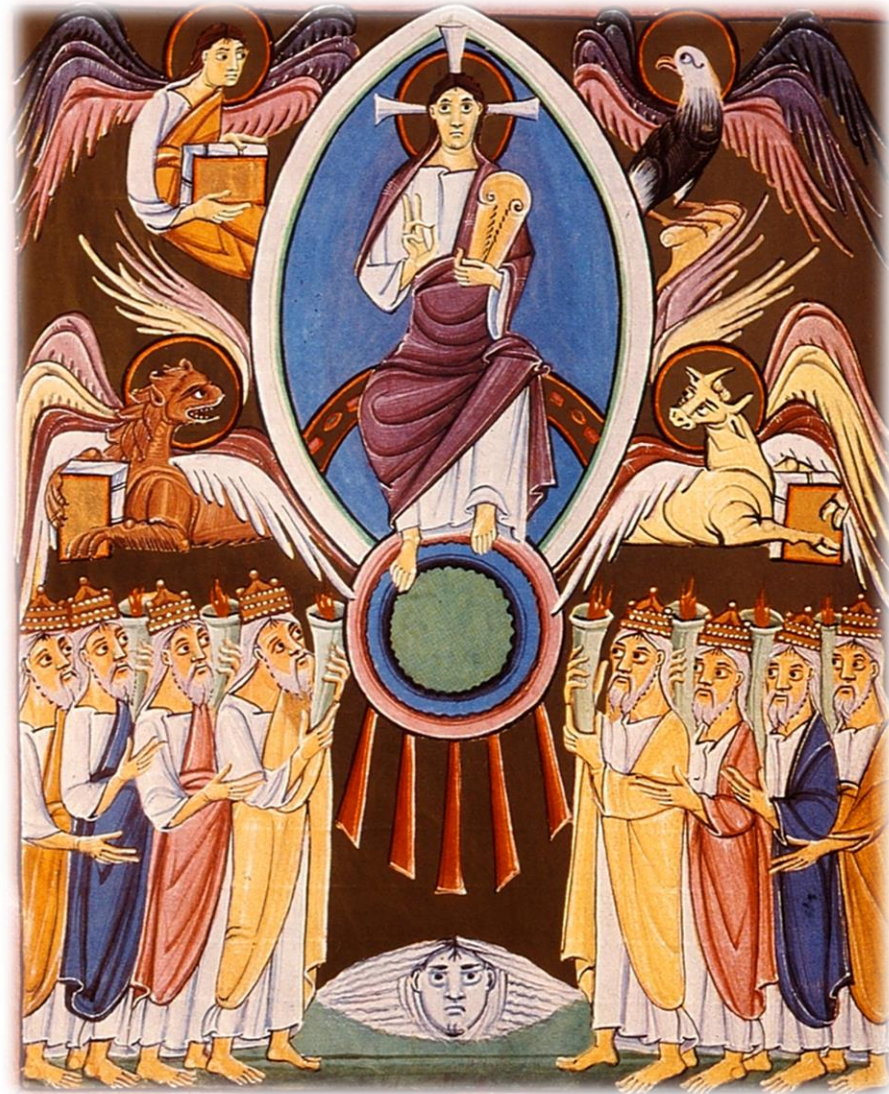
Throne of God with Elders, and Four Evangelist symbols, Record number: [55268]