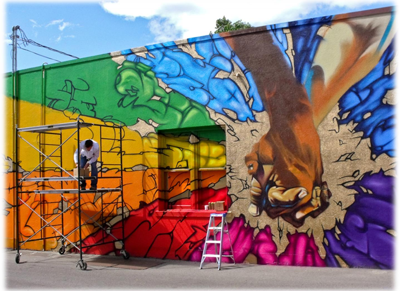
Elements of Peace -- Kelowna, BC, Canada