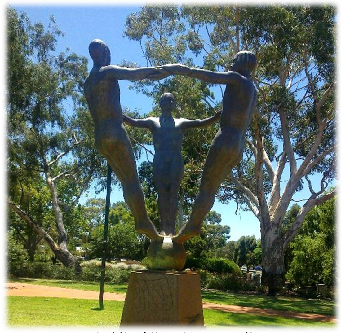
Spirit of the Community Belmont Civic Centre Australia