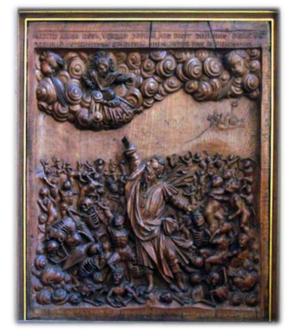
Ezekiel in the Valley of the Dry Bones, Record number: [55163]