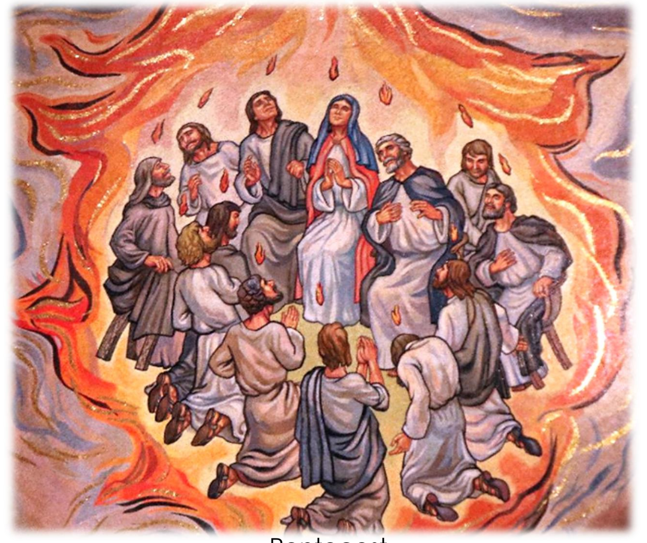
Pentecost Cathedral of St. Louis, St. Louis, MO

The Holy Gospel of Christ according to John 15: 26-27, 16: 4b-15