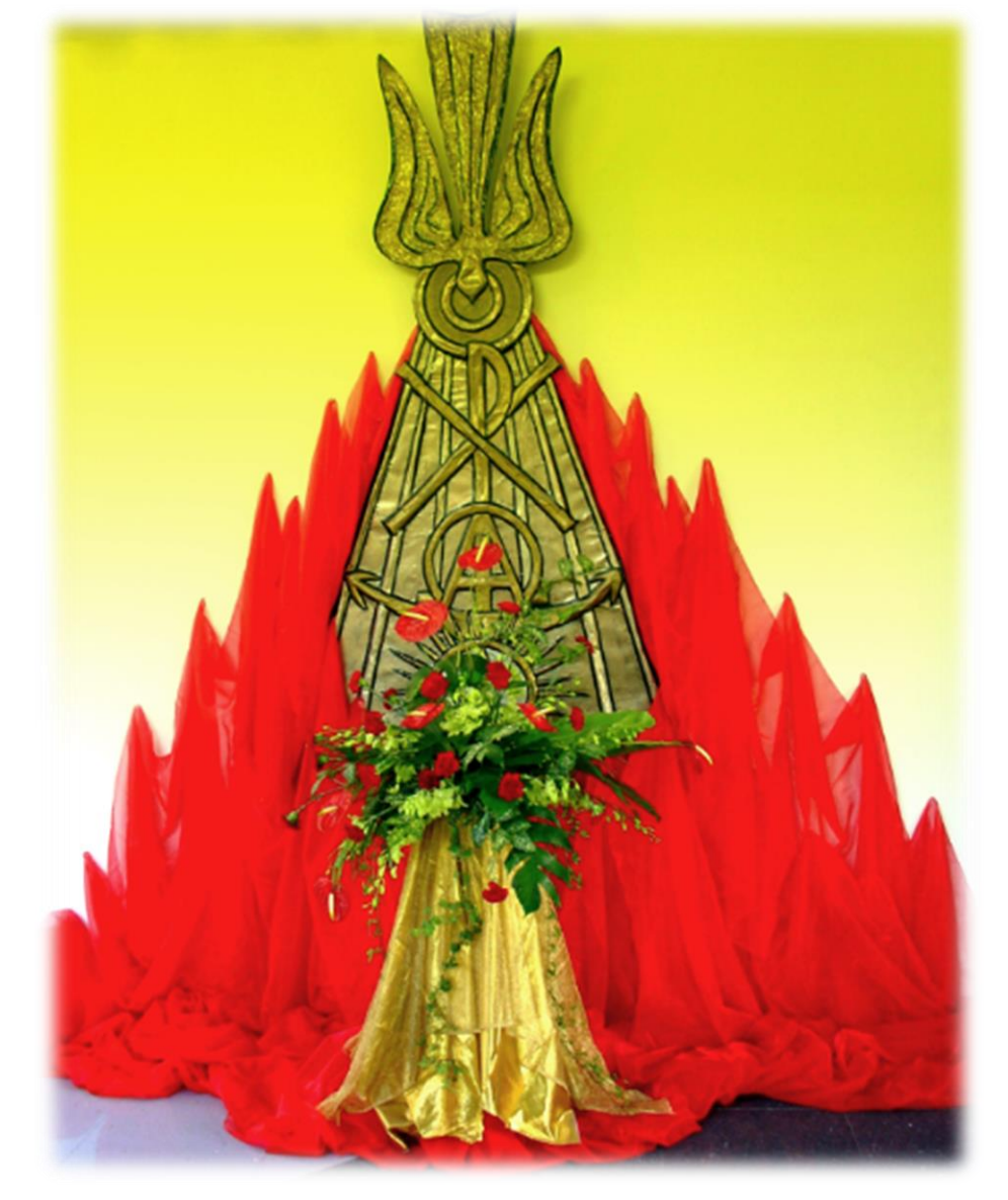
Happy Pentecost, Church of the Holy Spirit Singapore

Come, Holy Spirit, fill the hearts of your faithful; and kindle in us the fire of your love.