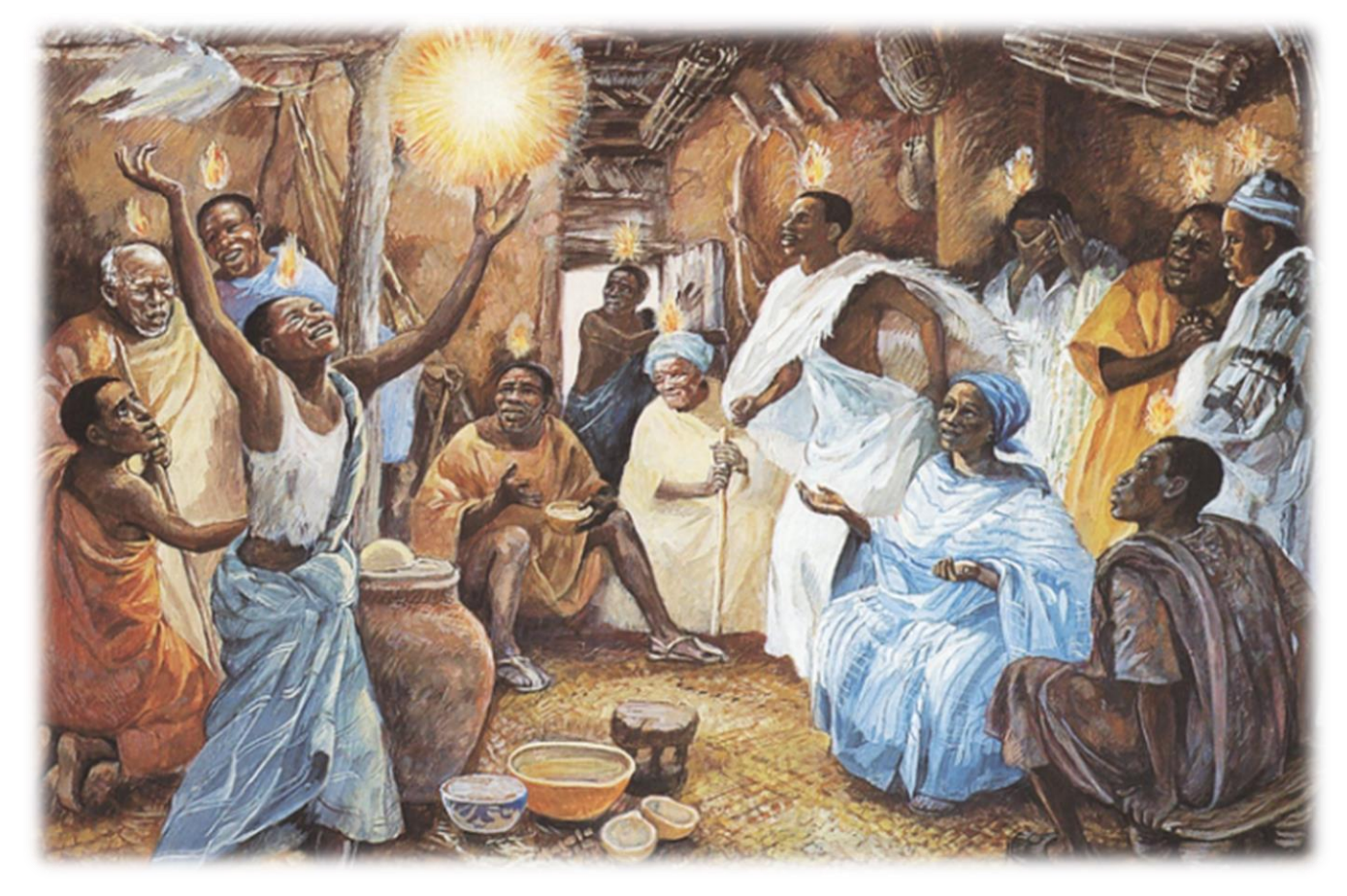
Pentecost -- JESUS MAFA, Cameroon