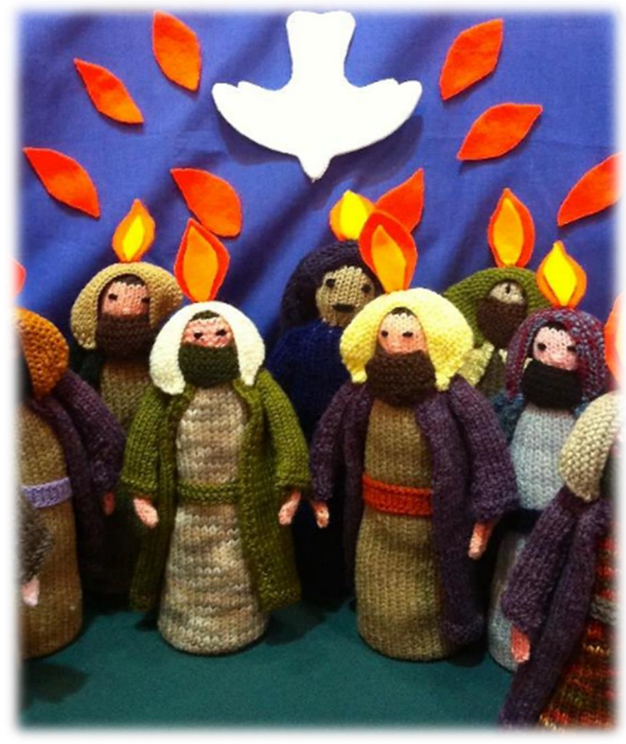
Knitted Apostles at Pentecost Society for Promoting Christian Knowledge Lower Green, England