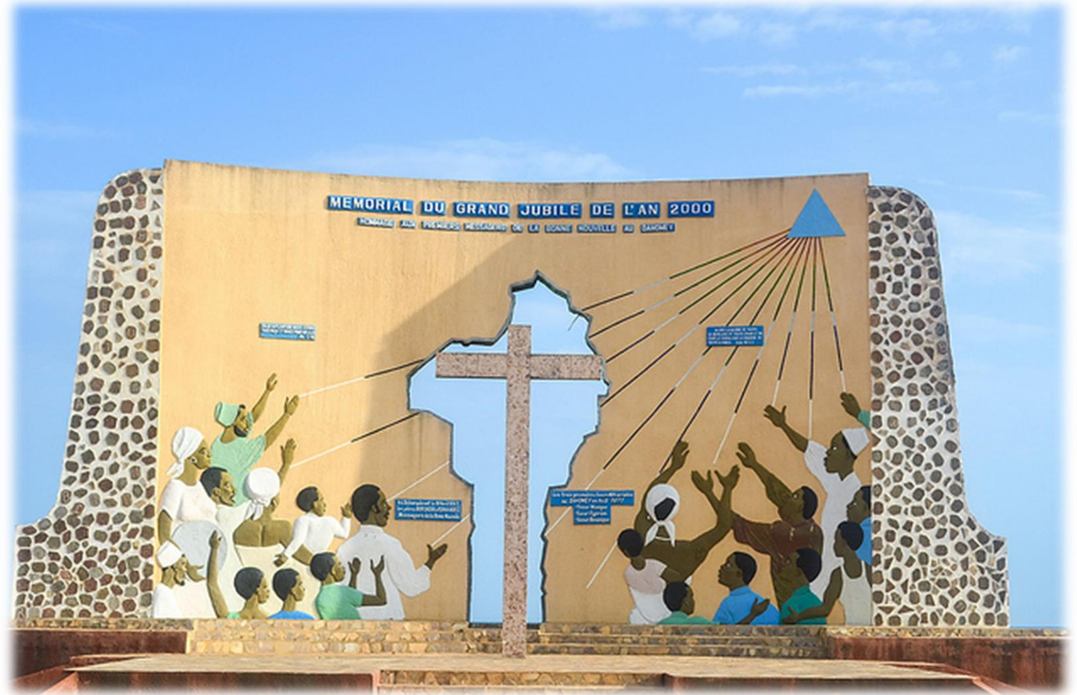
Jubilee Monument -- Ouidah, Benin