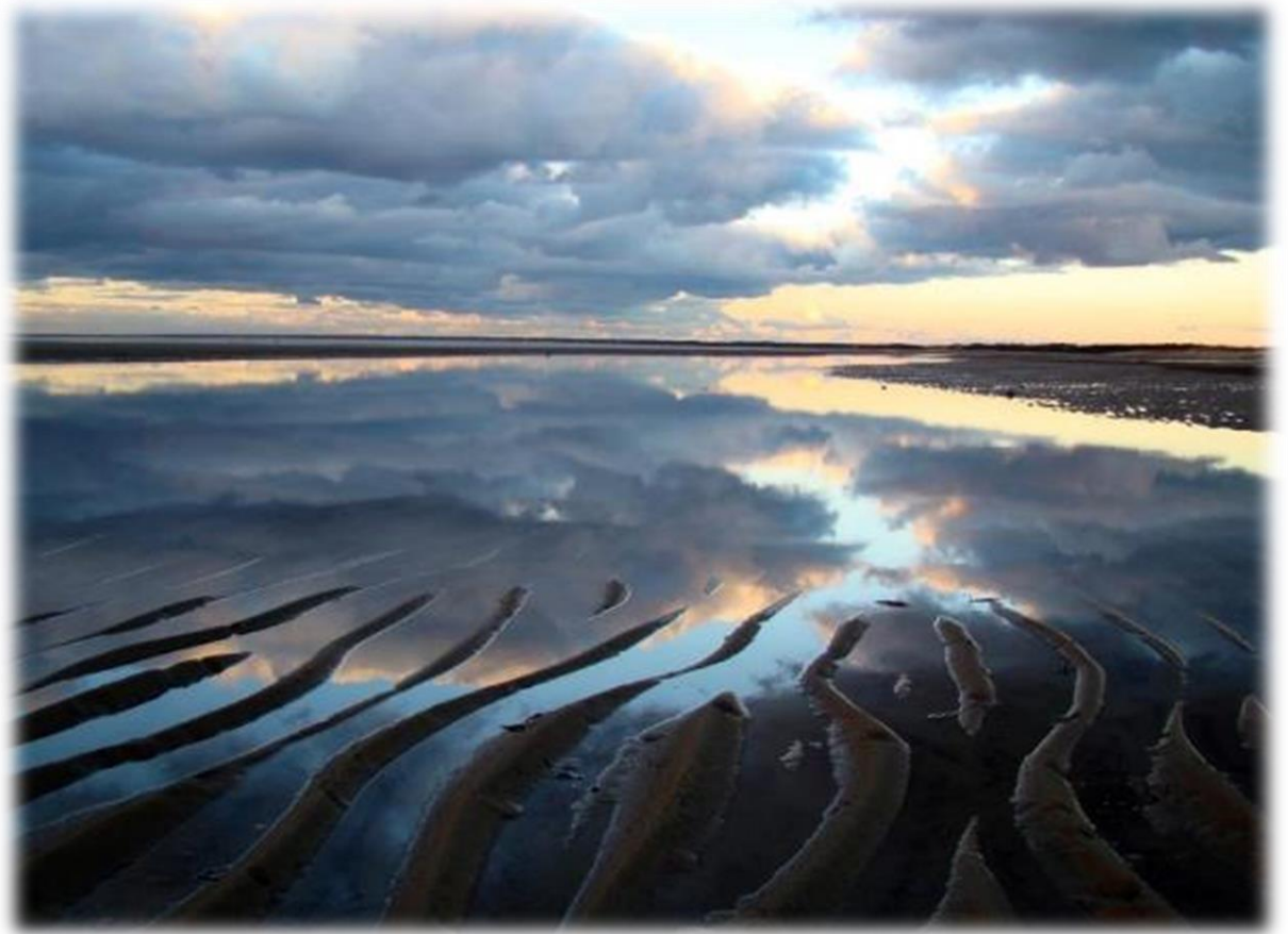
Ascension -- Joanna Vaughn, Cape Cod Bay