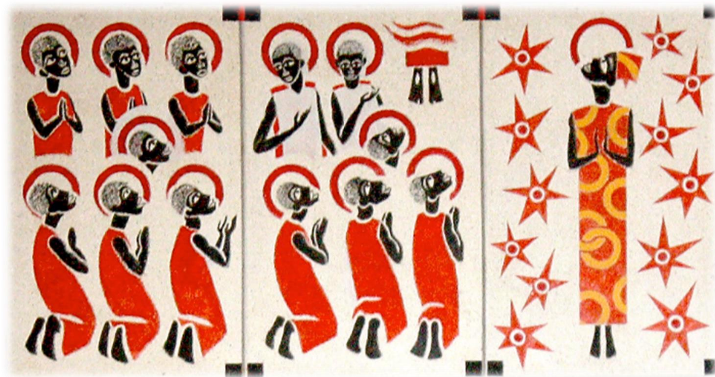
Ascension -- Keur Moussa Abbey, Keur Moussa, Senegal