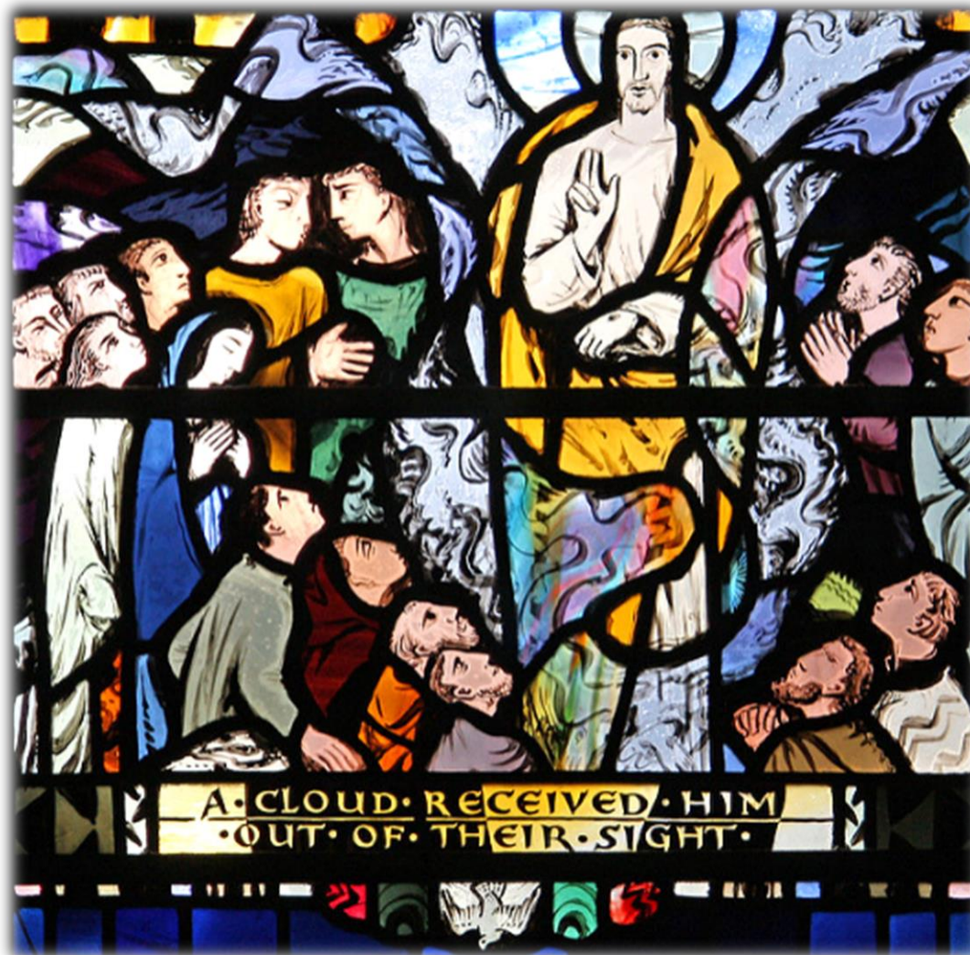
Ascension, Church of St Elthedreda London, England

The Gospel of Christ according to Luke 24: 44-53