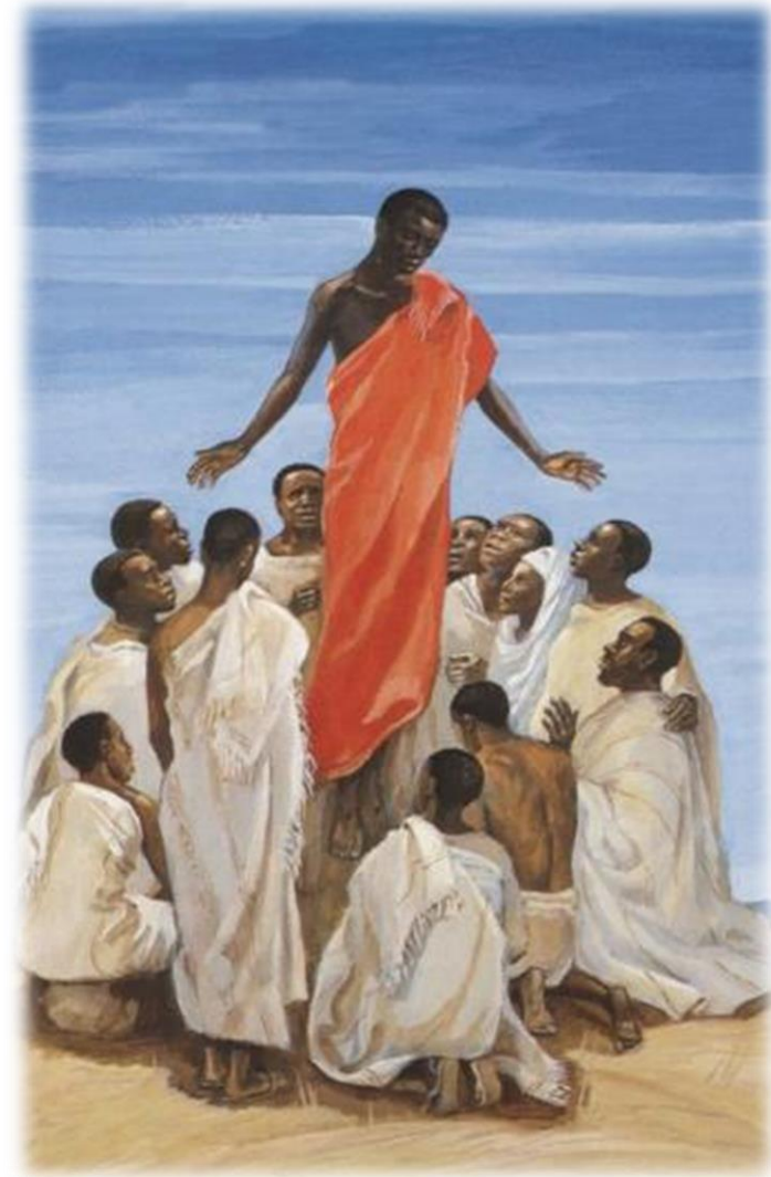
The Ascension, JESUS MAFA