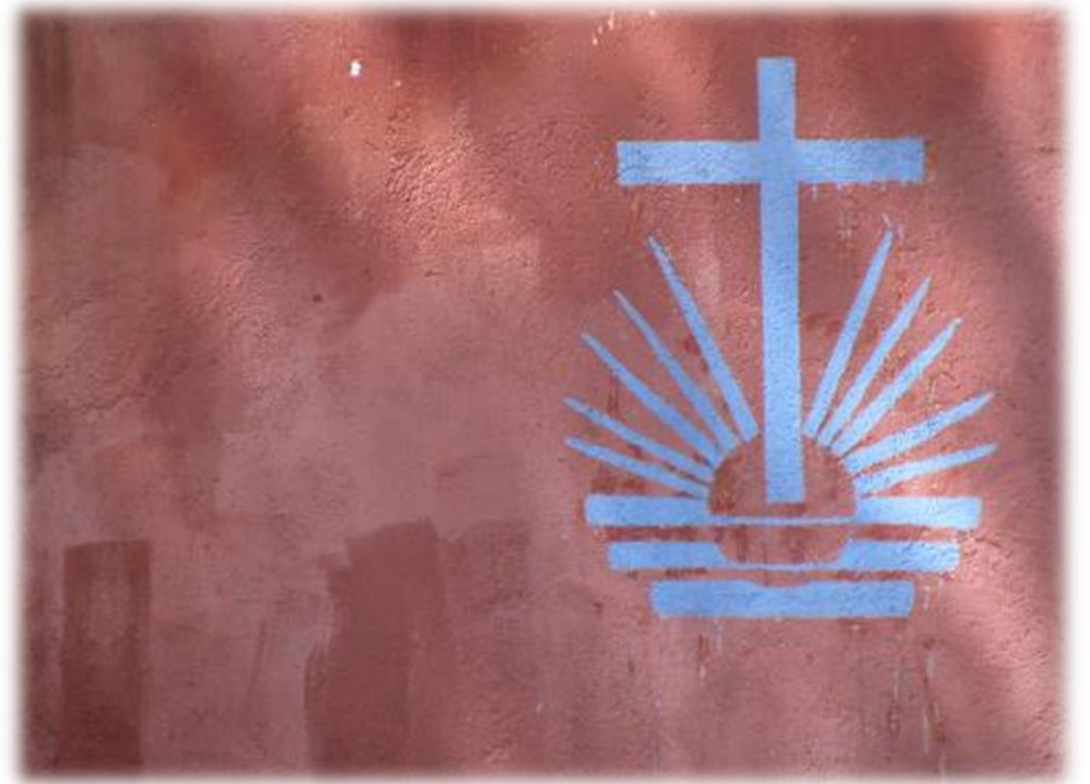
Cross and Rising Sun, Record number: [57417]

From the rising of the sun to its setting my name shall be great among the nations, and in every place incense shall be offered to my name, and a pure offering; for my name shall be great among the nations, says the Lord of hosts.