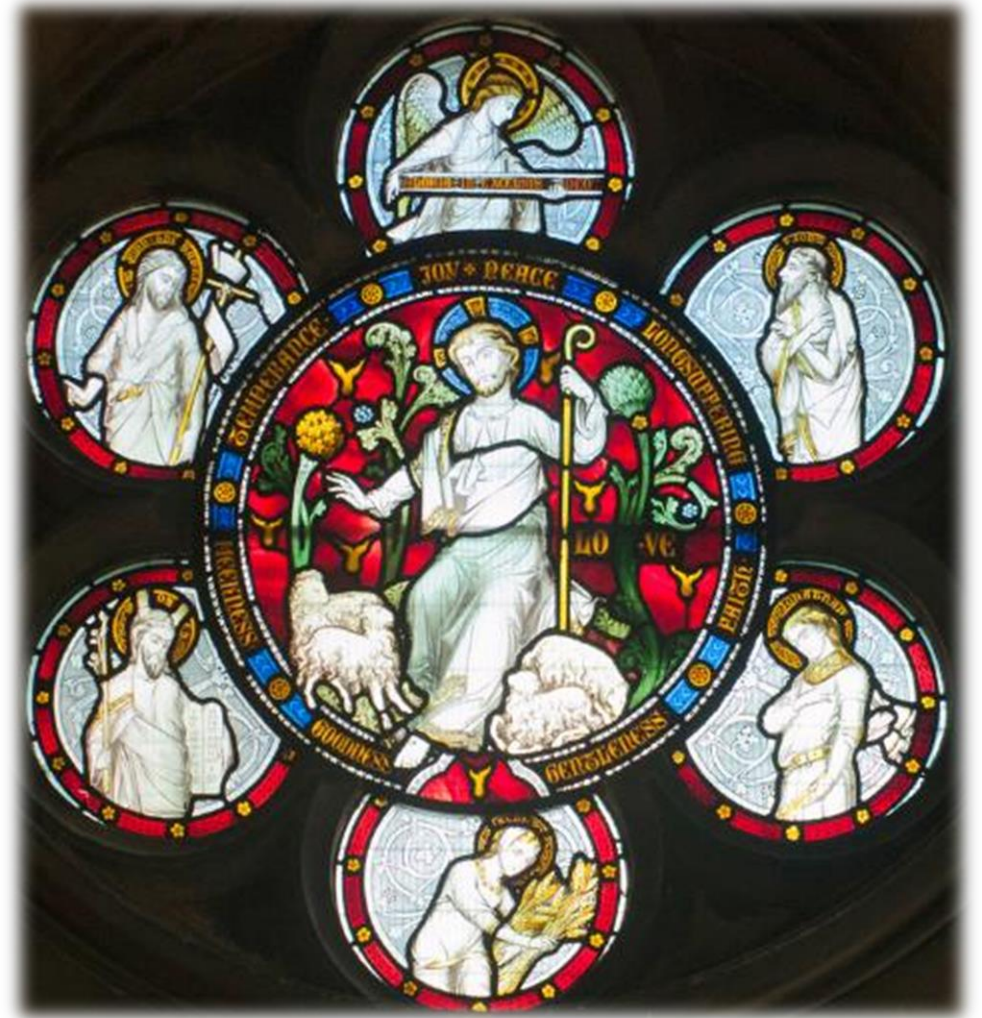
Fruits of the Spirit, Record number: [55637]

The fruit of the Spirit is love, joy, peace, patience, kindness, goodness, faithfulness, gentleness, self-control. If we live by the Spirit, let us also walk By the Spirit. (Galatians 5.22, 23a, 25)