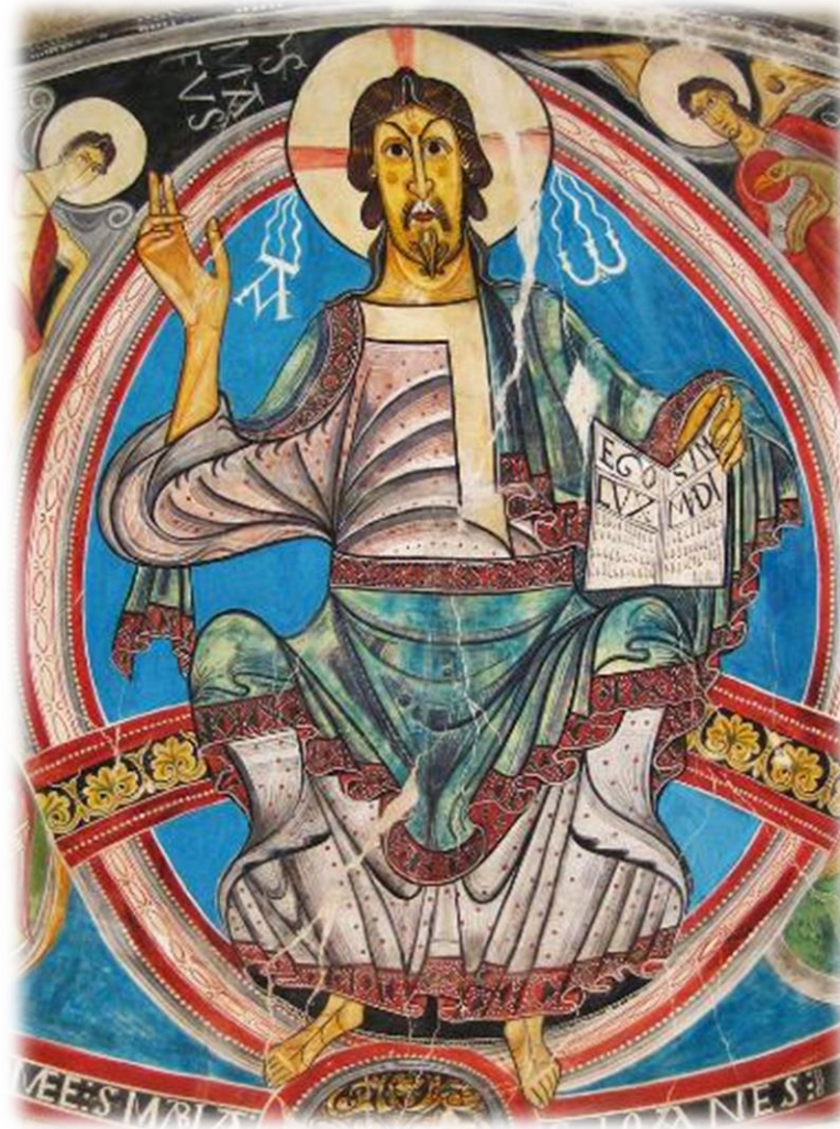
God Reigning in Majesty, Record number: [55258]