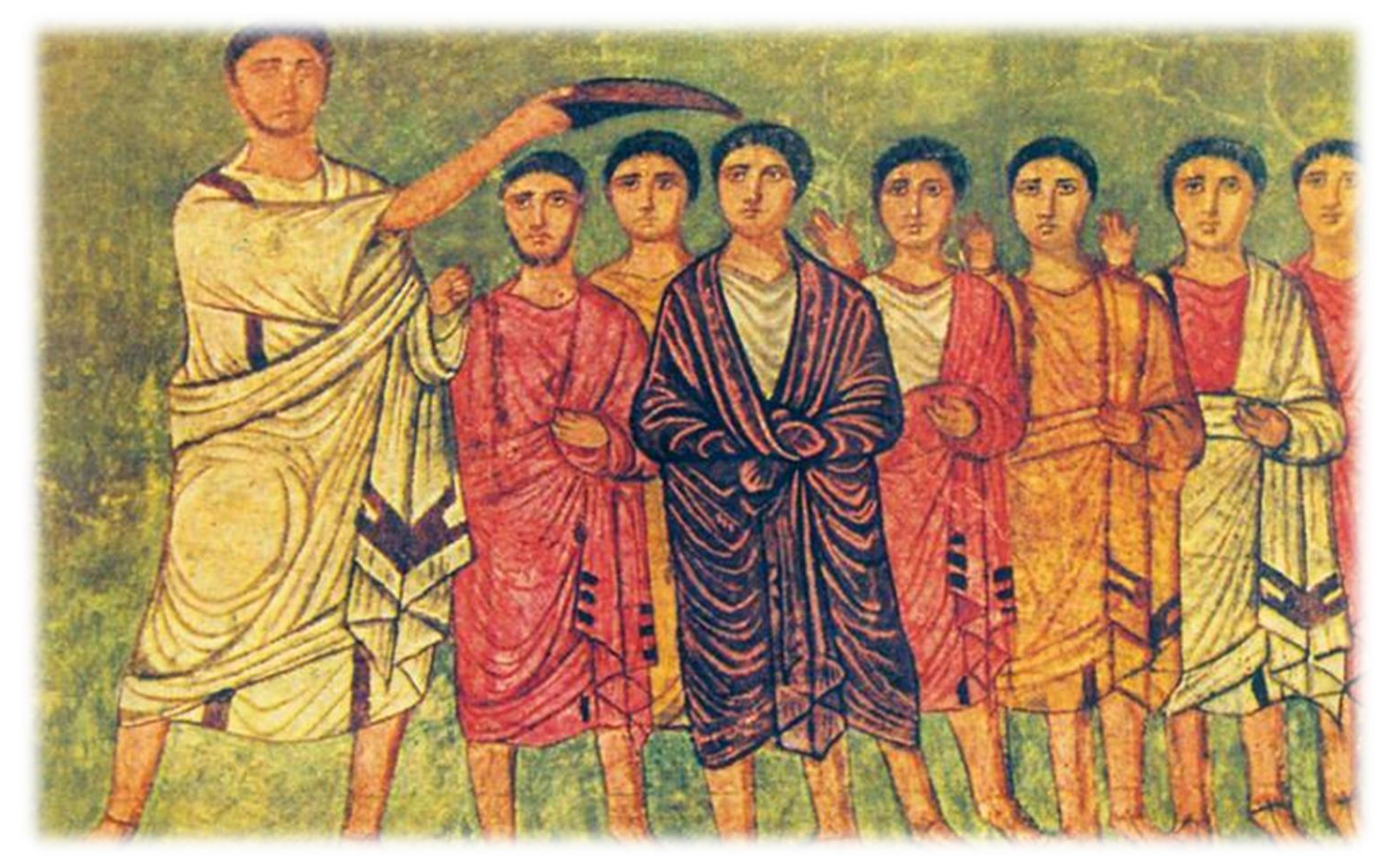
David is Anointed and Affirmed as King, Record number: [58432]