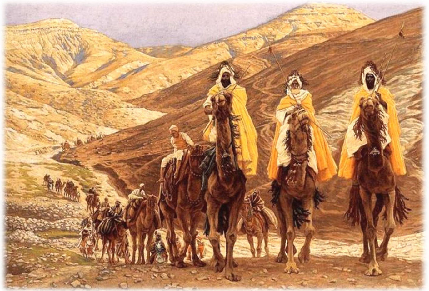
Journey of the Magi , James Tissot, Minneapolis Institute of Art