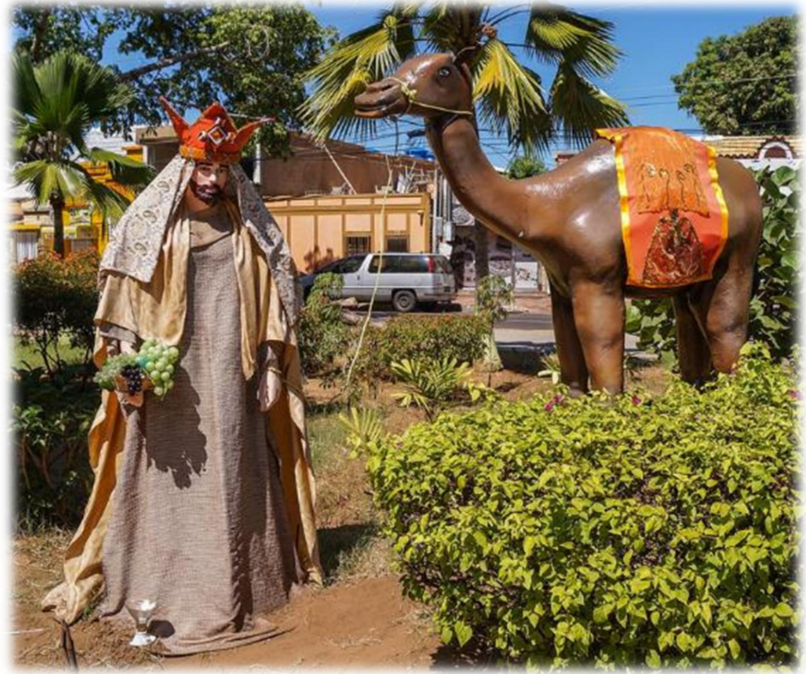
Three Kings, Record number: [56527]