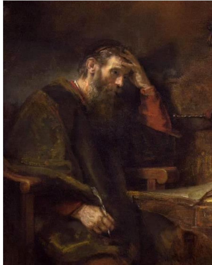
The Apostle Paul, Rembrandt, National Gallery of Art, Washington, DC