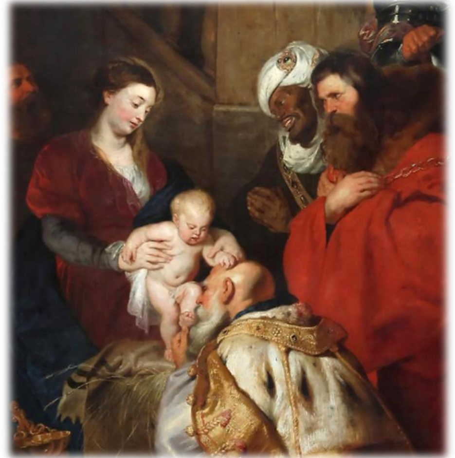
The Magi and the Christ Child, detail Peter Paul Rubens, Royal Museums of Fine Arts of Belgium, Brussels, Belgium