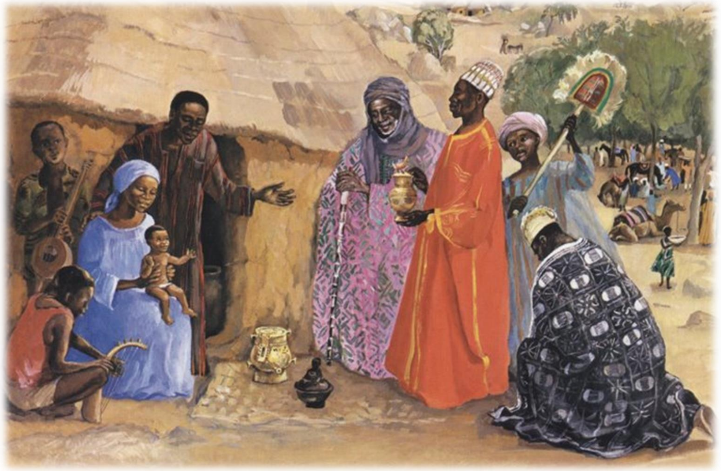
Visit of the Three Wise Men, JESUS MAFA