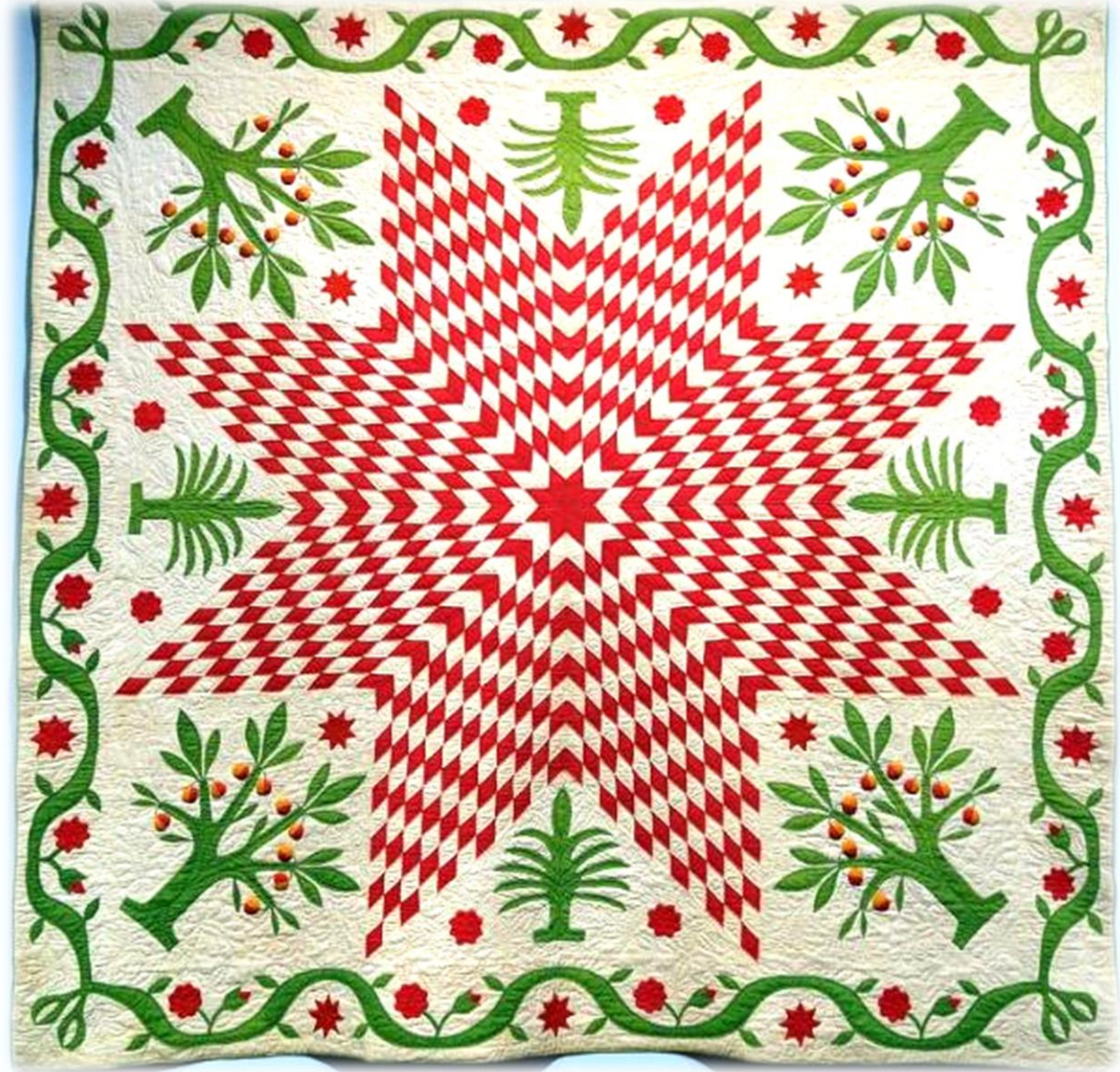
Star of Bethlehem Quilt, Museum of Fine Arts, Boston, MA