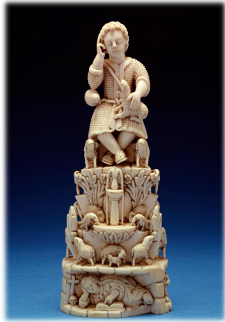
Christ Child as Good Shepherd, Goa, India Walters Art Museum, Baltimore, MD