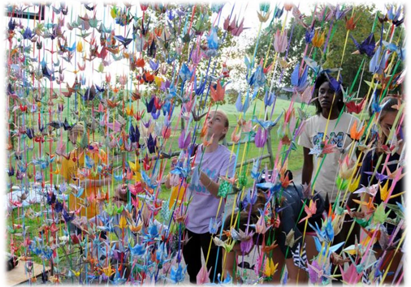
Walk Out of Darkness - Seventh Annual, Record number: [55571]