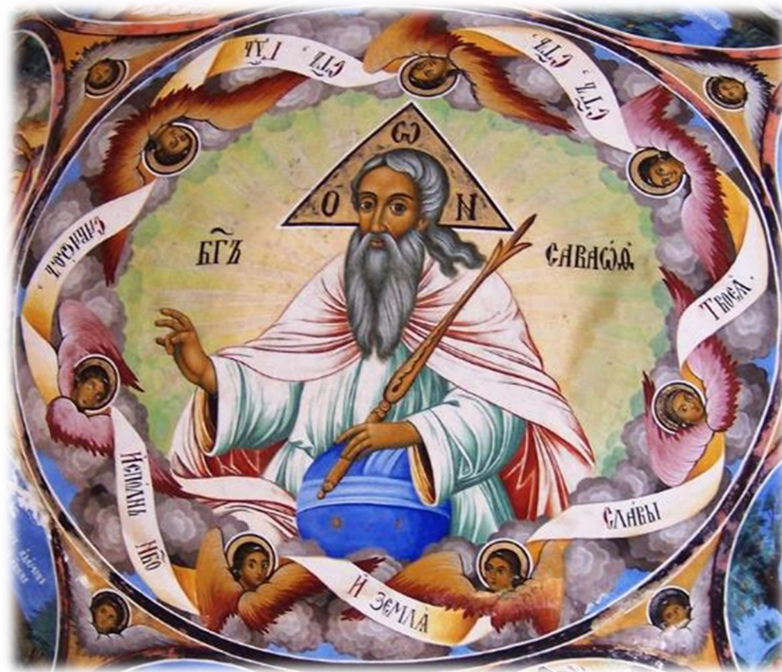
God of Hosts, Monastery of Saint John of Rila, Record number: [55652]