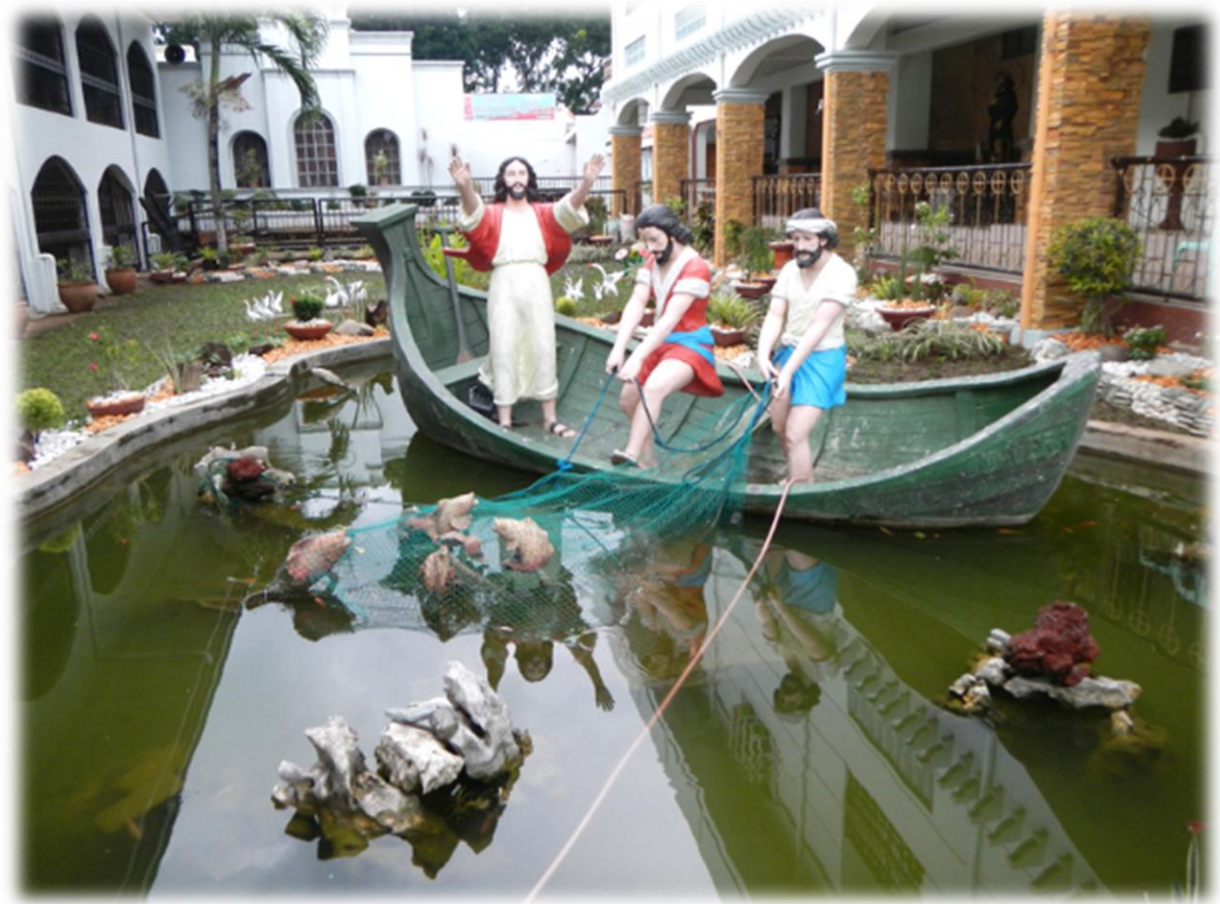
Christ Calling the Disciples -- Nuestra Senora de la Candelaria, Candelaria, Philippines

Gospel of Christ according to Mark 1: 14-20