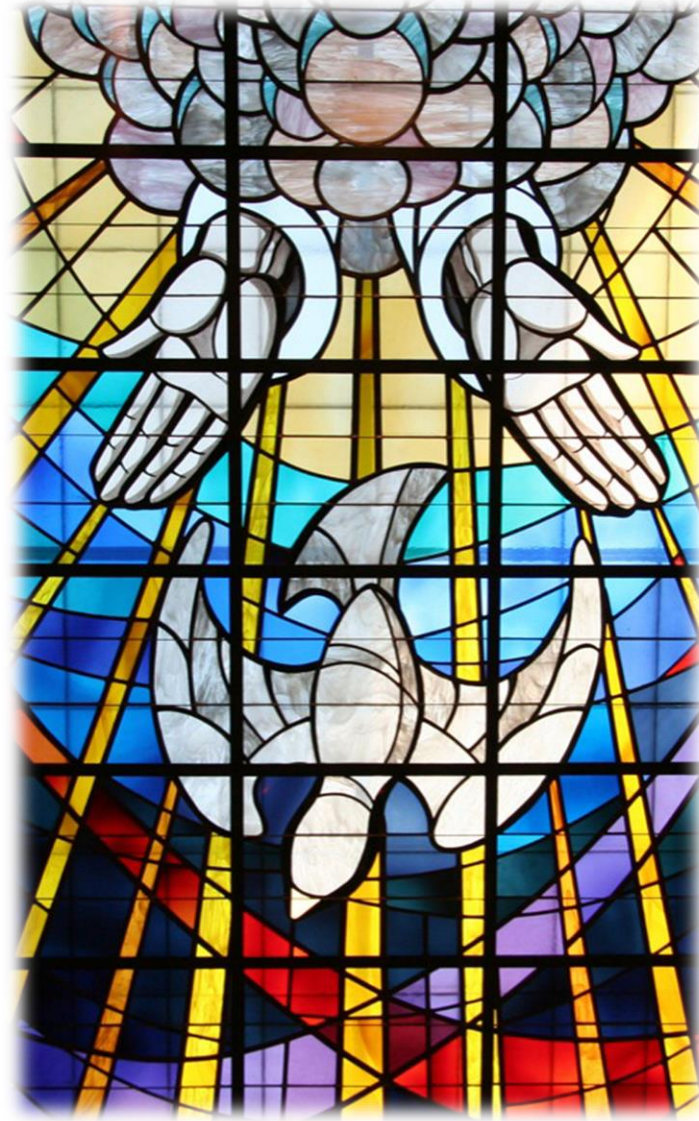
God's Hands and the Holy Spirit, Record number: [56826]