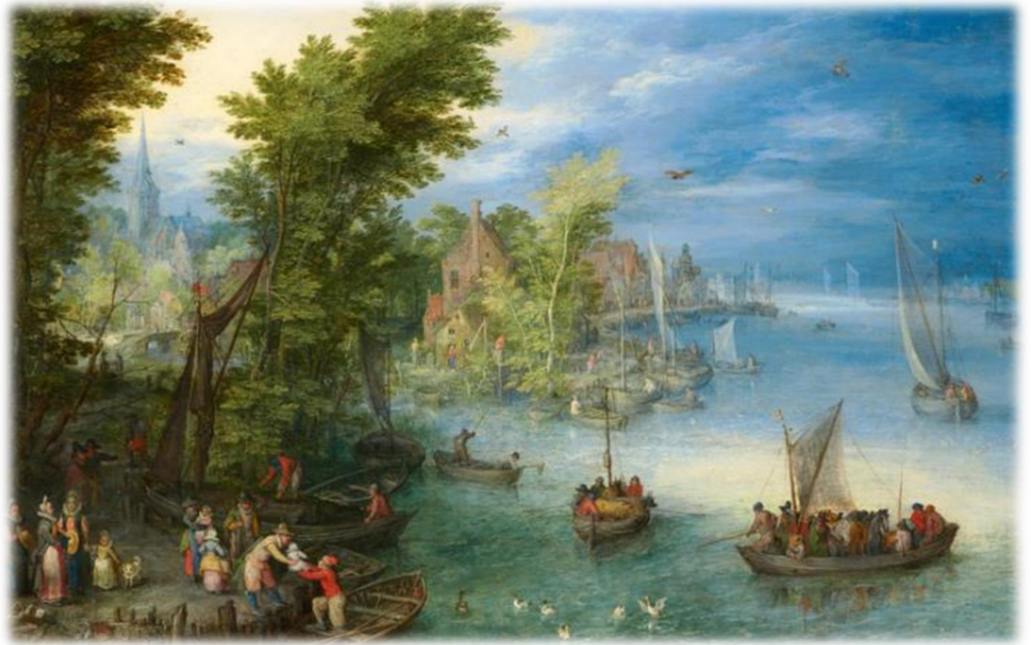
River Landscape, Bruegel, Jan, 1568-1625