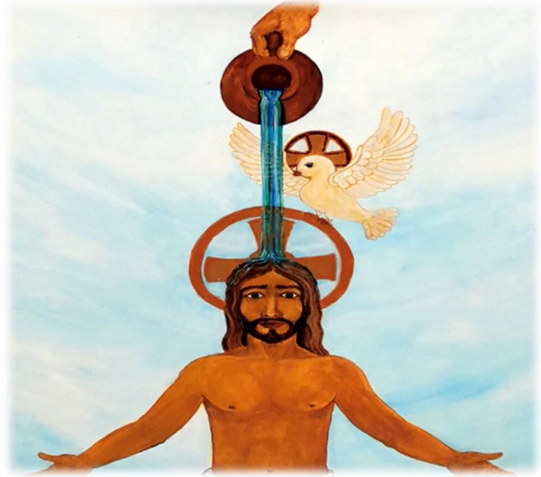
Holy Trinity, Zoltan Joo Church of the Holy Spirit, Veresegyház, Hungary