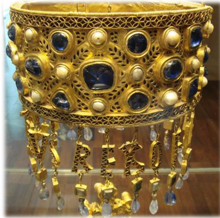
Crown of Reccesuinth, Record number: [54634]

Please respect Social Distancing while exiting – From back to Front.