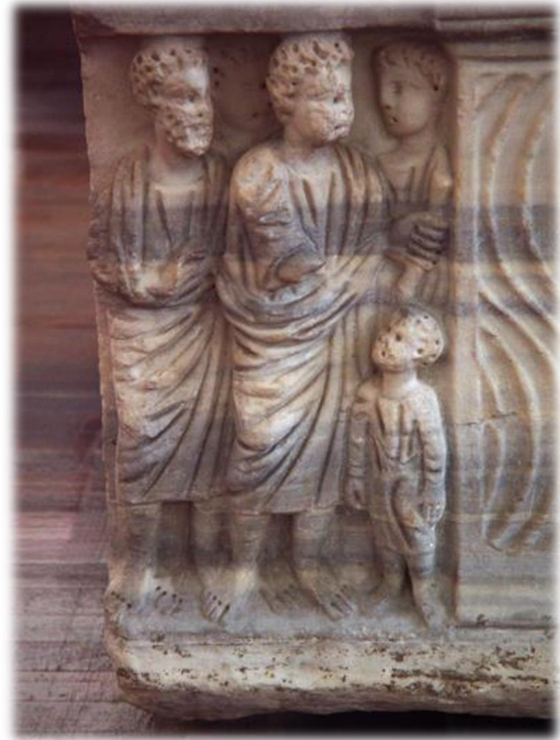
Christ in the Act of Healing, Record number: [51207]

He took our infirmities and bore our diseases. Matthew 8.17