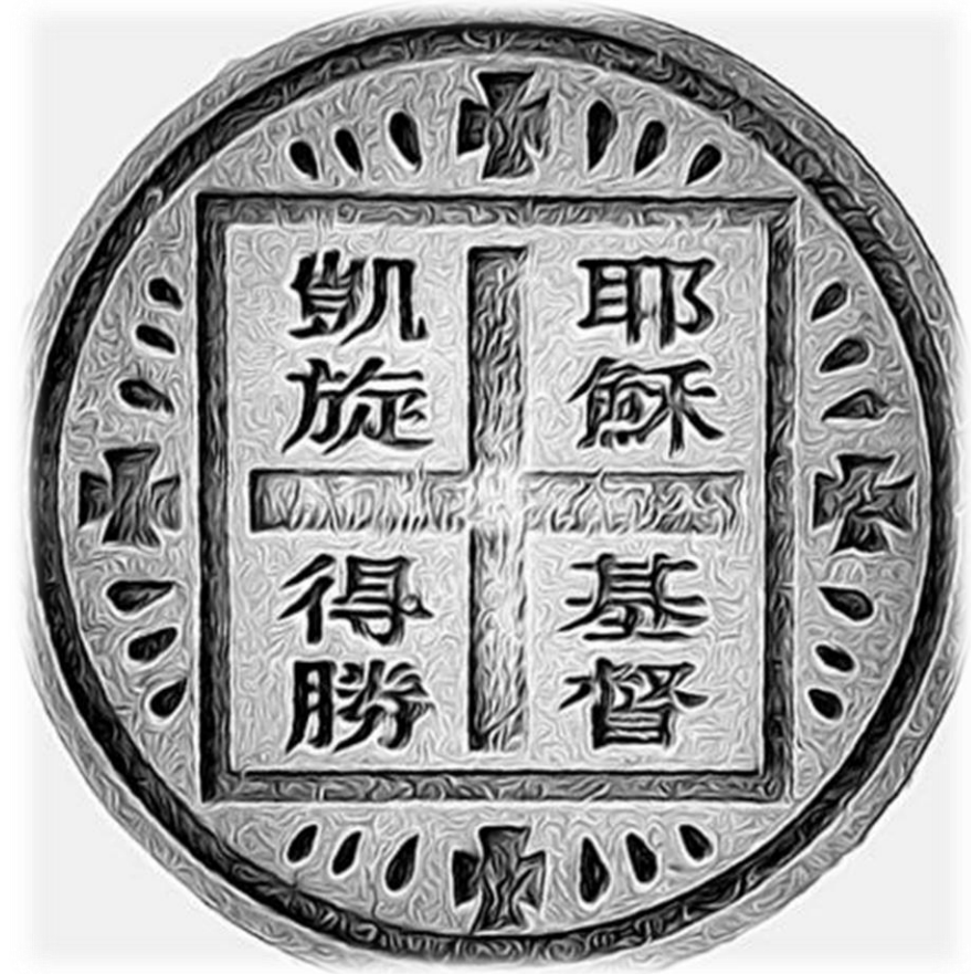
Chinese Orthodox Communion Bread Seal. http://diglib.library.vanderbilt.edu/act-imagelink.pl?RC=57516