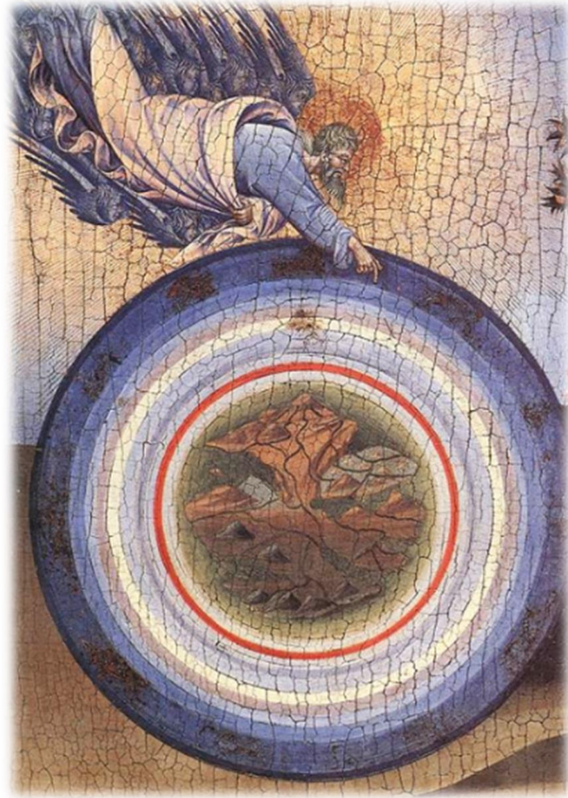
The Creation (detail), Giovanni di Paolo Metropolitan Museum of Art, New York, NY