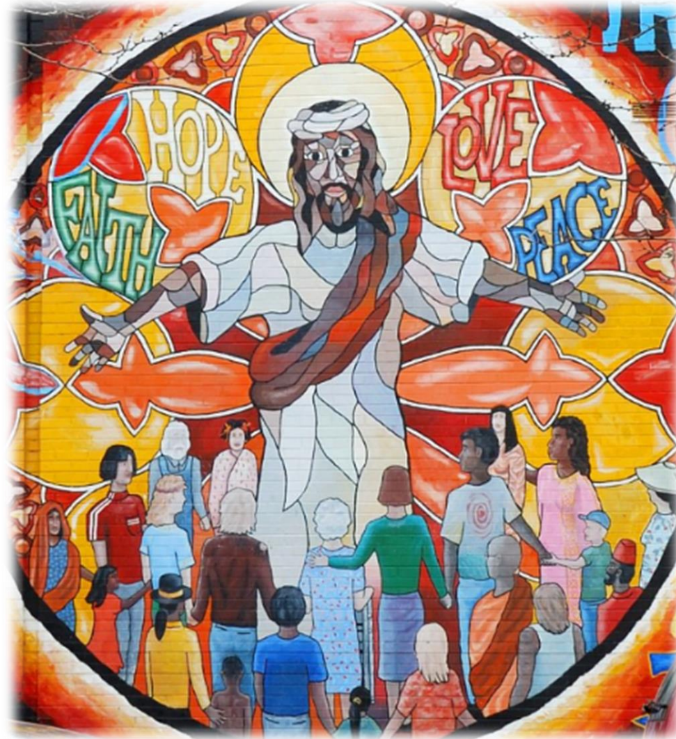
Message of Christ Mural Chicago, IL