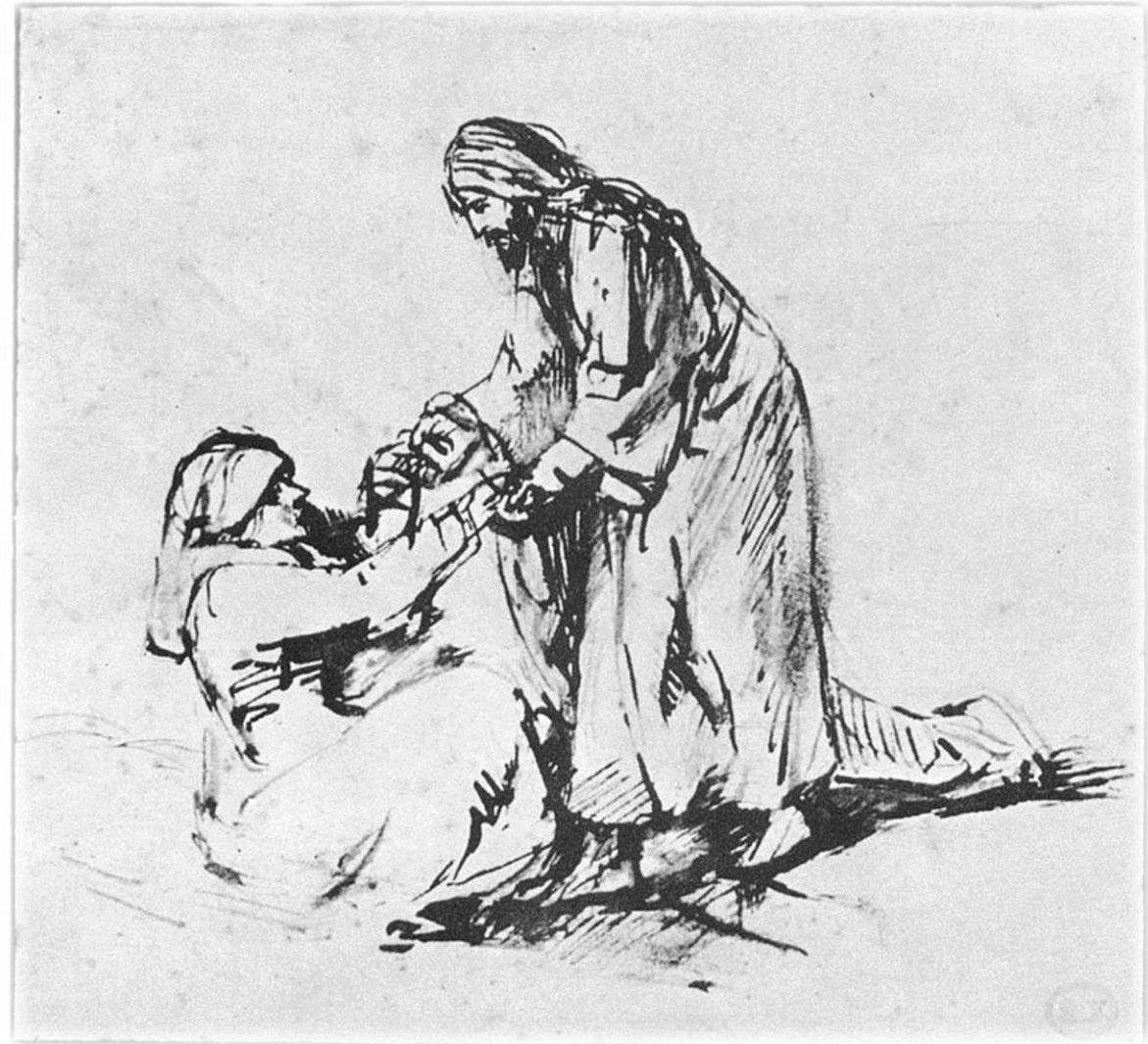
Healing Peter's Mother-in-Law Rembrandt Fondation Custodia Amsterdam, Netherlands

Gospel of Christ according to Mark 1: 29-39