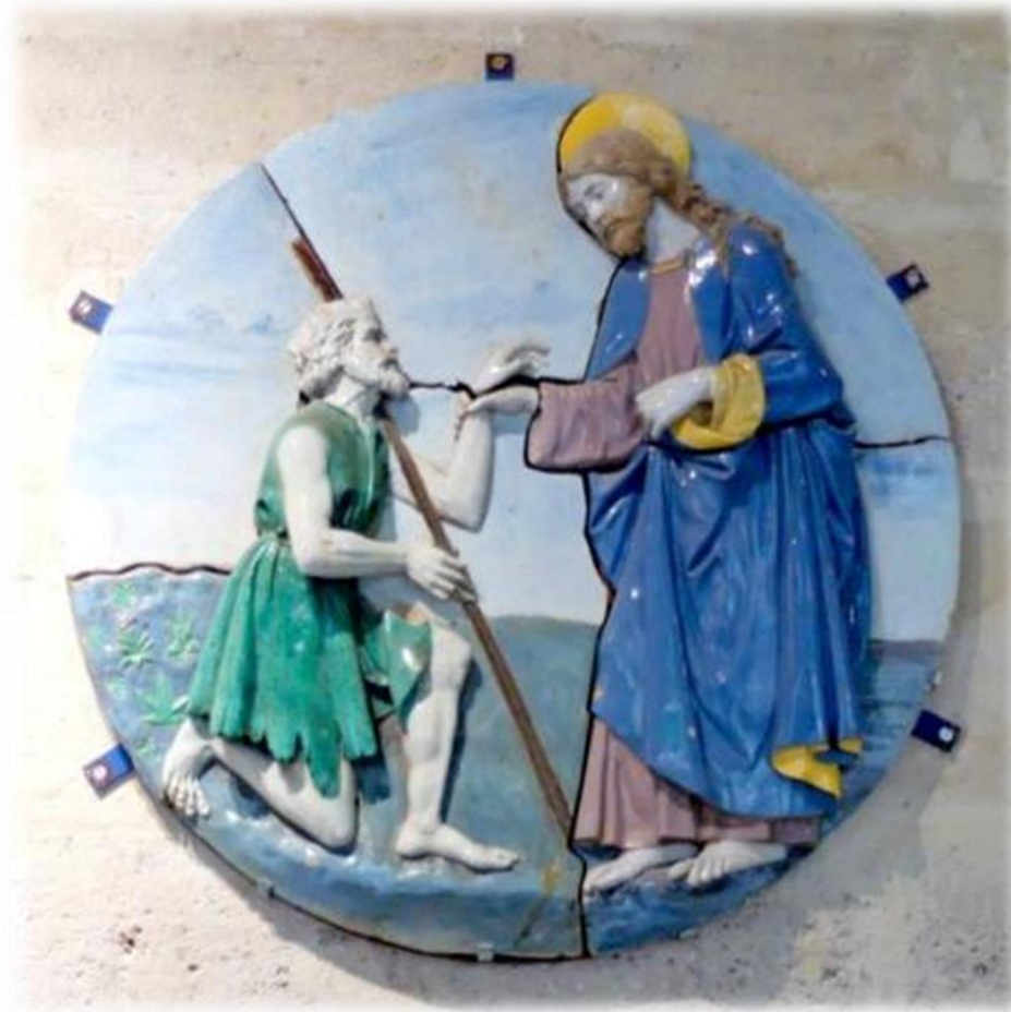
Christ Comforting a Poor Man, Record number: [53086]