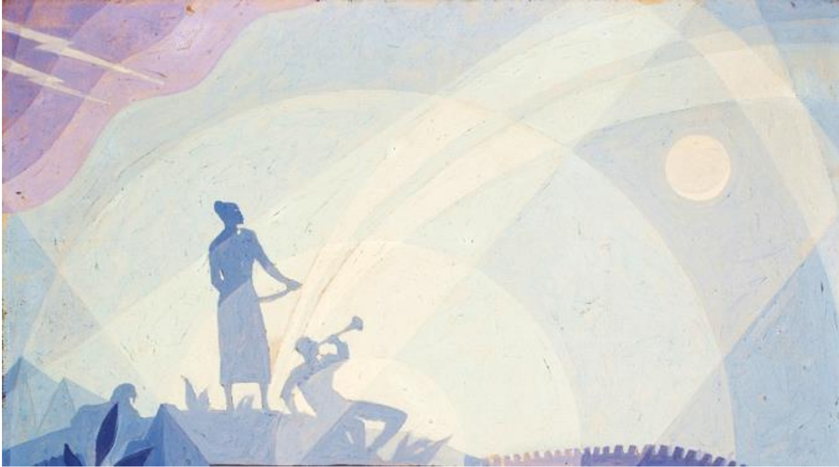
Study for Mural -- Aaron Douglas, Delaware Art Museum, Wilmington, DE