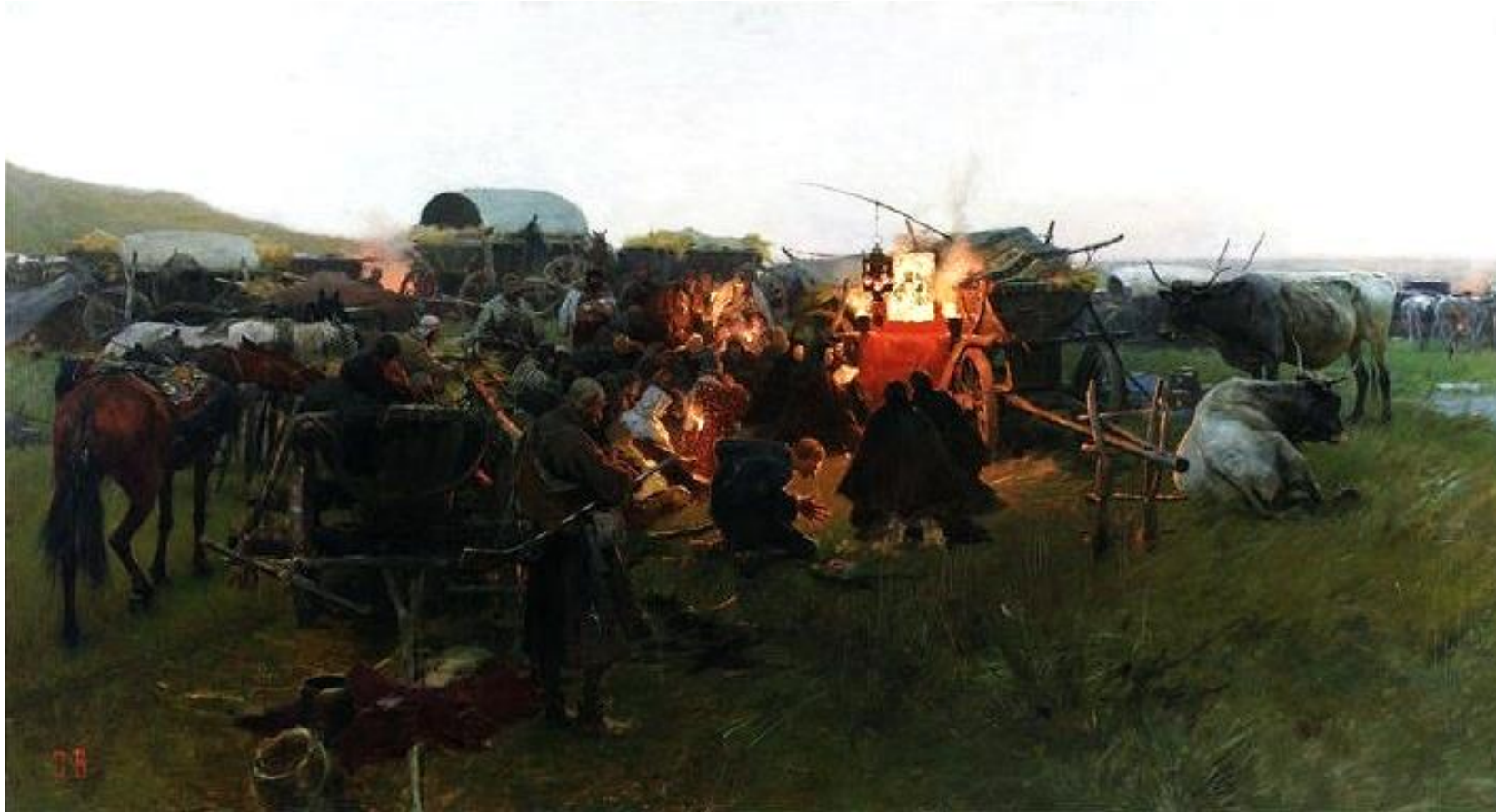
Prayer in the Steppe -- Jozef Brandt, National Museum, Warsaw, Poland