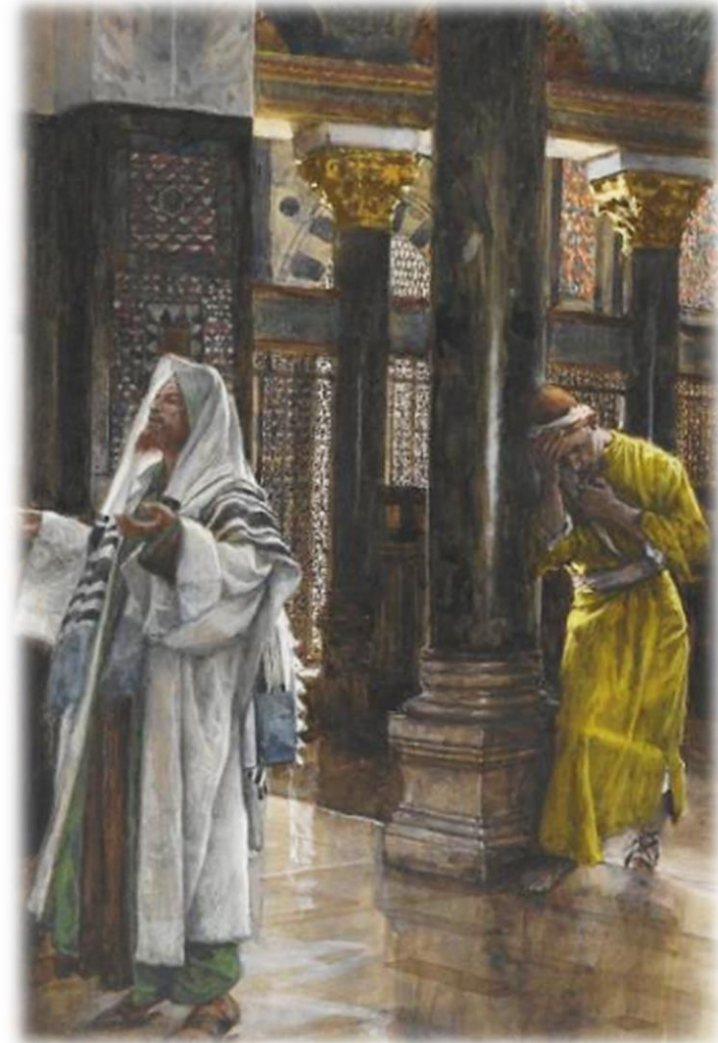
Pharisee and the Publican, James Tissot Brooklyn Museum, New York, NY

Gospel of Christ According to Matthew 6: 1-6, 16-21