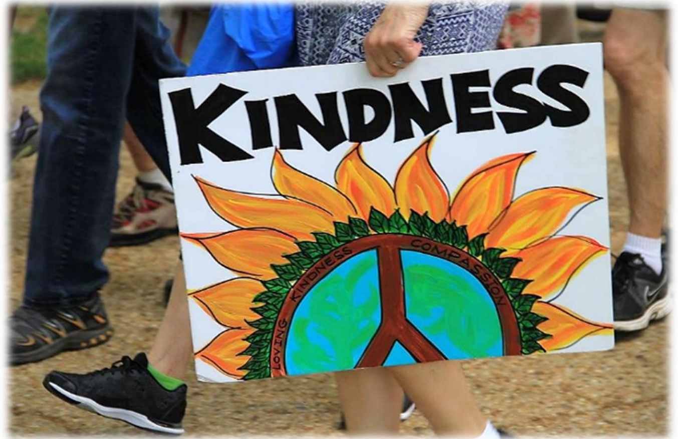
Kindness, Compassion, Peace -- People's Climate March, 2017

Second Reading: 2 Corinthians 5: 20b ~ 6: 10