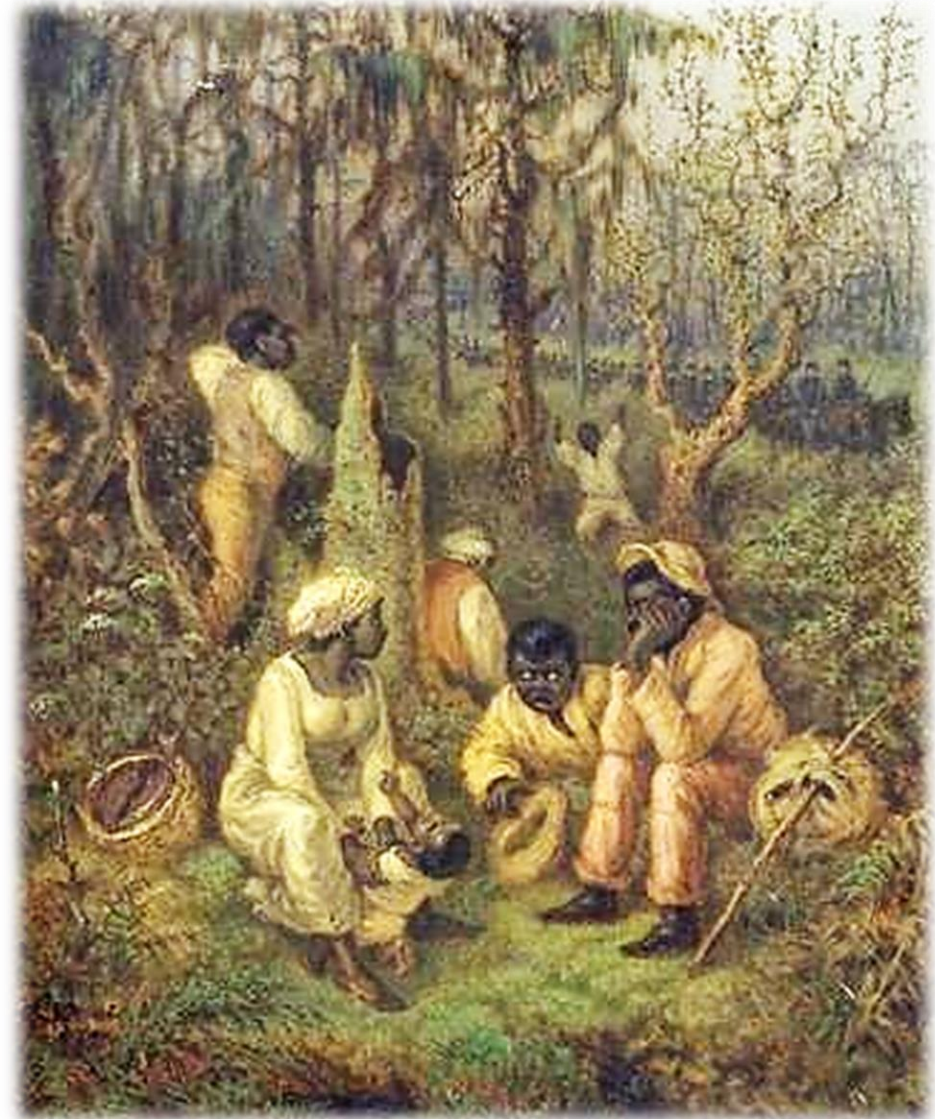
Fugitive Slaves in the Dismal Swamp