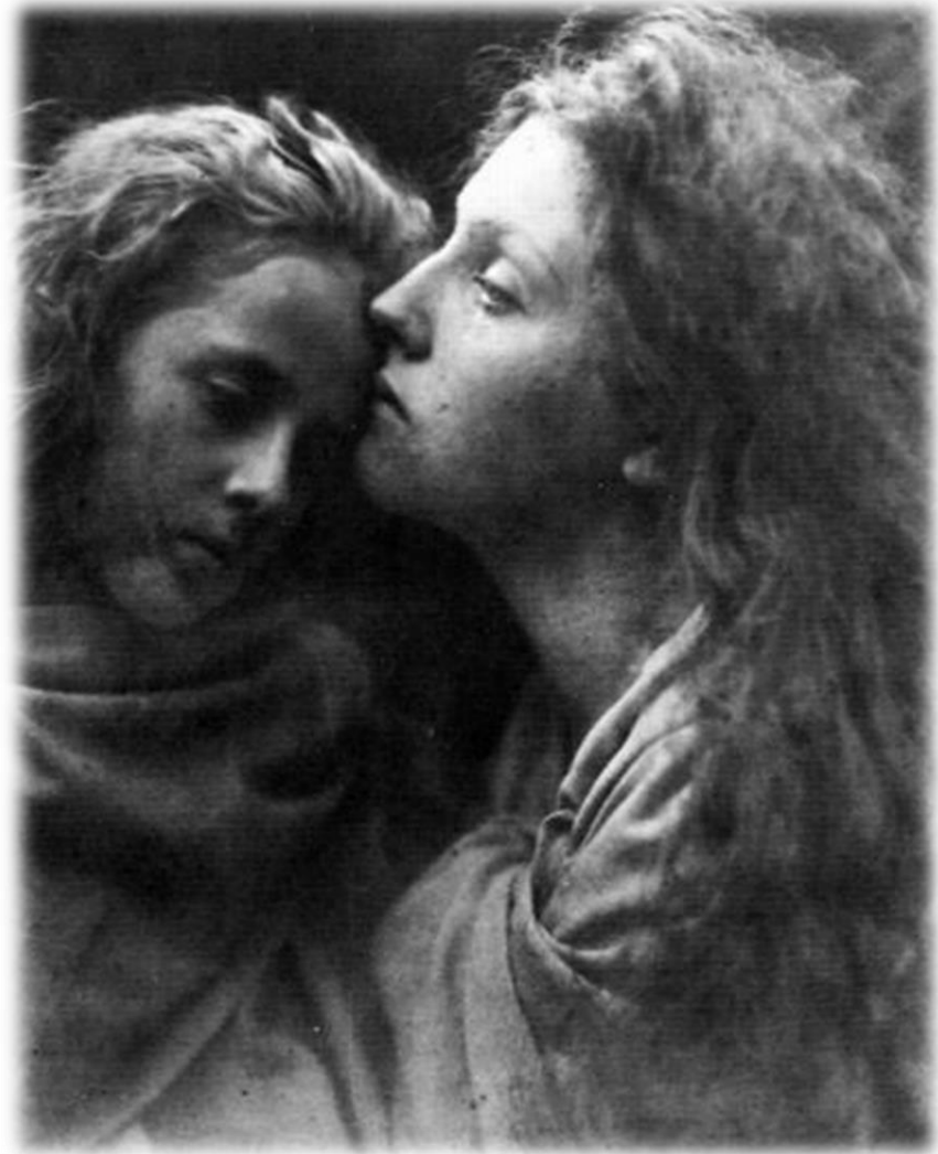
Kiss of Peace, Cameron, Julia Margaret, 1815-1879