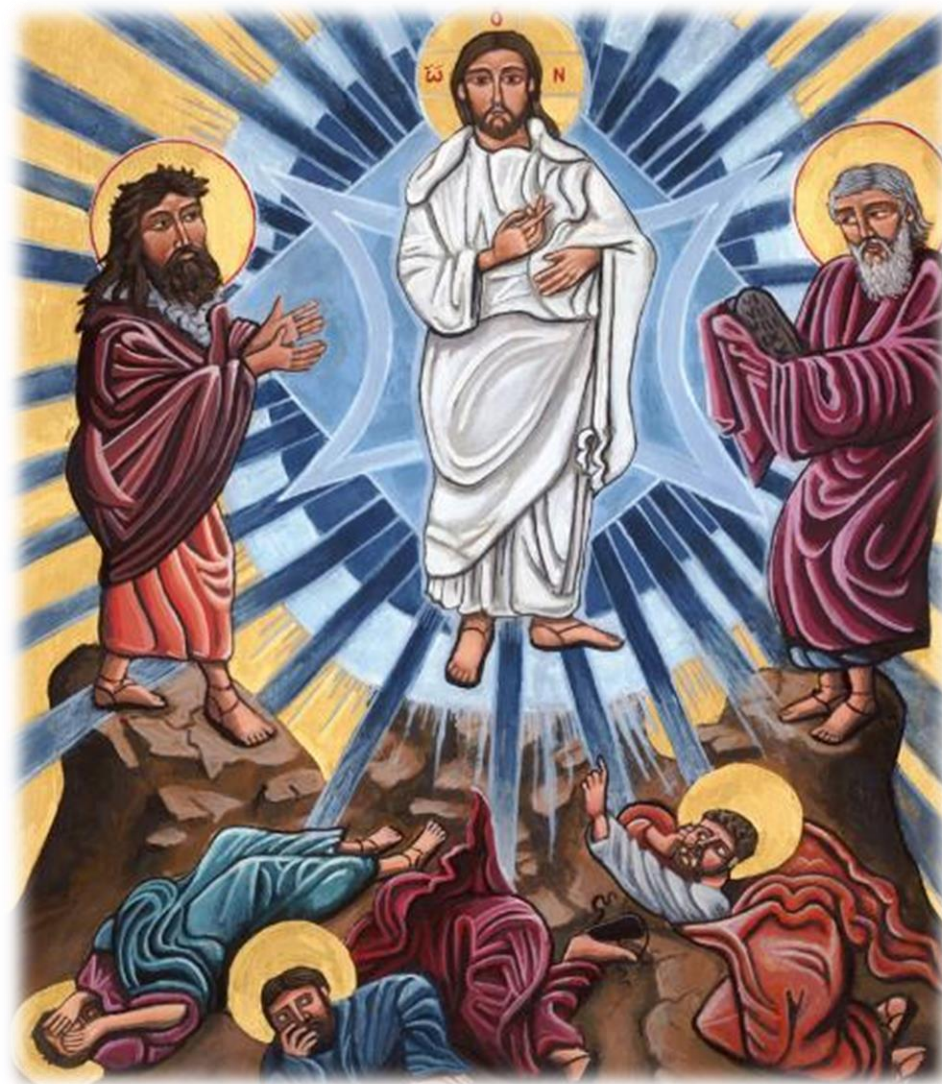
Transfiguration, Latimore, Kelly