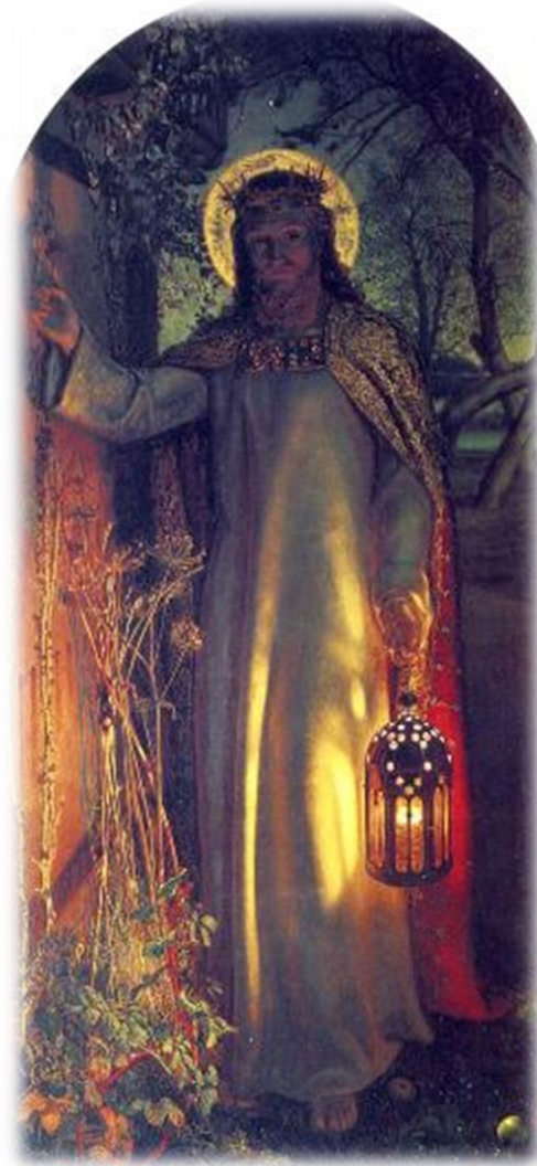
The Light of the World, Hunt, William Holman, 1827-1910