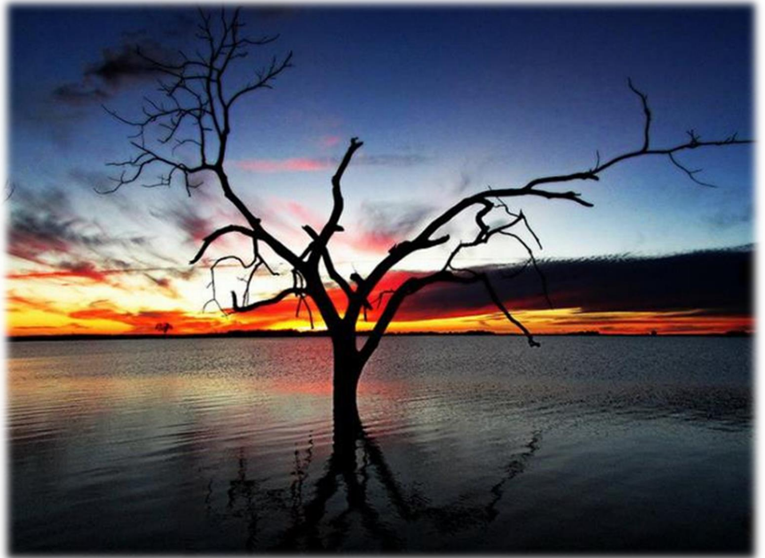
Sunset sets the sky ablaze at South Dakota's Waubay National Wildlife Refuge, Neuharth, Spencer