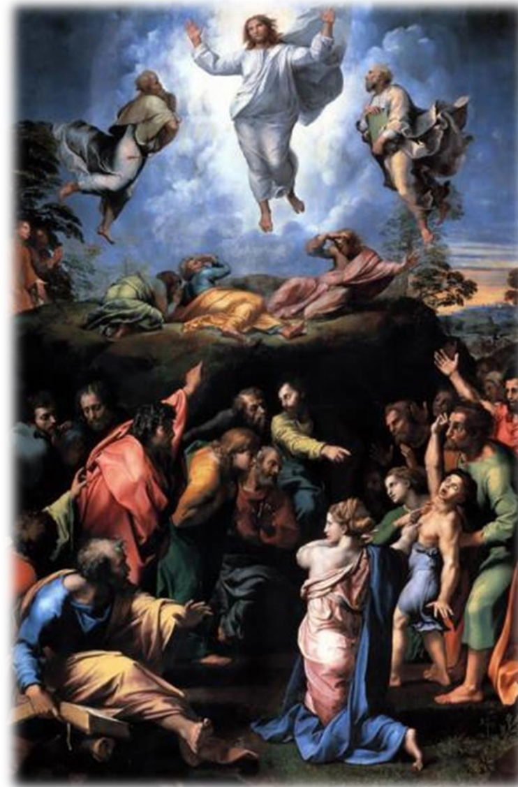
Transfiguration, Raphael, 1483-1520, Romano, Giulio, 1499-1546