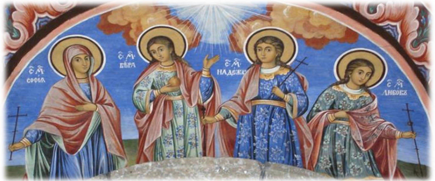
Faith, Hope, Love and Sophia, Record number: [56082]

Opening Hymn: The Love of Jesus Calls Us