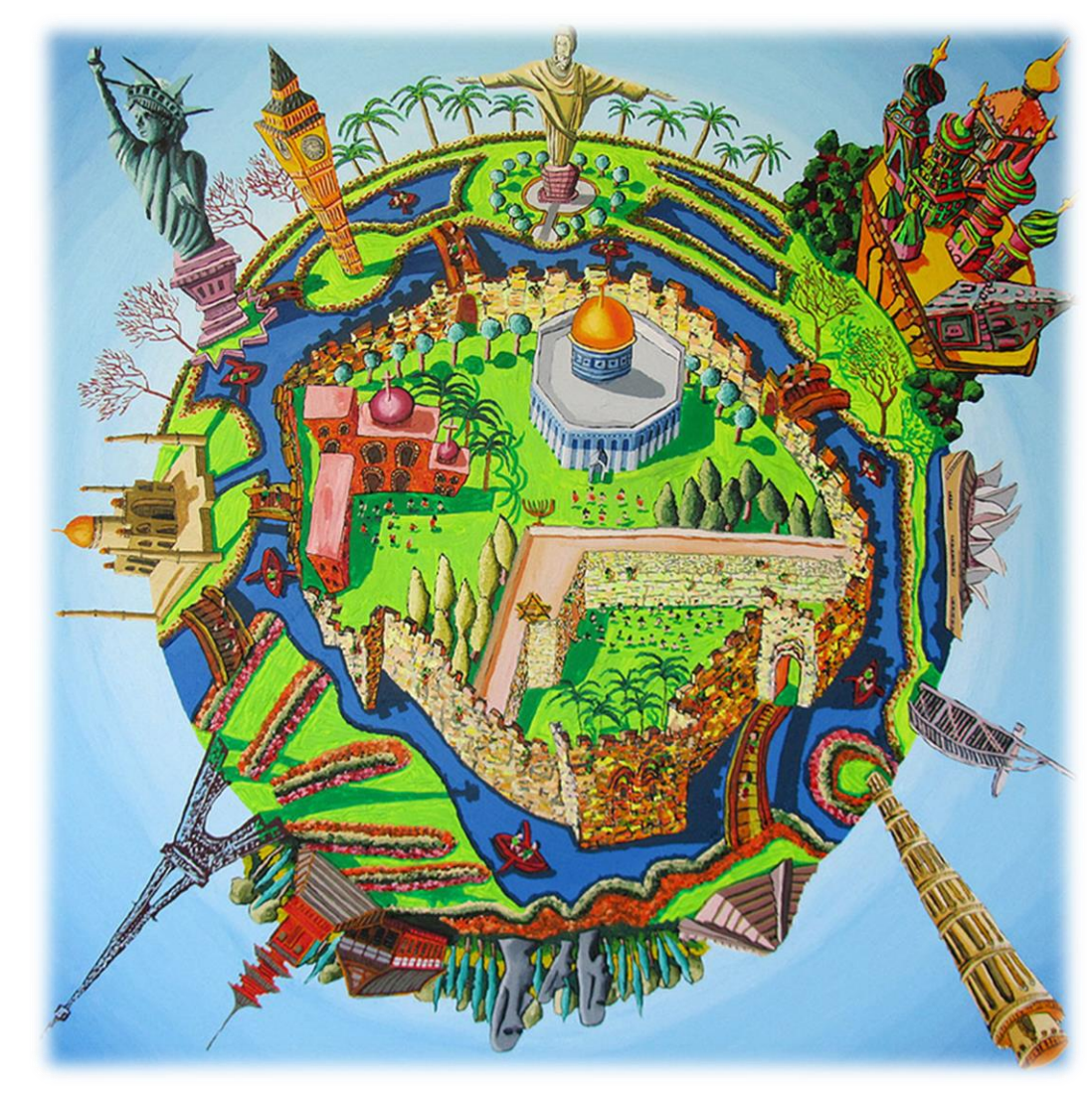
Naive drawing in the style of an ancient map of Jerusalem