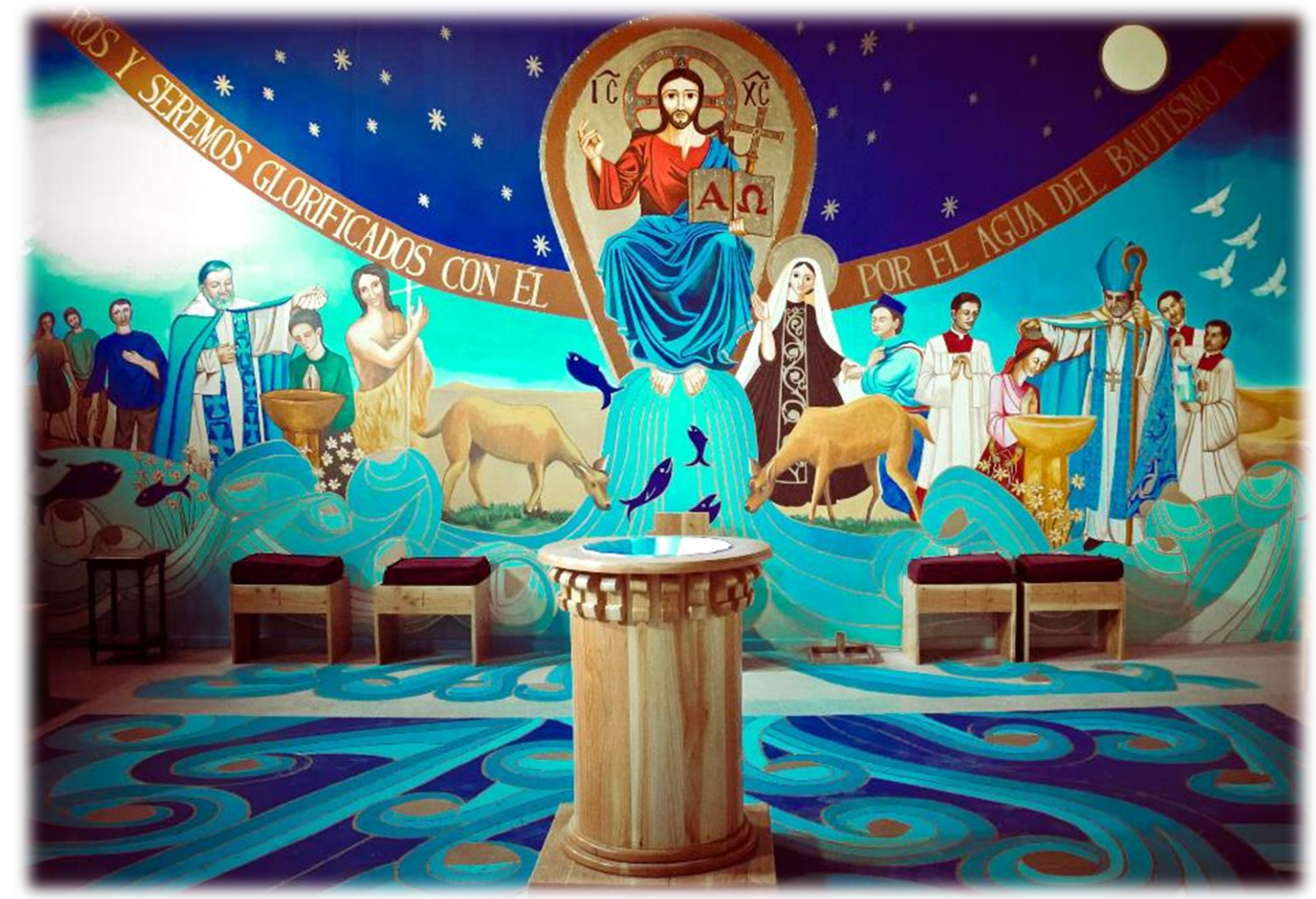
Christ of Baptism -- Church of La Tirana, La Tirana, Chile

The Gospel of Christ according to Mark 1: 1-8