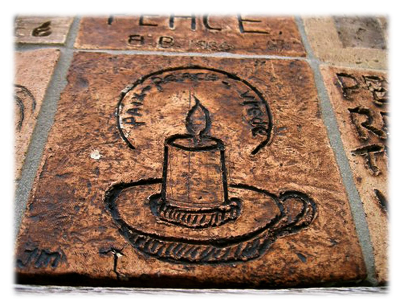
Light of the World - Peace

Prepare the way of the Lord, make his paths straight. All flesh shall see the salvation of God Luke 3.4, 6