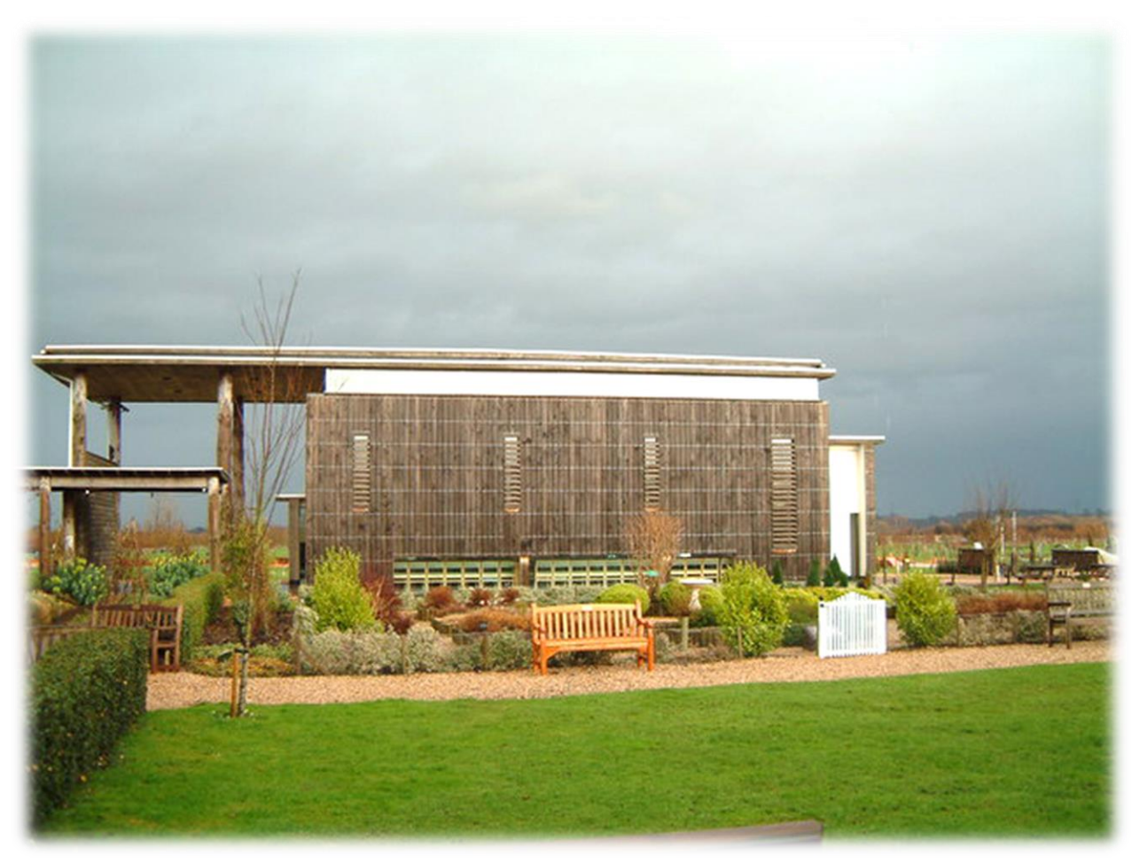
Millennium Chapel of Peace and Forgiveness