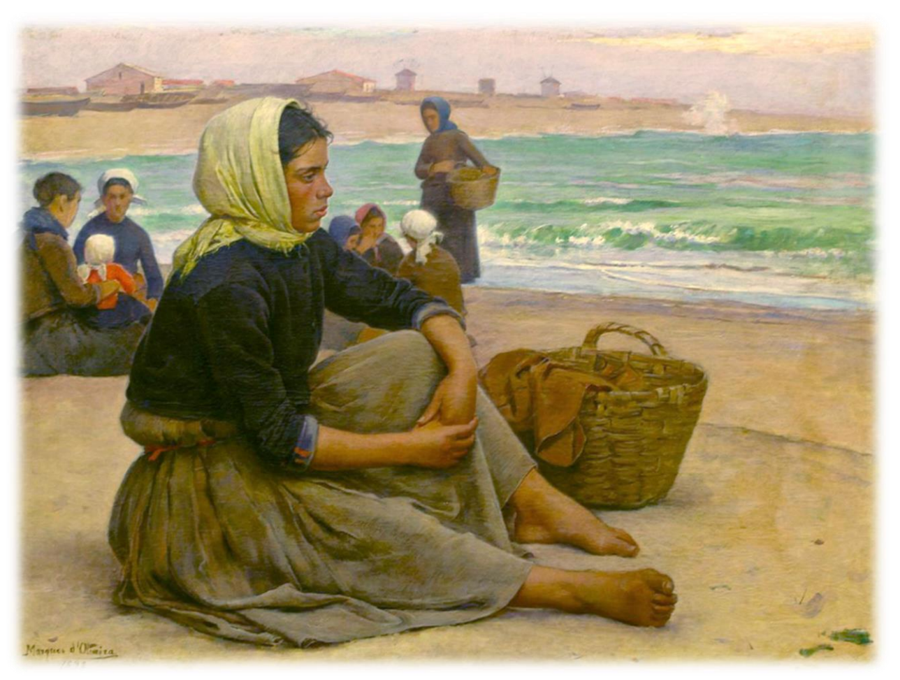
Waiting for the Boats -- Joao Marques de Oliveira, National Museum, Lisbon, Portugal