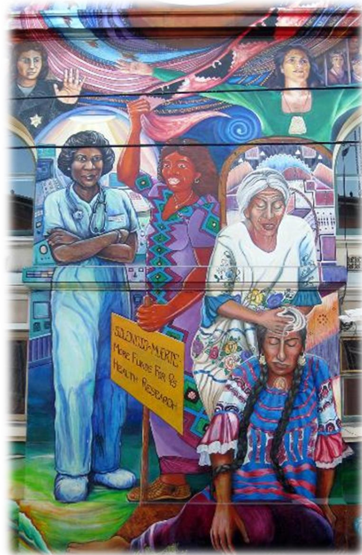
Maestra Peace Mural