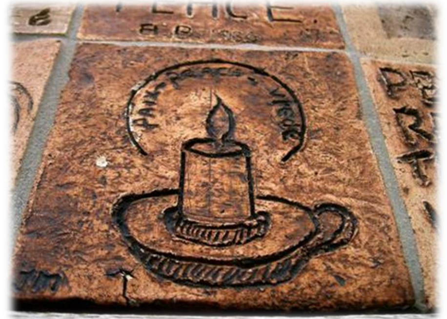
Light of the World - Peace