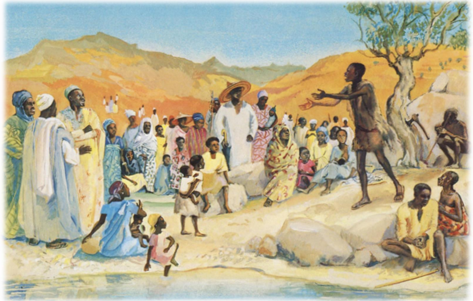
John the Baptist Preaching -- JESUS MAFA, Cameroon