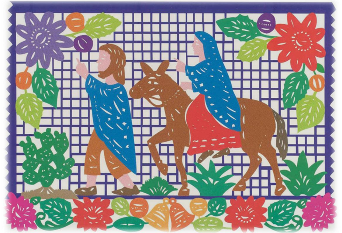
Journey to Bethlehem

Infant Holy, Infant Lowly When Mary Hugged Her Newborn Son Born in the Night