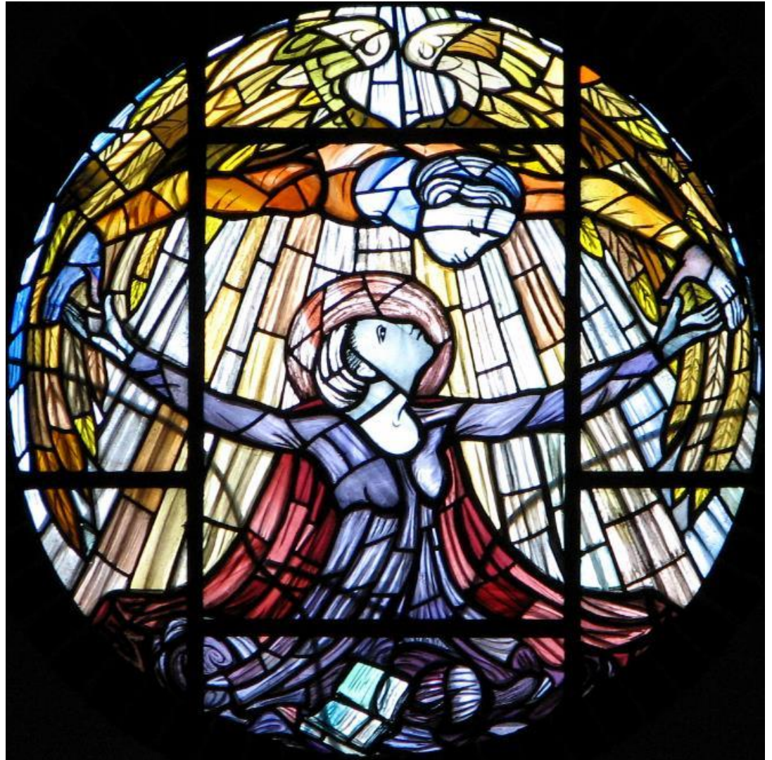
The Annunciation, Church of Our Lady of Pity Swaffam, England