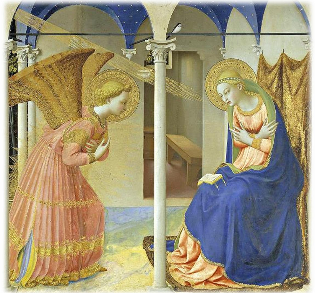
The Annunciation Fra Angelico Prado Museum Madrid, Spain

The Holy Gospel of Christ according to Luke 1: 26-38