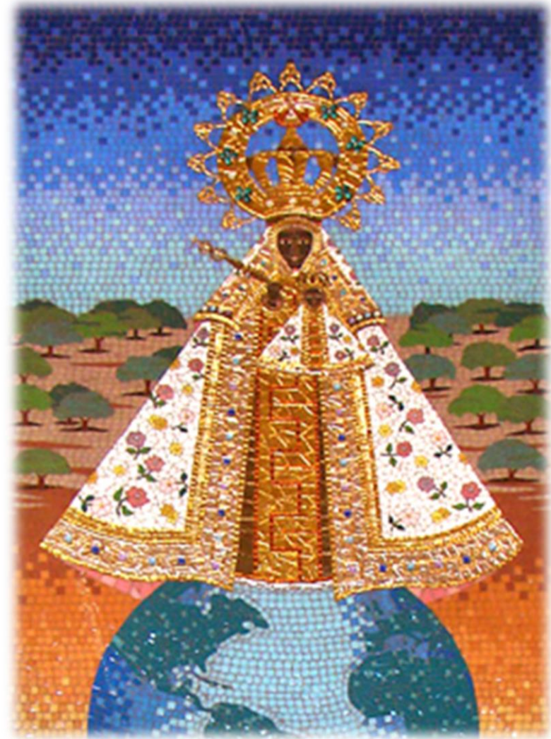
Madonna and Child from Mexico, Mosaic from Church of the Annunciation, Nazareth, Israel