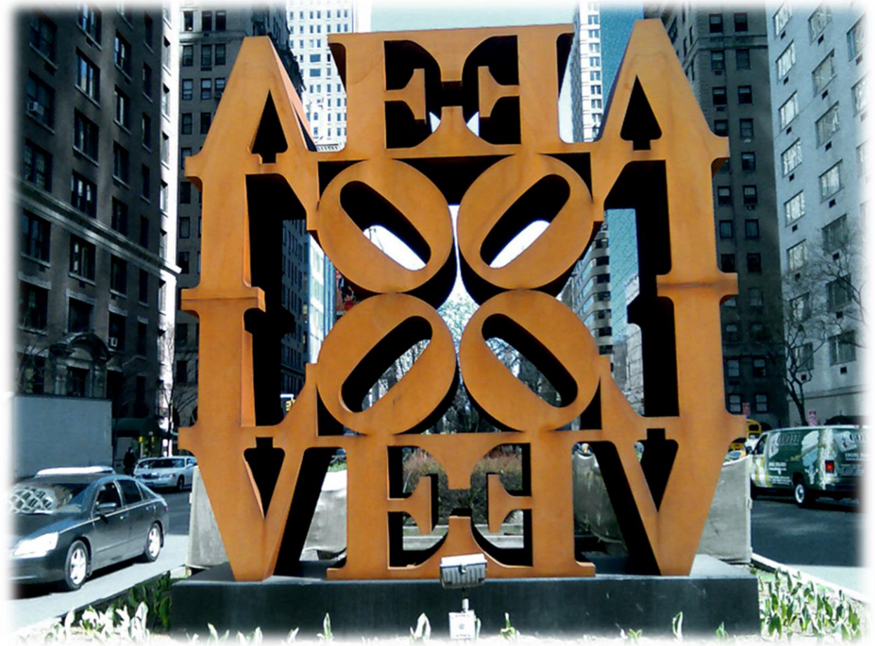
Love, (four ways), Indiana, Robert, 1928-