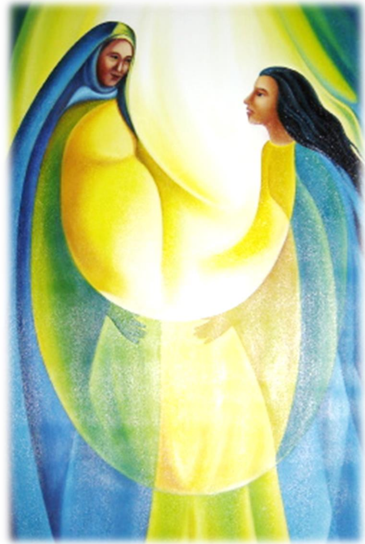
Visitation, Church of El Sitio El Sitio, El Salvador