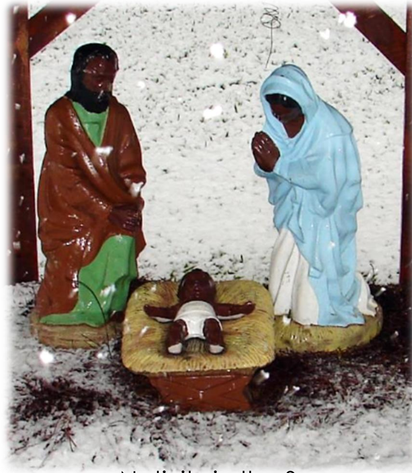
Nativity in the Snow Church near Xavier University