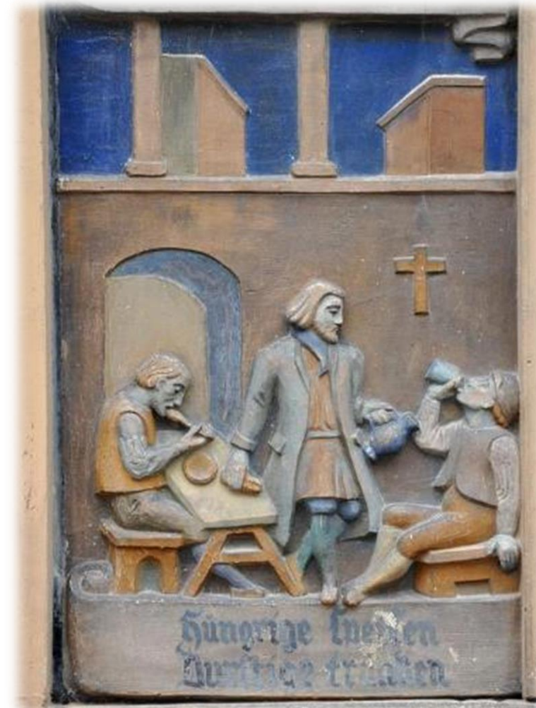
Feeding the Hungry Biberach, Germany