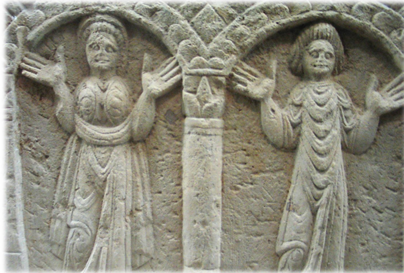
Coptic Praise and Prayer Orans figures from Bawit, Egypt -- Louvre Museum, Paris