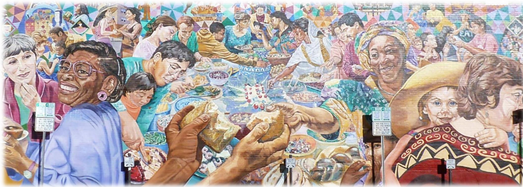
The Potluck -- Building mural by David Fichter, Cambridge, MA