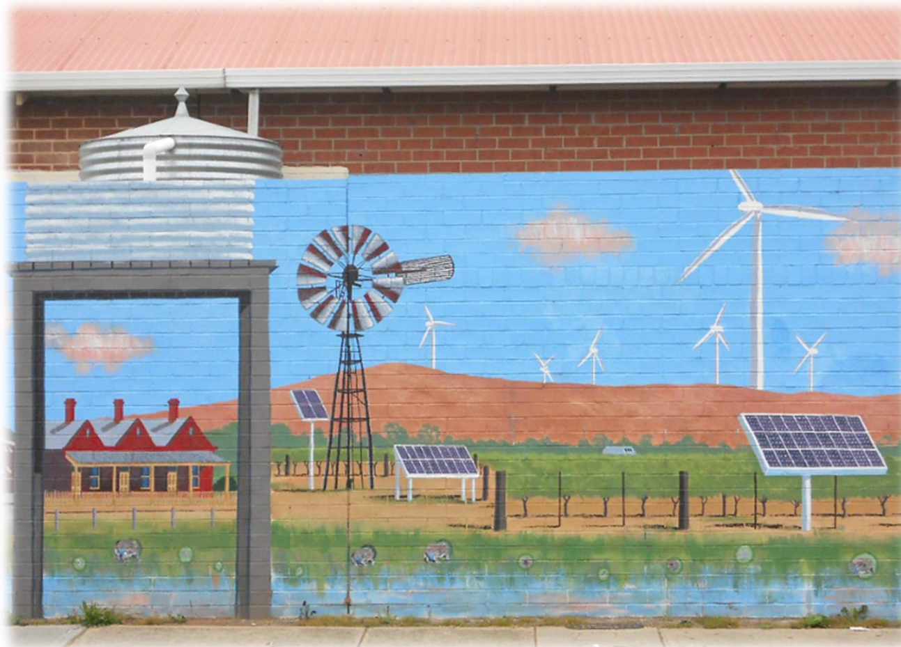
"Sustainability" -- Building mural, Adelaide, Australia