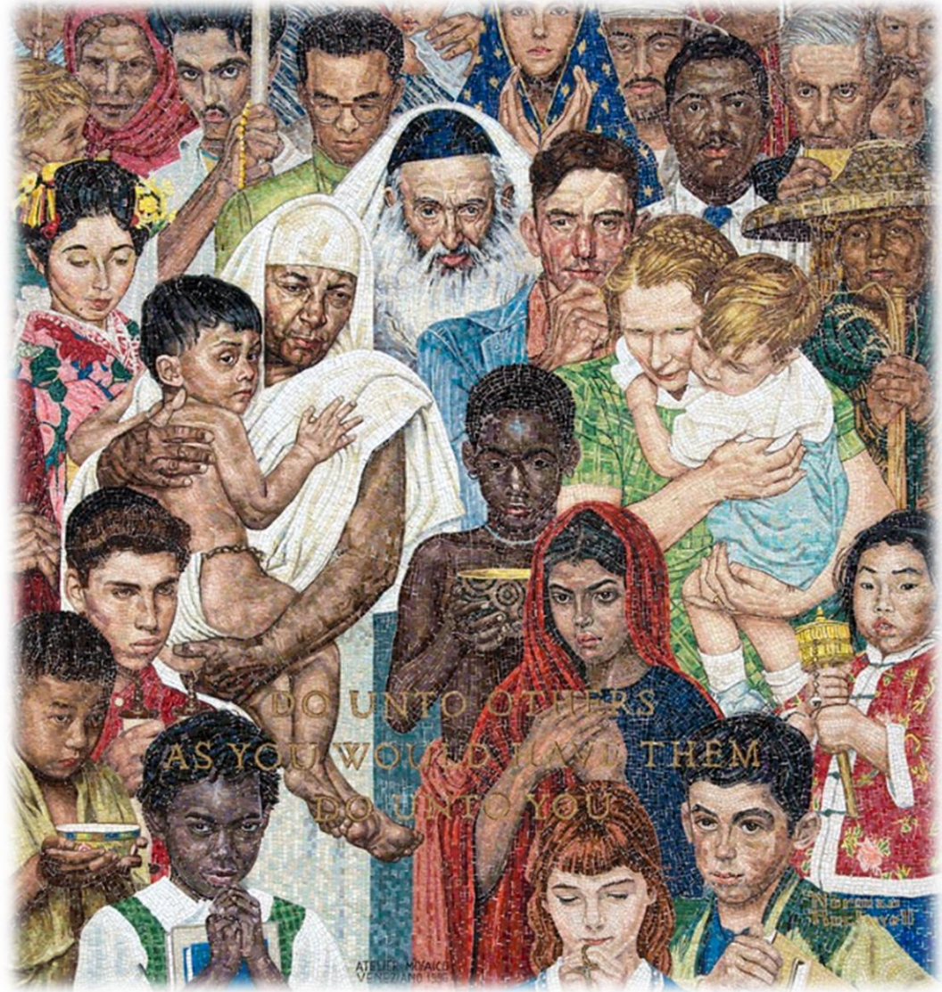
Wall of Praise, Based upon Norman Rockwell's Golden Rule, Thanks-Giving Square, Dallas, TX