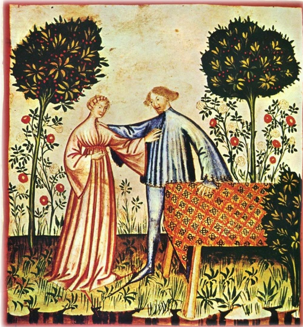
Joy, from Aspects of Daily Life