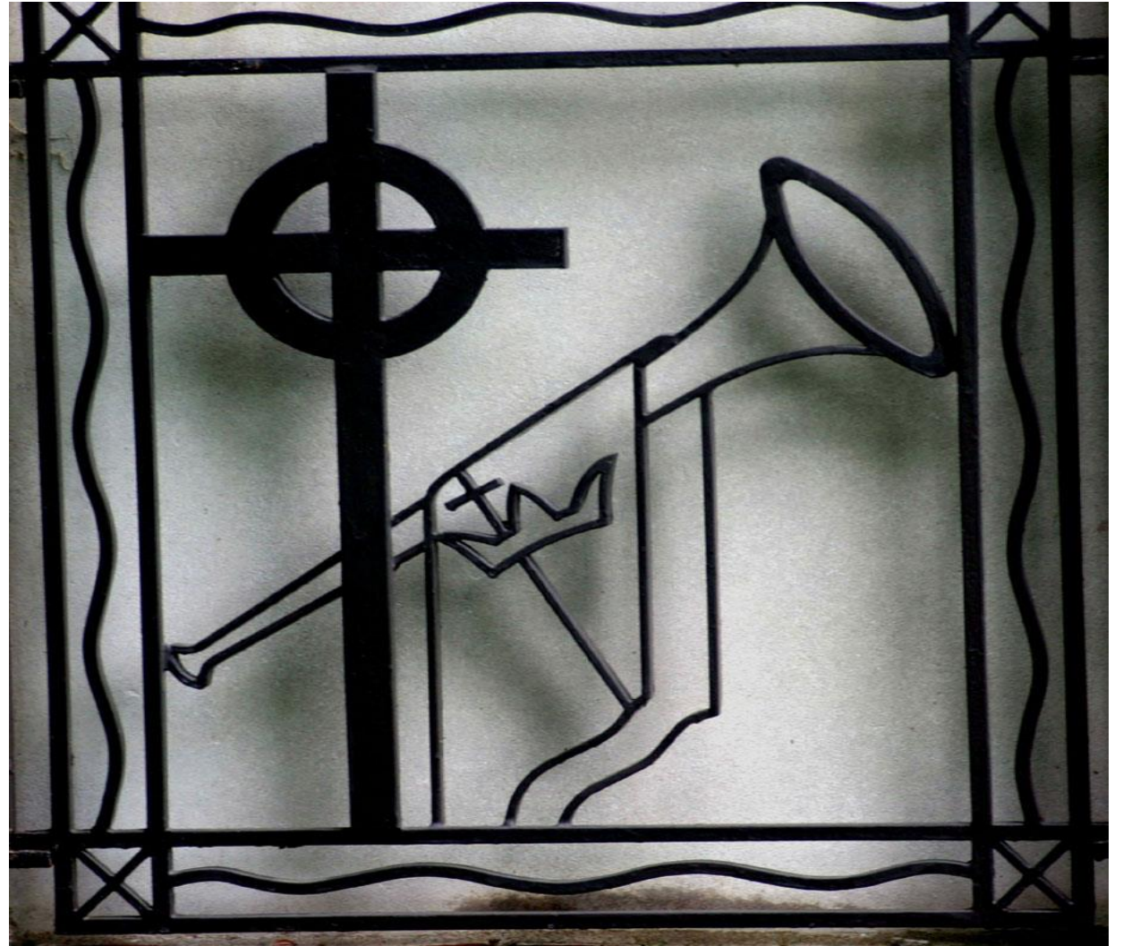
Cross with Trumpet, a project of the Vanderbilt Divinity Library Benton Chapel, Vanderbilt University, Nashville, TN