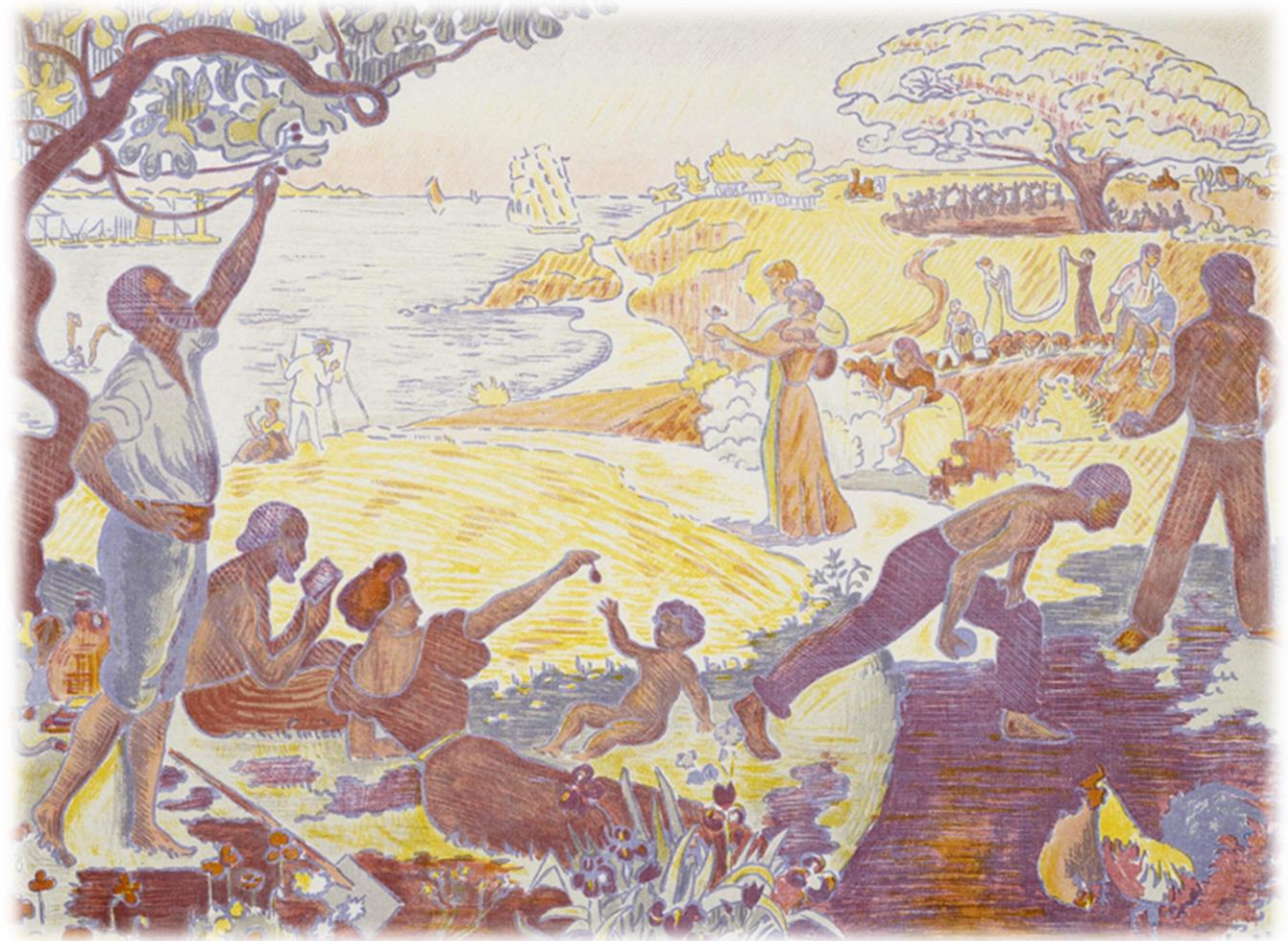
In the Time of Harmony: The Joy of Life, Sunday by the Sea, Signac, Paul, 1863-1935