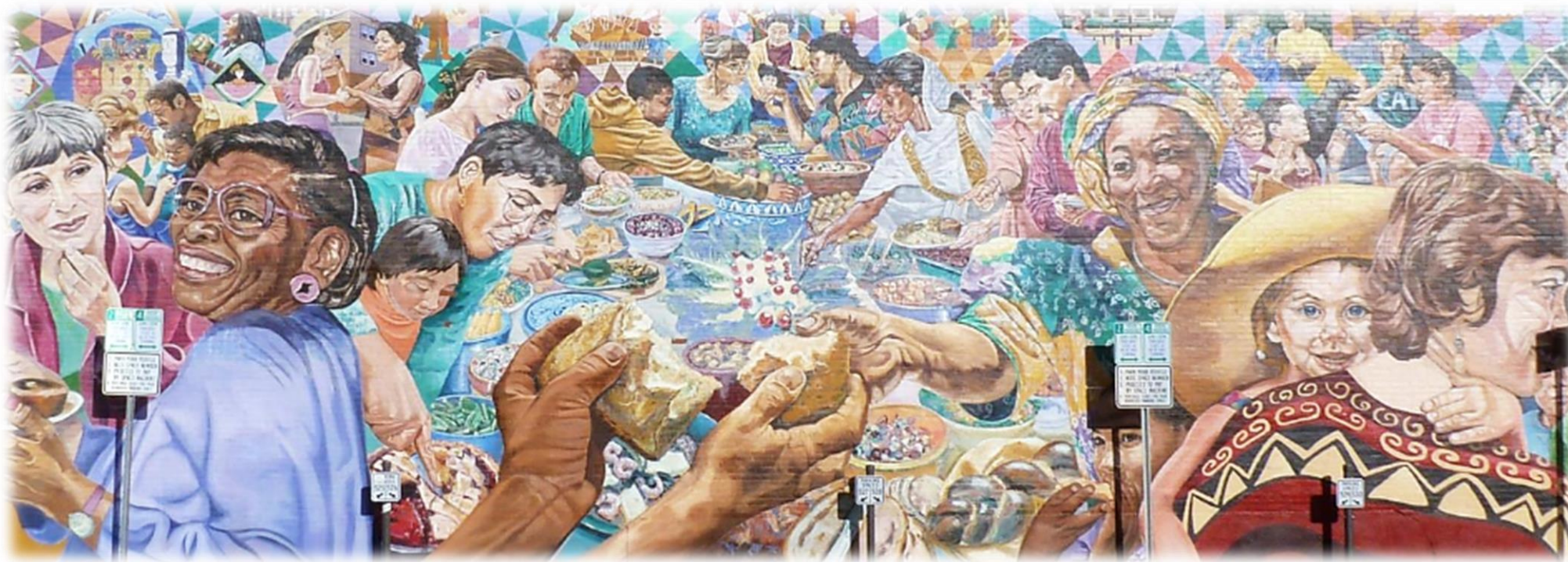
The Potluck -- Building mural by David Fichter, Cambridge, MA