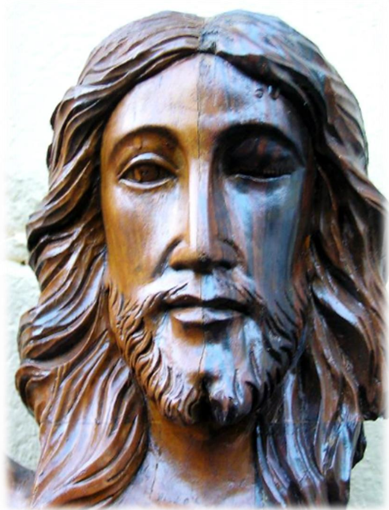
Christ Crucified, Risen Baguio, Philippines