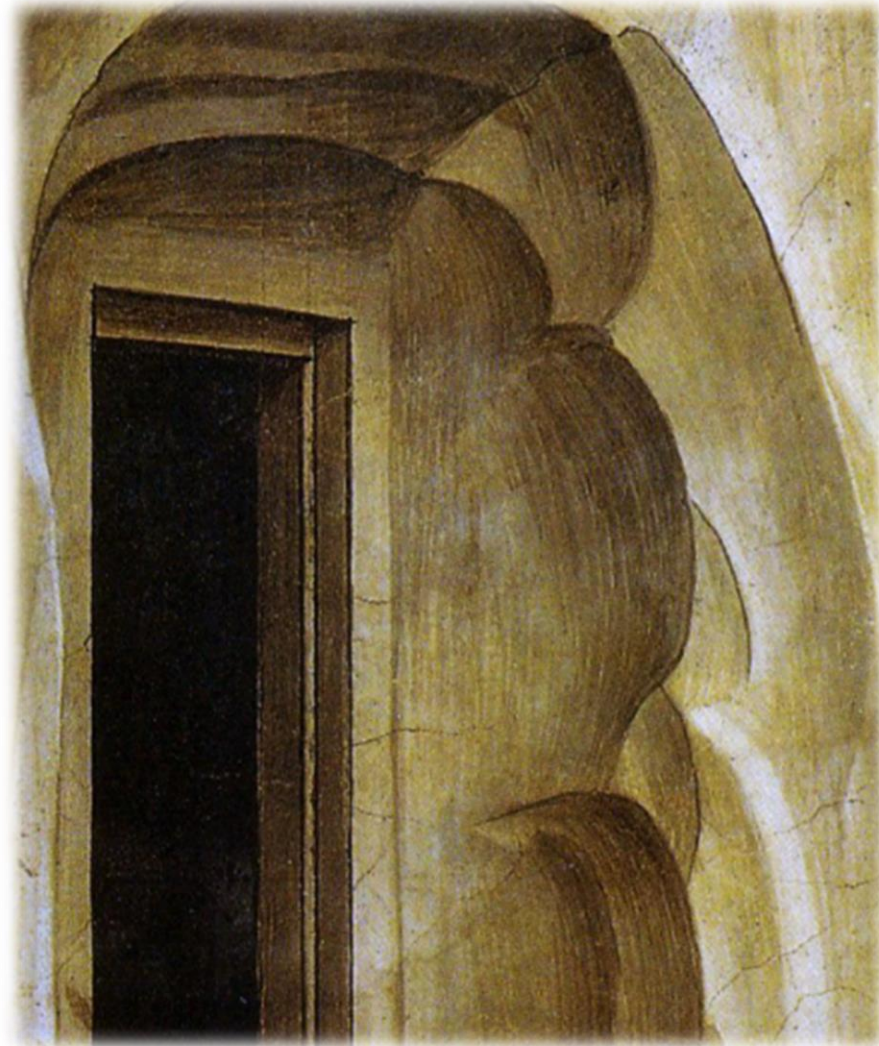
Detail of Empty Tomb, Fra Angelico San Marco, Florence, Italy