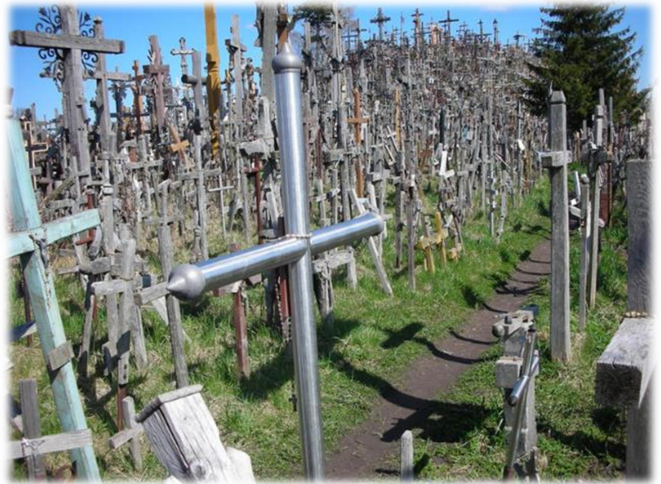
Hill of Crosses, Record number: [55873]