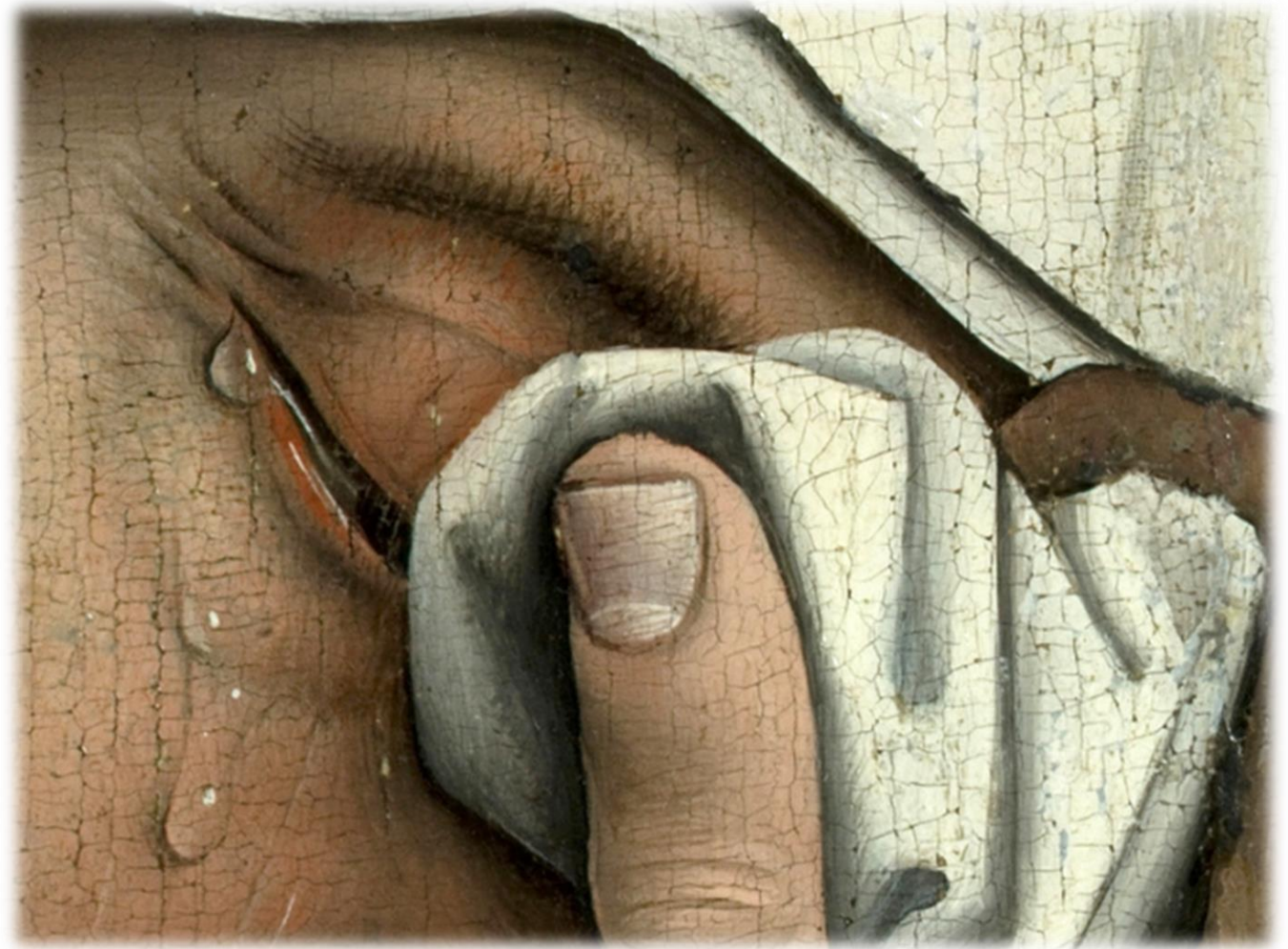
Mother Mary's Tears, detail from Descent from the Cross -- Rogier van der Weyden, Prado, Madrid