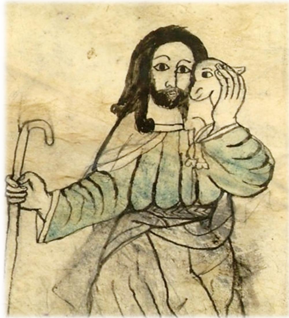
Ethiopian Portrayal of Christ as the Good Shepherd Bibliothèque Nationale Paris, France