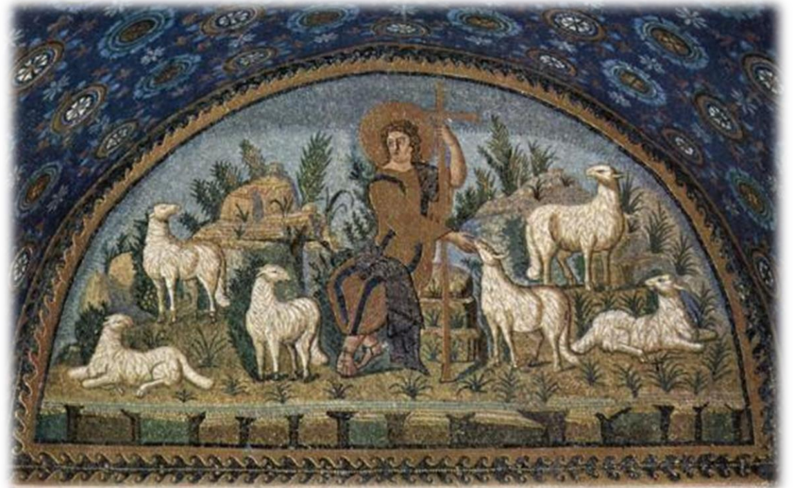
Christ The Good Shepherd, Record number: [51106]