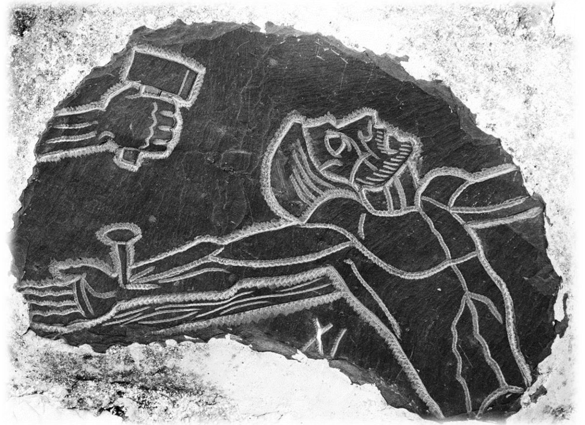
Nailed to the Cross -- Notre Dame de la Garde, Marseille, France