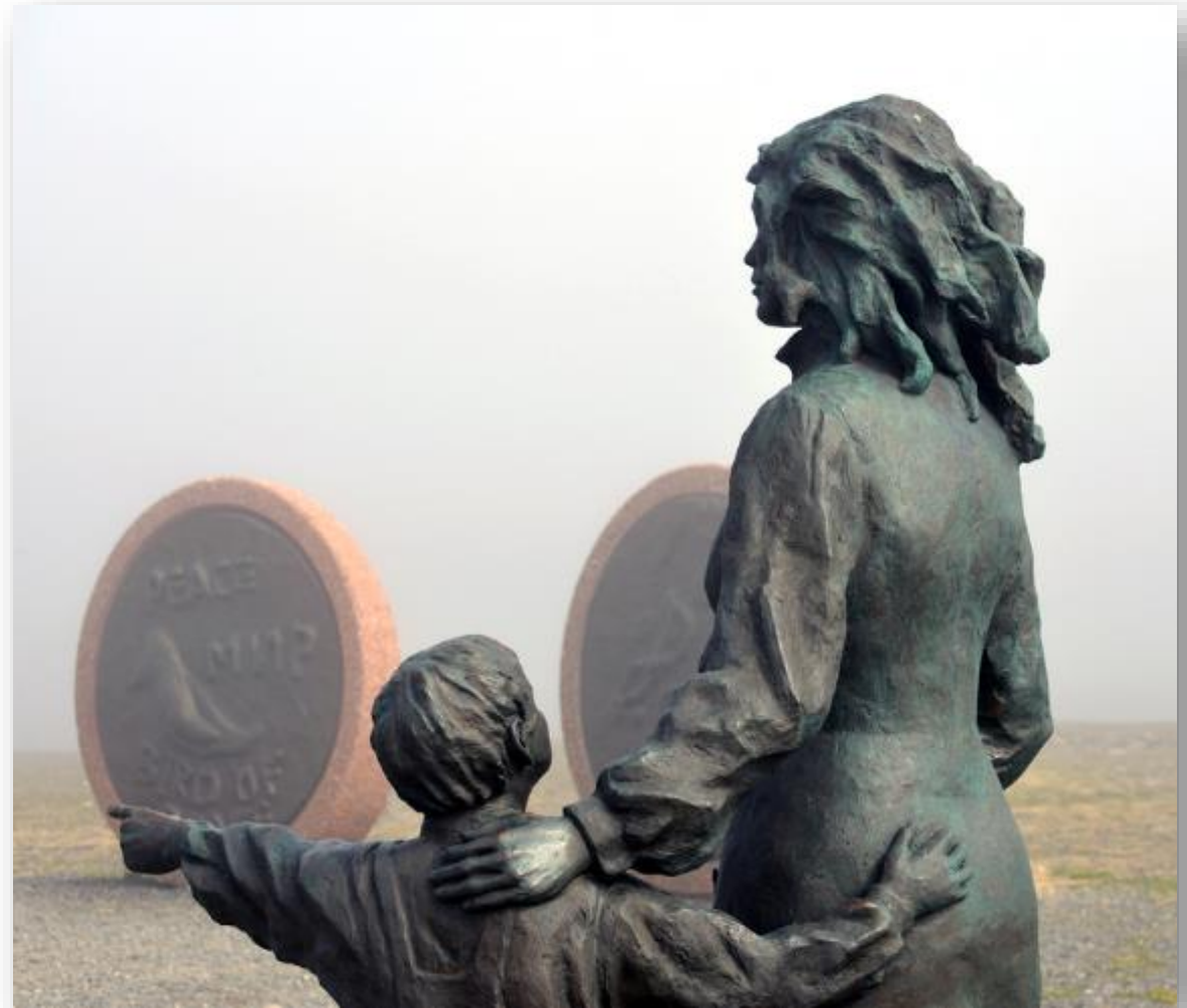
Children of the Earth Eva Rybakken, Nordkapp, Norway