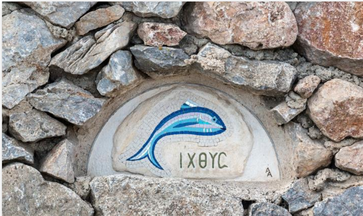
Fish Mosaic , Profitis Ilias Monastery, Kallistis, Greece