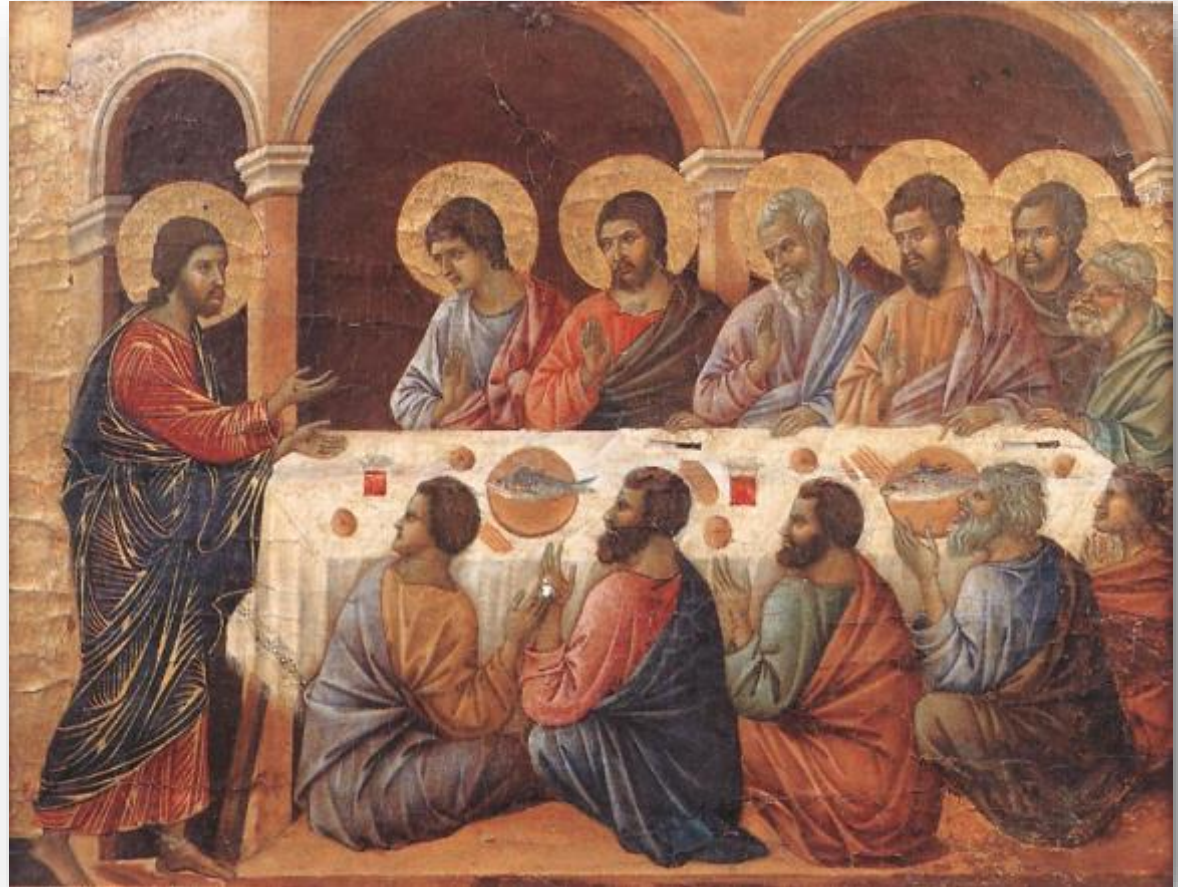
Christ Appears to the Disciples -- Duccio, Altar of Duomo, Siena, Italy

The Gospel of Christ according to Luke 24: 36b-48