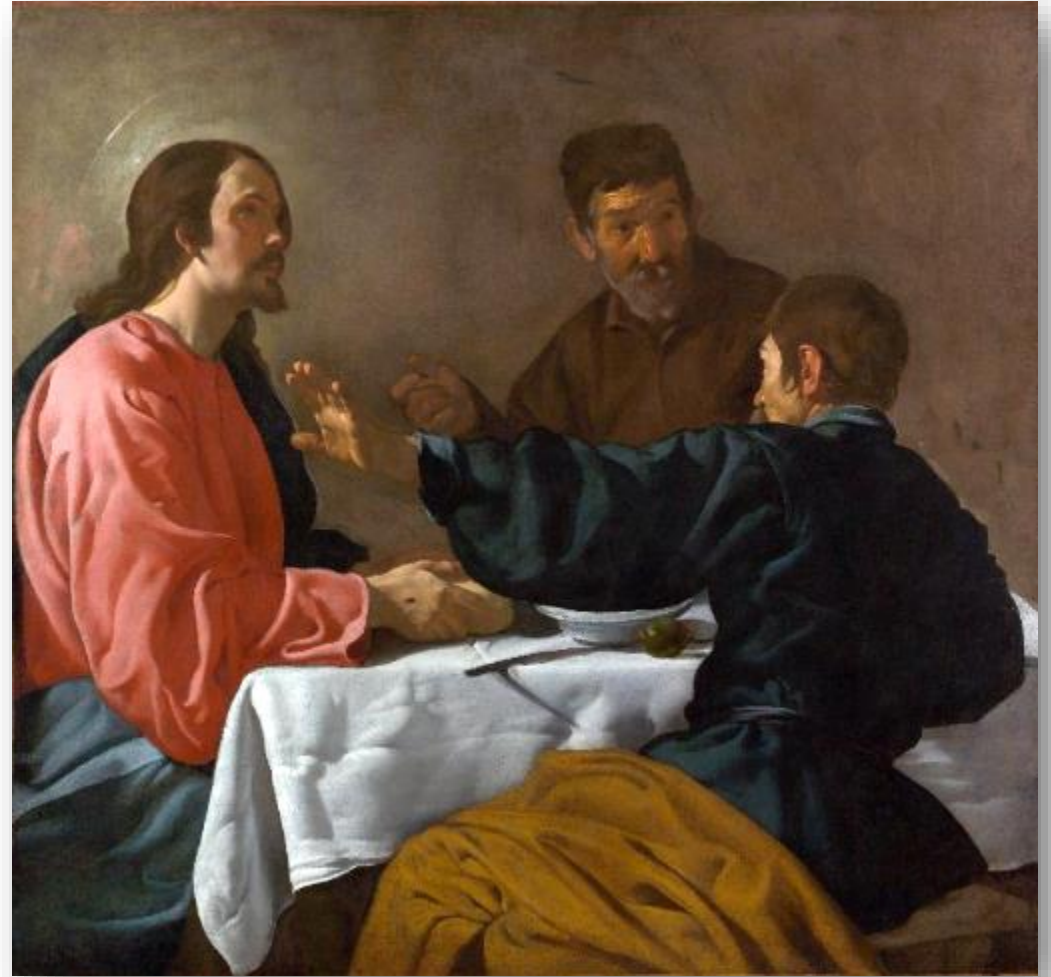
Supper at Emmaus Diego Velázquez, Met Museum New York, NY