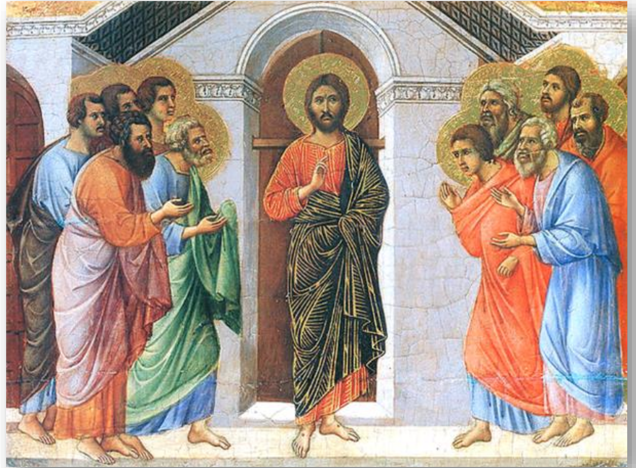
Christ Appears to the Apostles -- Duccio, Museo dell'Opera del Duomo, Siena, Italy

Lord Jesus, open to us the scriptures; make our hearts burn within us while you speak. See Luke 24.32