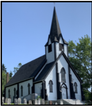
St. Luke's Church, Hubbards