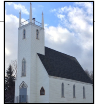
St. Mark's Church, Mill Cove