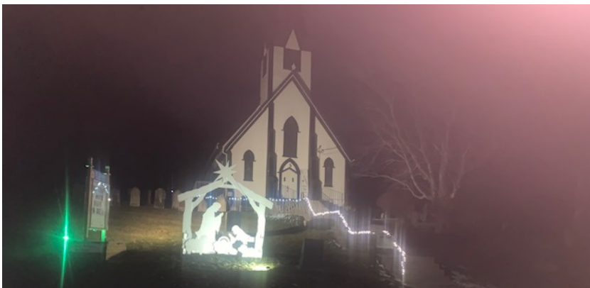
Christmastime at our two churches – St. Luke's (above) and St. Mark's (right).