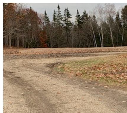
Above Left: View of the wooded area between Pine Hill and Conrad's Road. All the undergrowth has been cleared to increase visibility. Above Right: The area directly in from the main entrance to Pine Hill has been cleared and filled and, when completed, will provide an area for cremation burials.