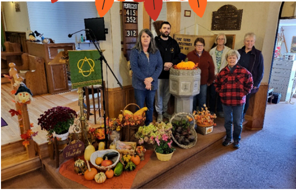
Above & Below: Decorating the church for the Harvest Thanksgiving service on October 13.