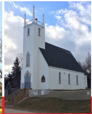
St. Luke's, Hubbards