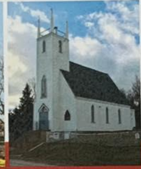
St. Luke's, Hubbards