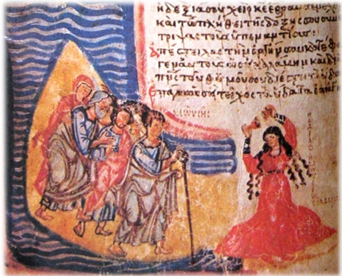
Dance of Miriam upon Crossing the Red Sea -- Chludov Psalter, State Hist. Museum, Moscow