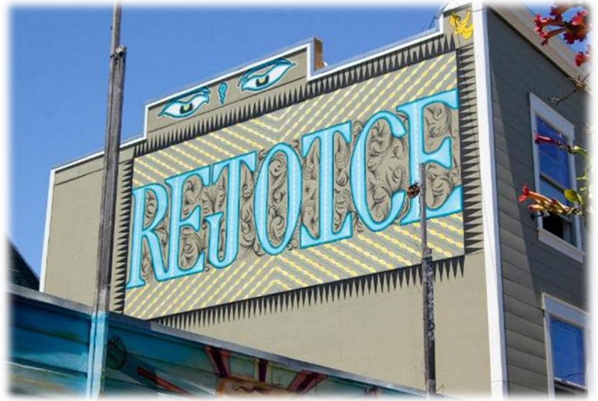
Rejoice! -- Mural in Mission District, San Francisco, CA