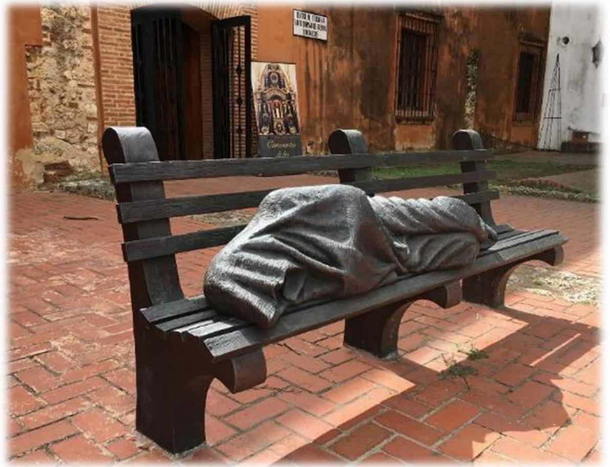
Homeless Jesus -- Timothy Schmaltz, Dominican Convent, Santo Domingo, Dominican Republic