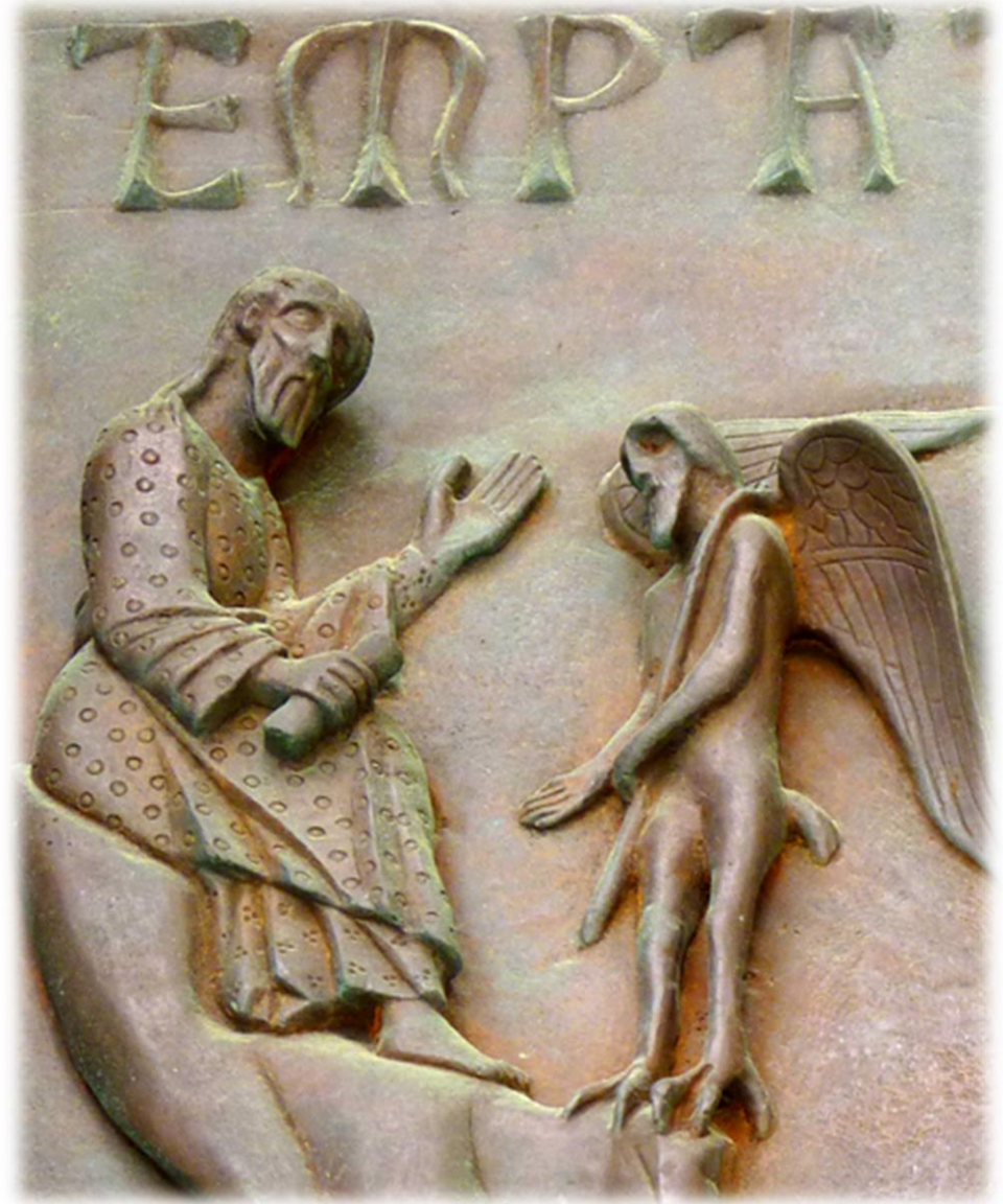
Temptation of Christ, South door, Duomo, Pisa, Italy