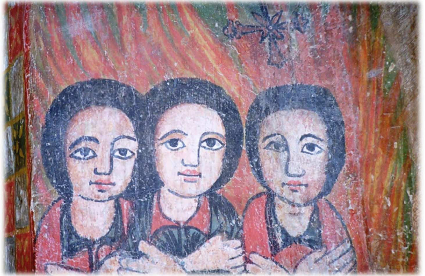
Three women praying - fresco from Gondar church in Ethiopia