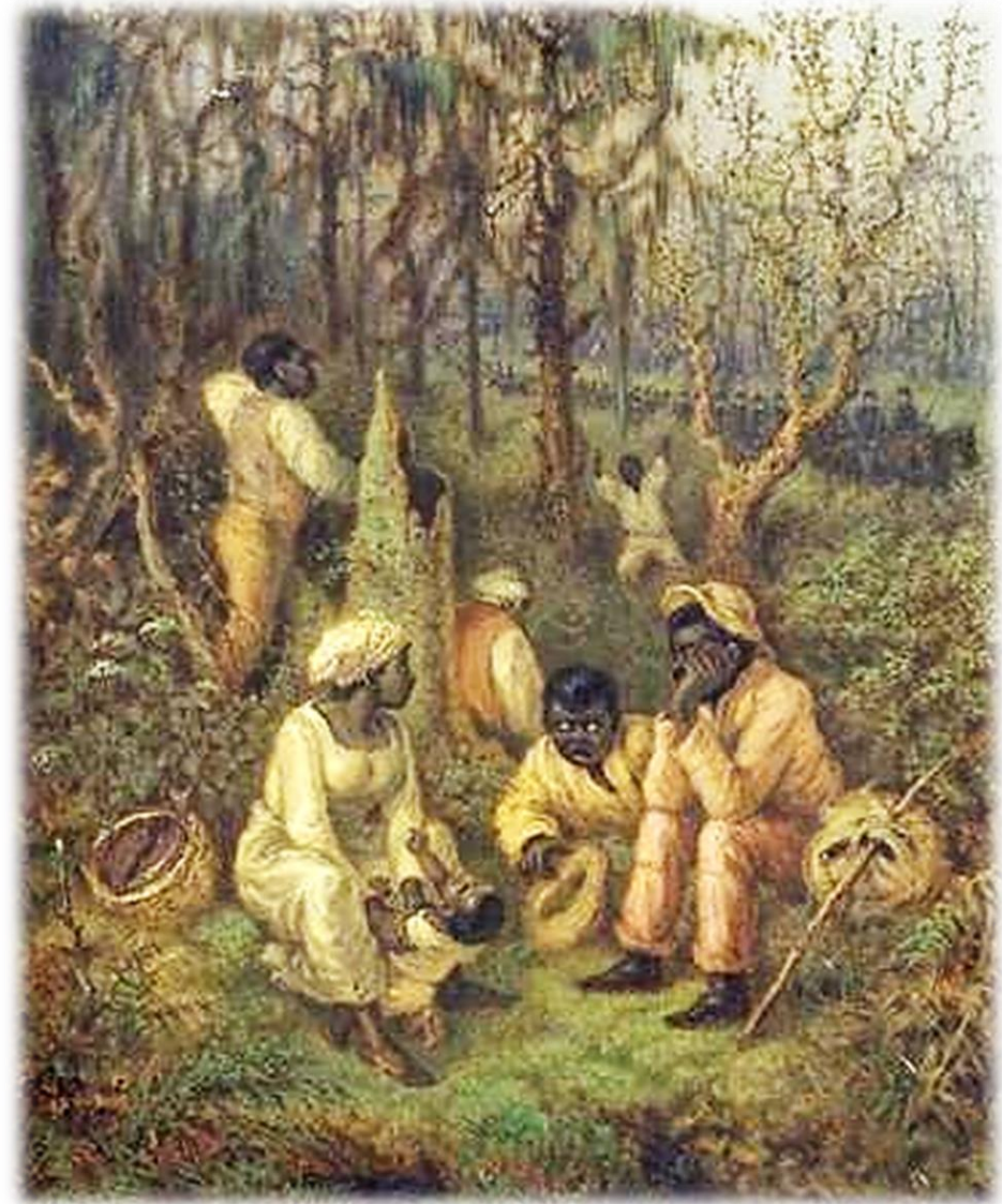
Fugitive Slaves in the Dismal Swamp New York Historical Society