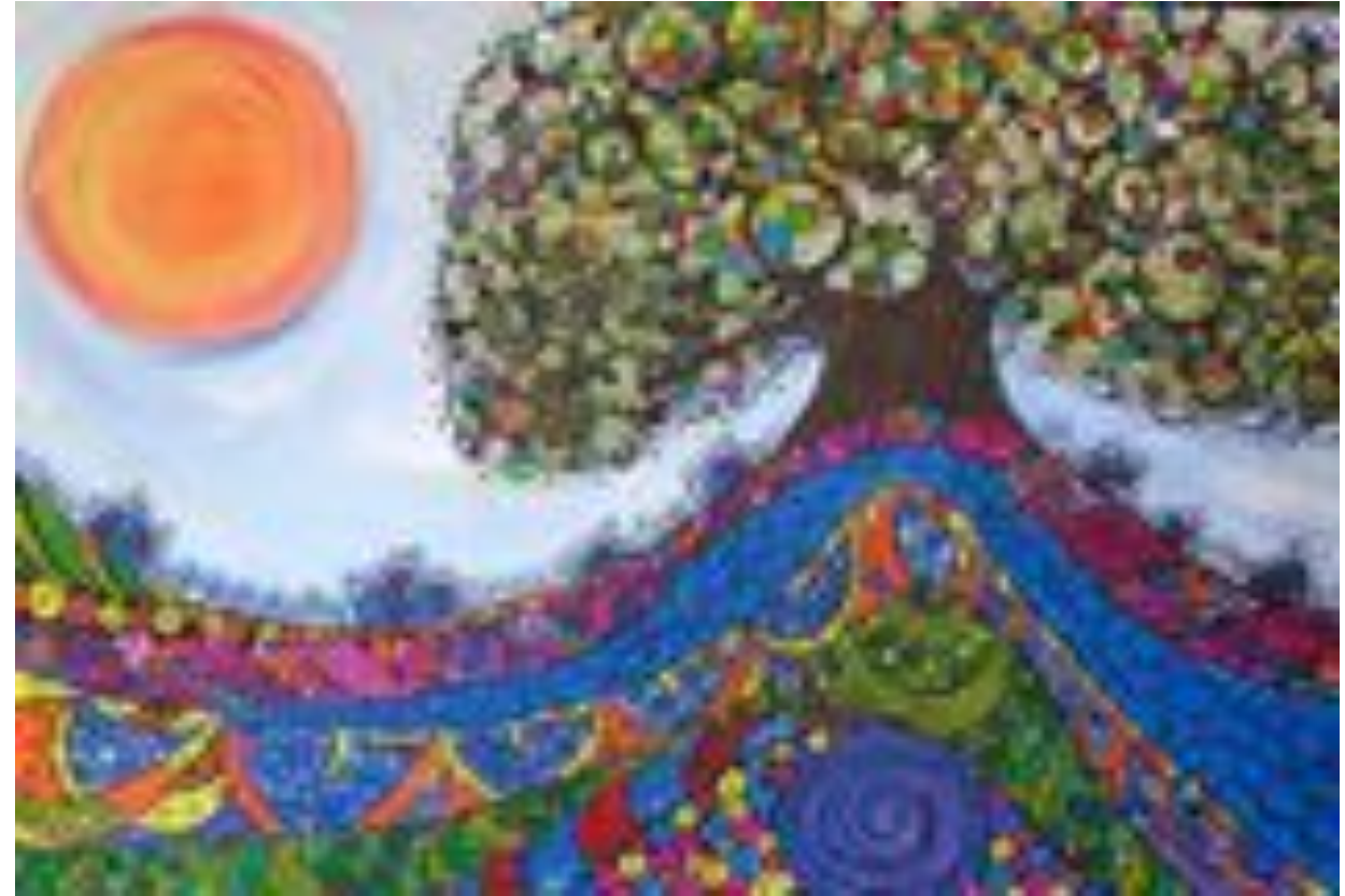
The Tree Of Hope, Julie Leuthold Palatine Chapel Palermo, Italy