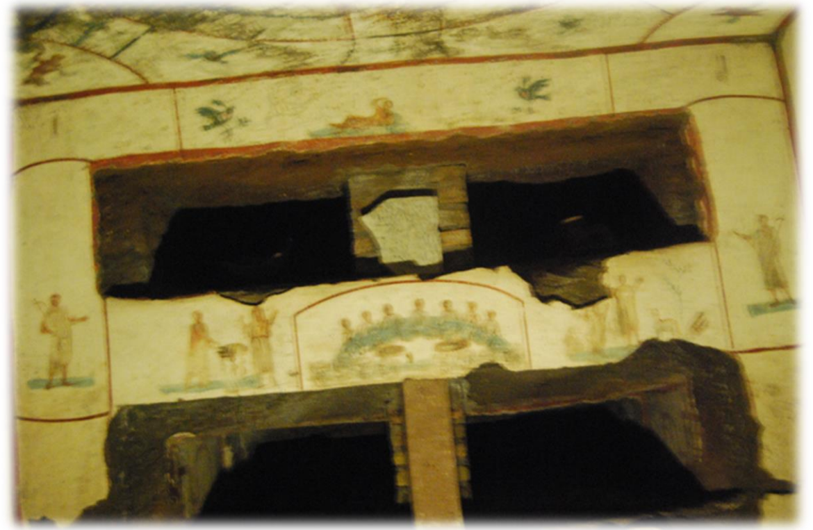
Catacomb of Callixtus, Eucharistic meal Cimitero di Callisto, Rome, Italy