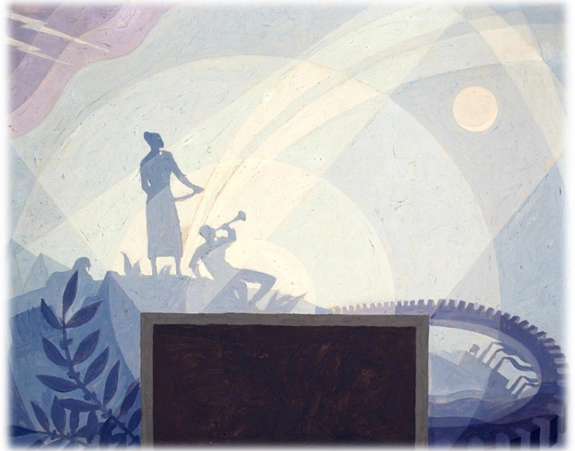
Study for Mural -- Aaron Douglas, Delaware Art Museum, Wilmington, DE