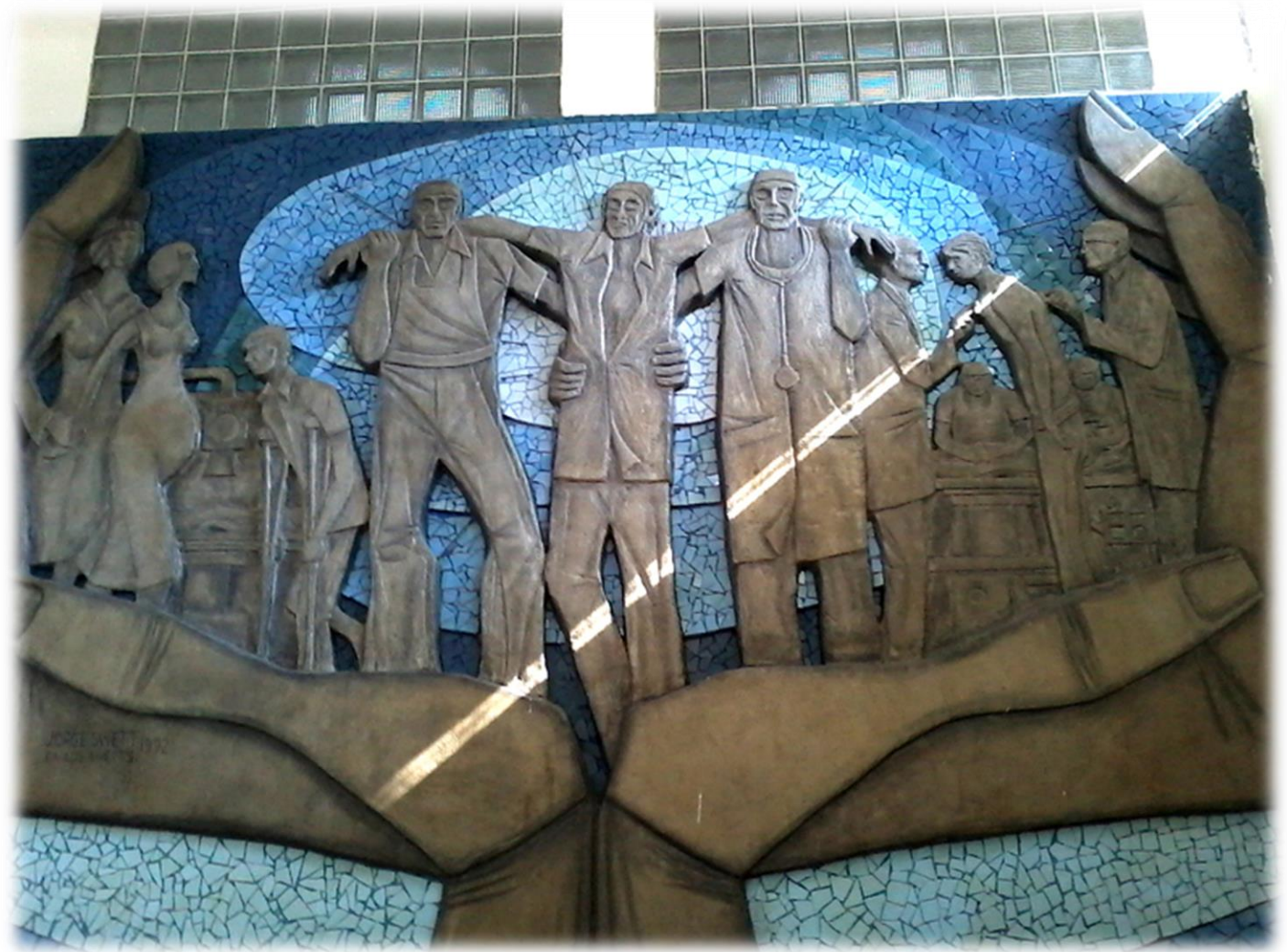
Healing Mural, Hospital Teodoro Maldonado Carbo, Guayaquil

First Reading: Sirach 38: 1-4, 6-10, 12-14