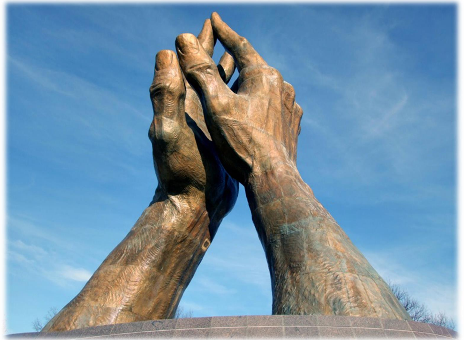
Healing Hands, Oral Roberts University Tulsa, Oklahoma