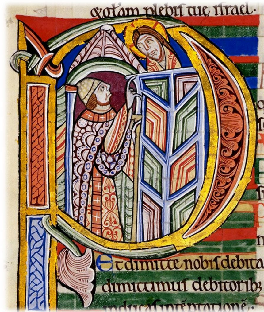
Lord's Prayer, Albani Psalter, Cathedral Library of the Cathedral of St Godehard