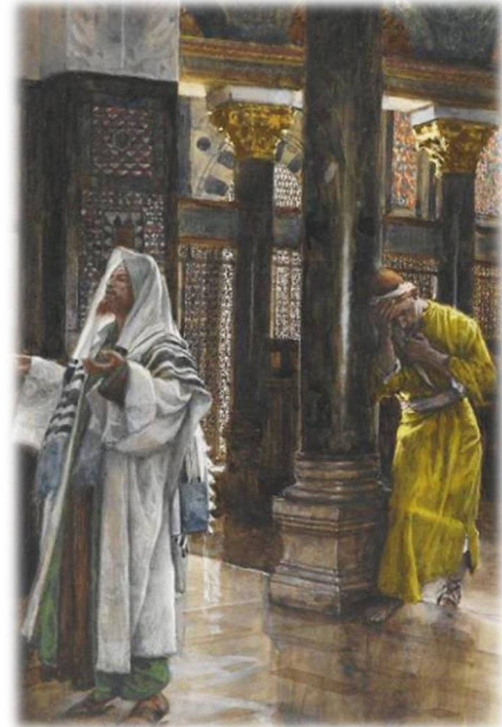
Pharisee and the Publican, James Tissot Brooklyn Museum, New York, NY

Gospel of Christ According to Matthew 6: 1-6, 16-21