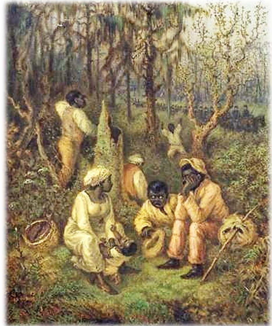
Fugitive Slaves in the Dismal Swamp