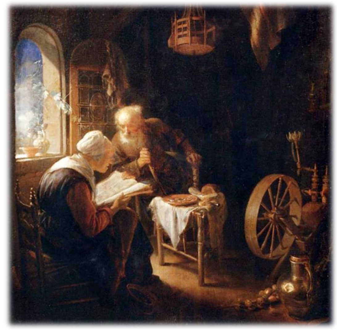
Reading the Bible, Gerrit Dou Louvre Museum, Paris, France