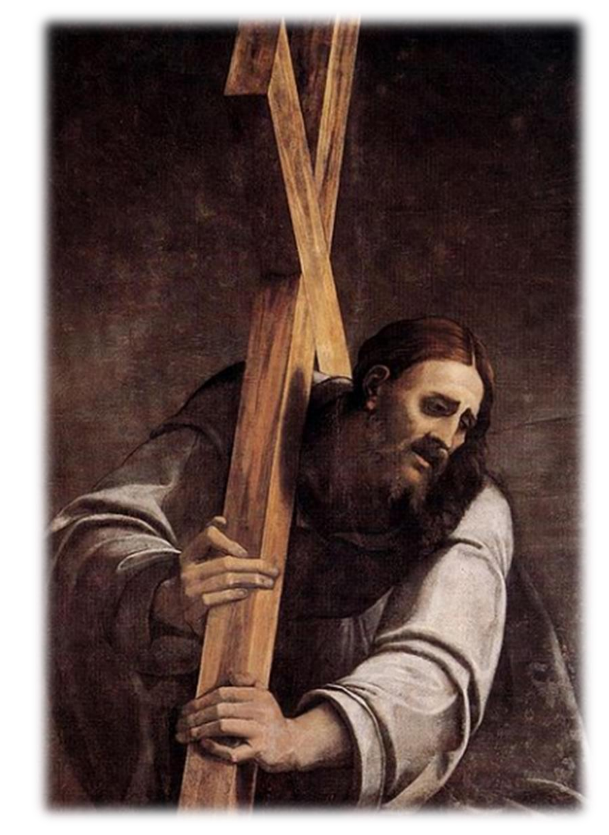
Christ Carrying the Cross, Del Piombo Sebastiano Museum of Fine Arts, Budapest, Hungary