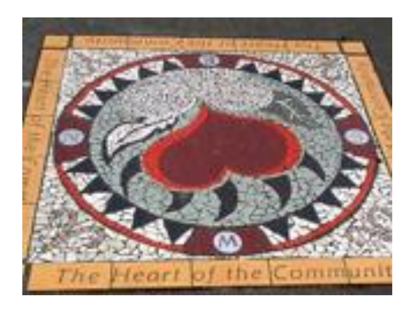
The Heart of the Community Corner of Hastings St and Main St, Vancouver, BC