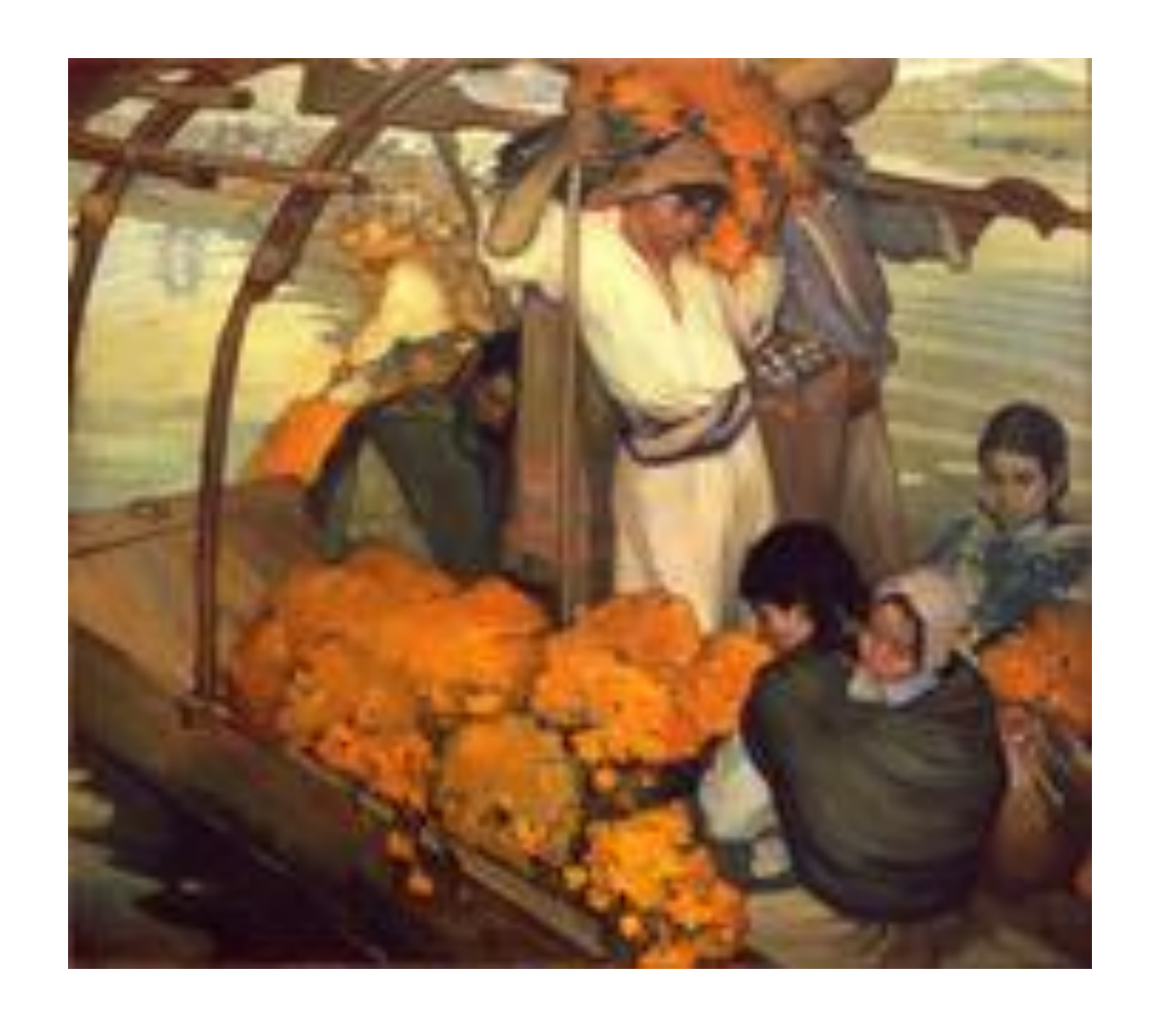
La Ofrenda, or, The Offering, Saturnino Herran Museo Nacional de Arte, Mexico City