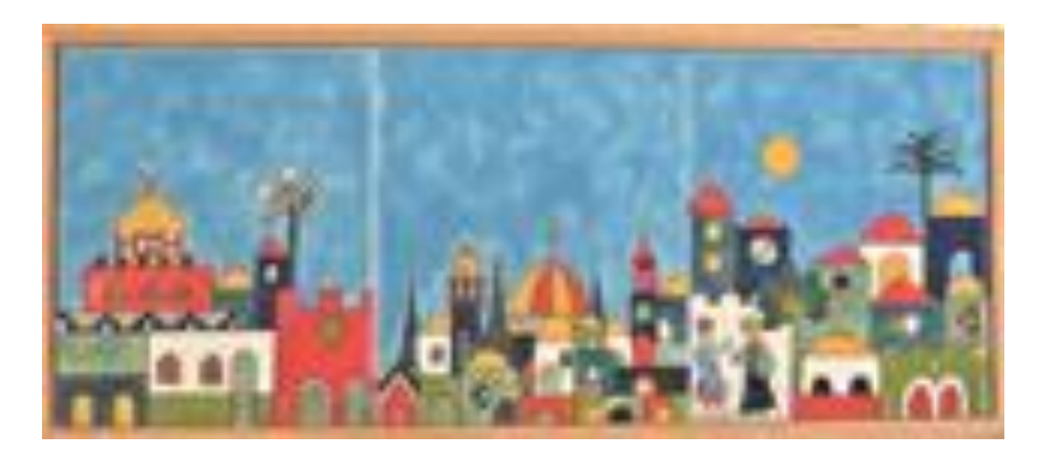
Armenian Pottery Painting Armenian Quarter, Jerusalem, Israel