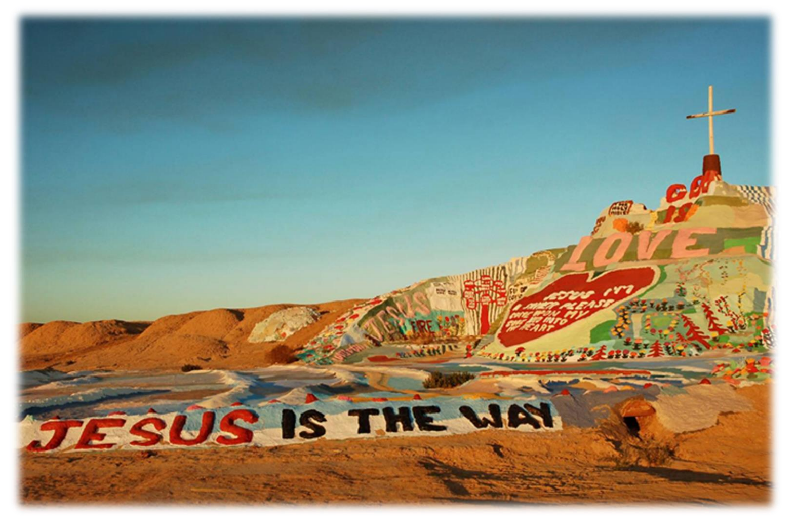
Salvation Mountain -- Leonard Knight, Niland, CA