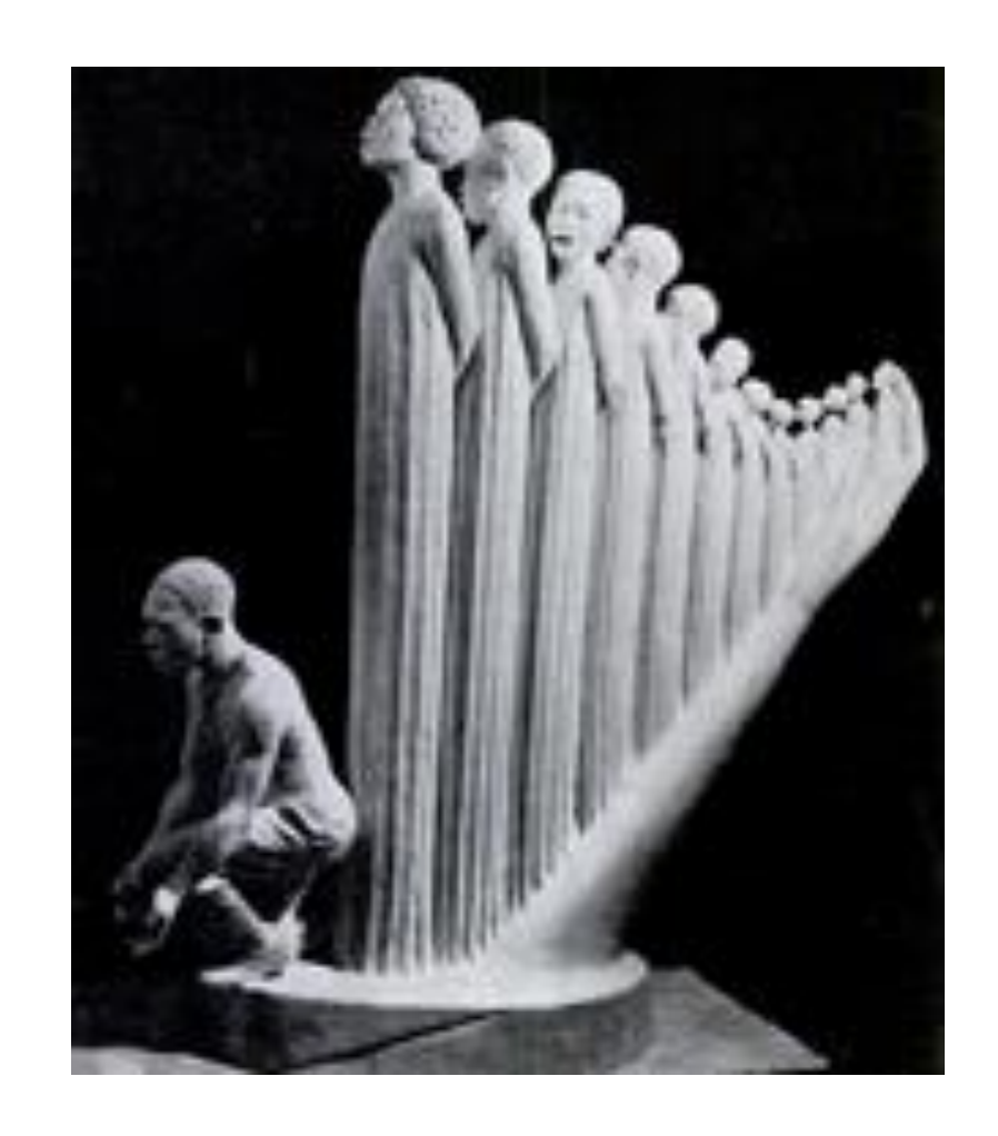
Lift Every Voice and Sing Augusta Savage