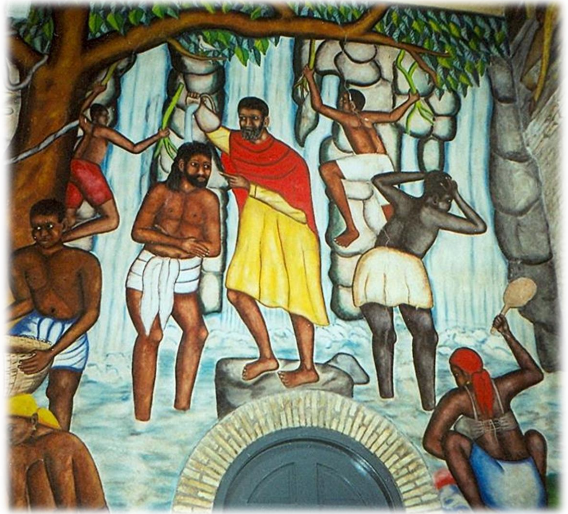
Baptism of Jesus, Castera Bazile Cathedral of the Holy Trinity, Port-au-Prince, Haiti