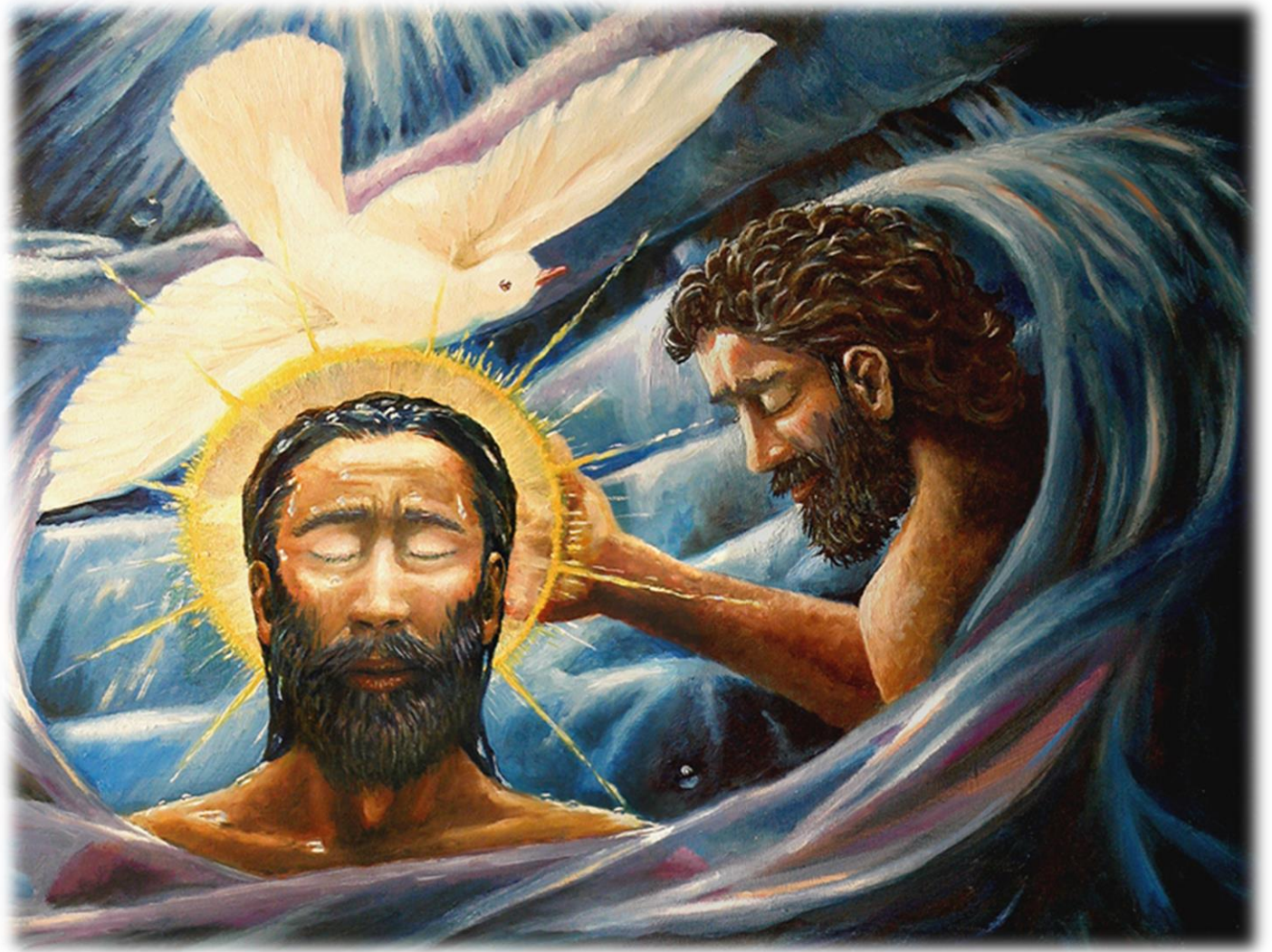
Baptism of Christ -- Dave Zelenka