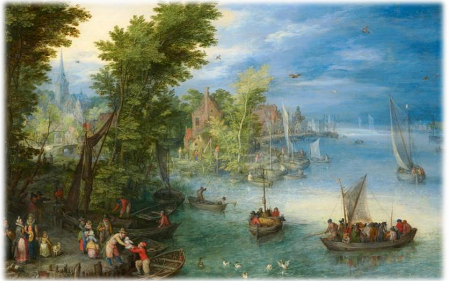
River Landscape, Bruegel, Jan, 1568-1625