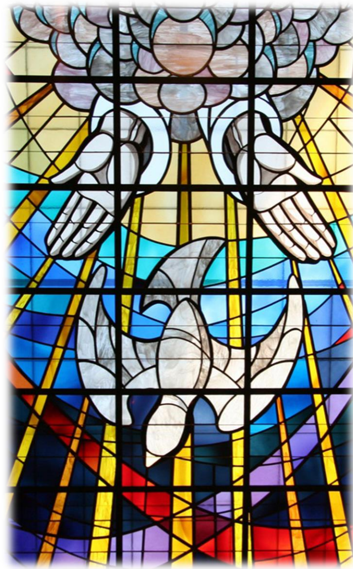
God's Hands and the Holy Spirit, Record number: [56826]