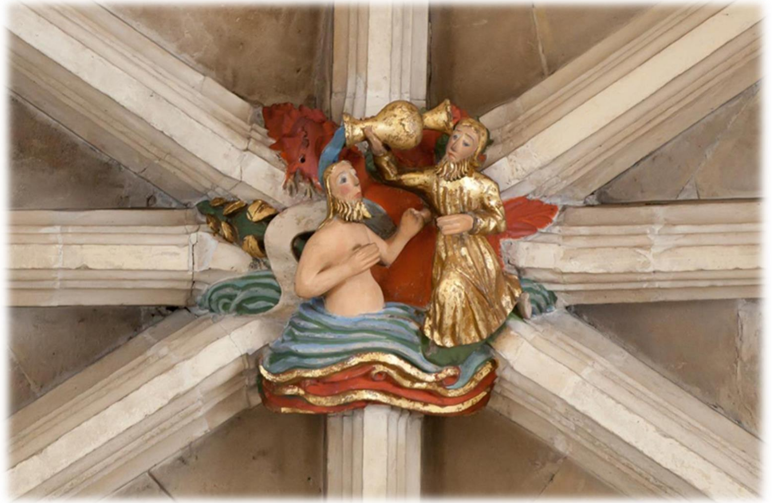
Baptism of Christ by John the Baptist, Record number: [55202]