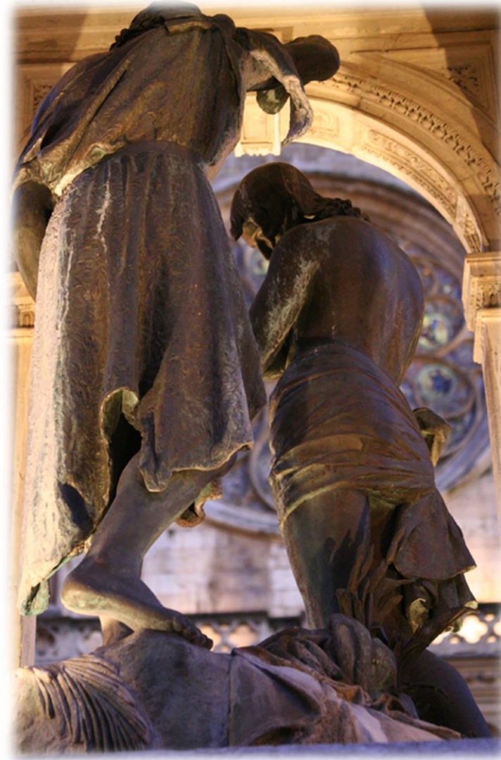
The Baptism of Christ, Record number: [54152]