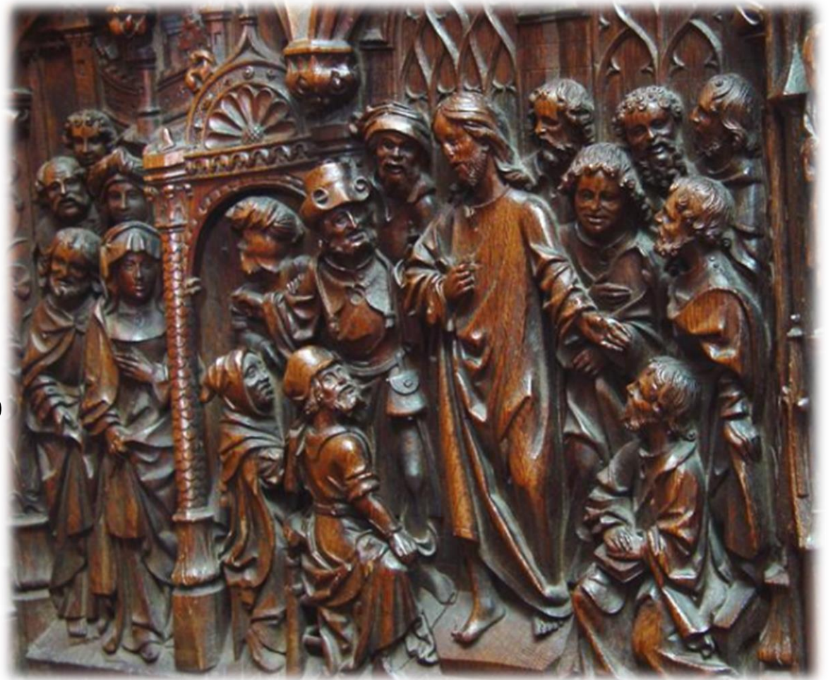
Jesus Teaches in the Temple, Amiens Cathedral Amiens, France