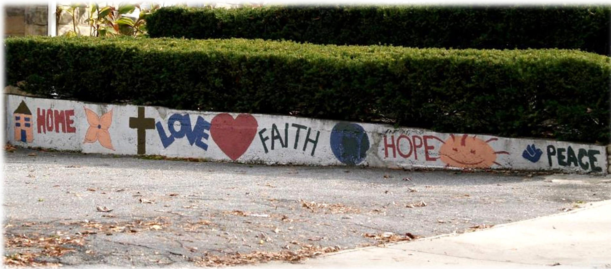
"Home, Love, Faith, Hope, Peace" Mural, Philadelphia Avenue, Takoma Park, MD