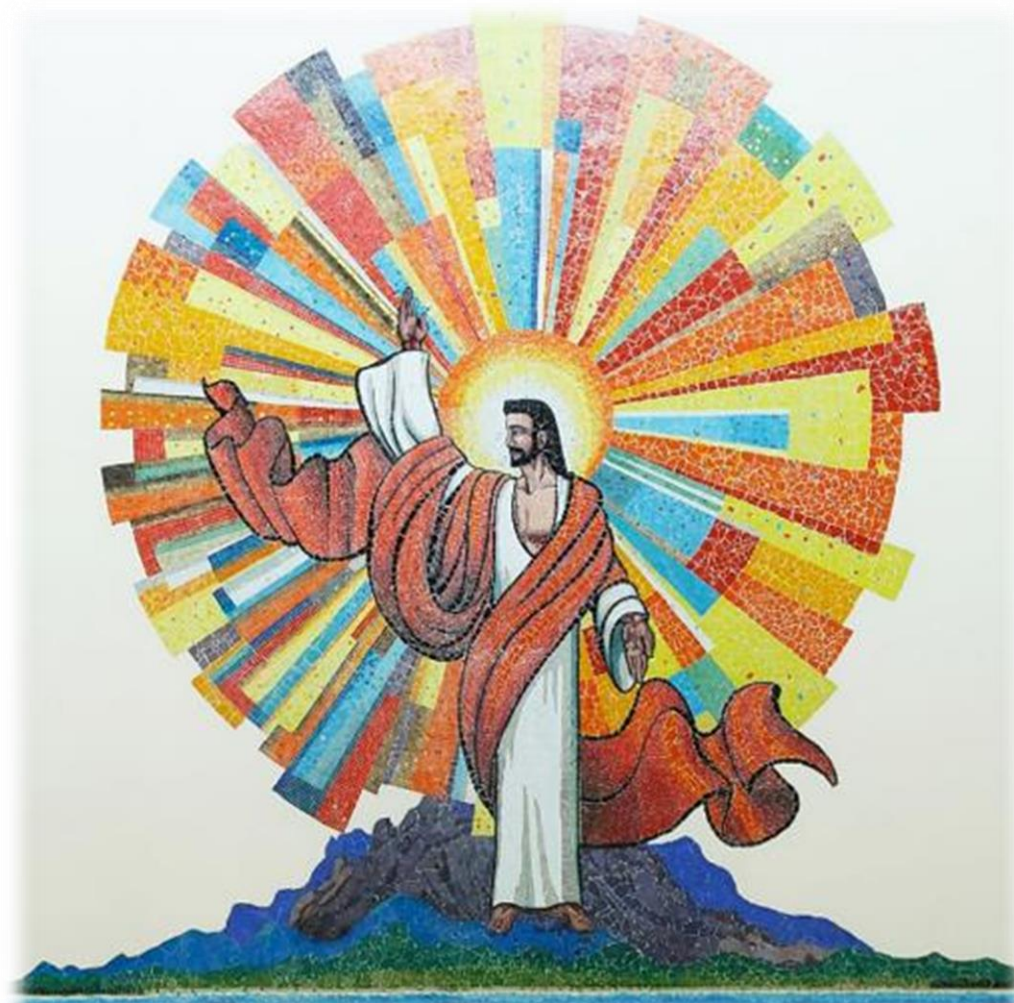
Christ Mosaic, Record number: [57444]