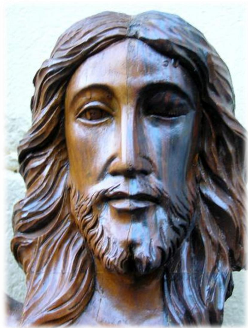
Christ Crucified and Risen, Record number: [56938]