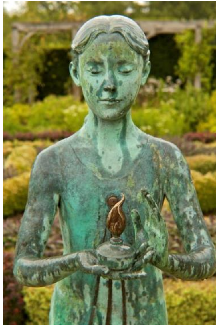
Lamp of Wisdom, Waterperry Gardens Oxfordshire, England