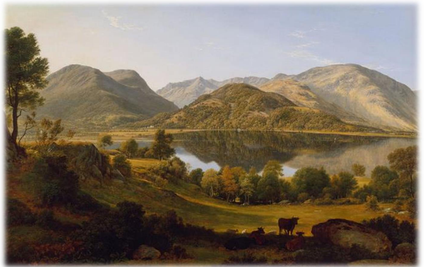
Ullswater, early morning, Glover, John, 1767-1849