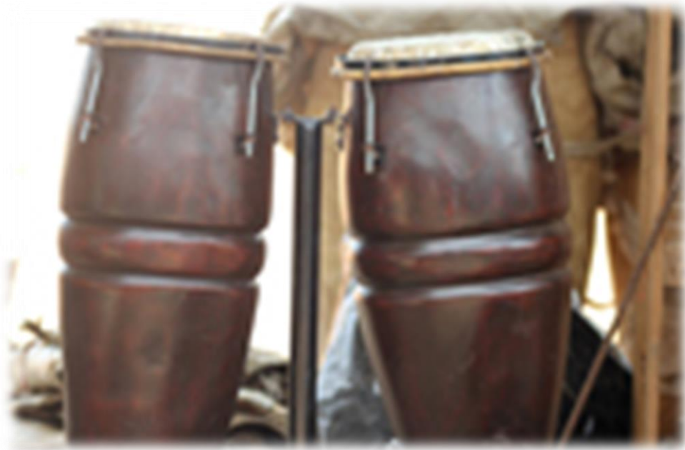
Church Drums, Record number: [58014]