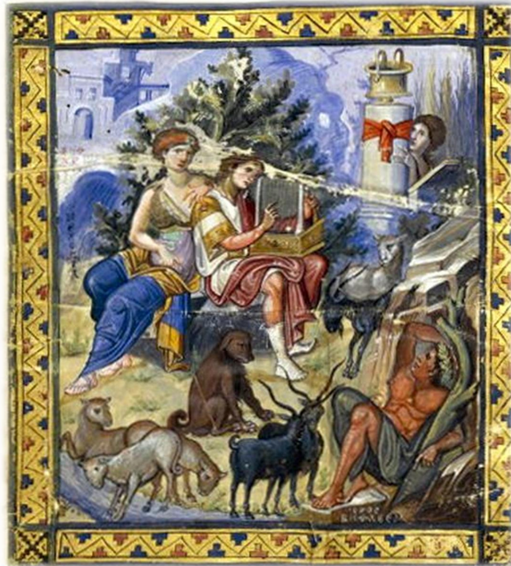
David Composing Psalms, Record number: [57281]