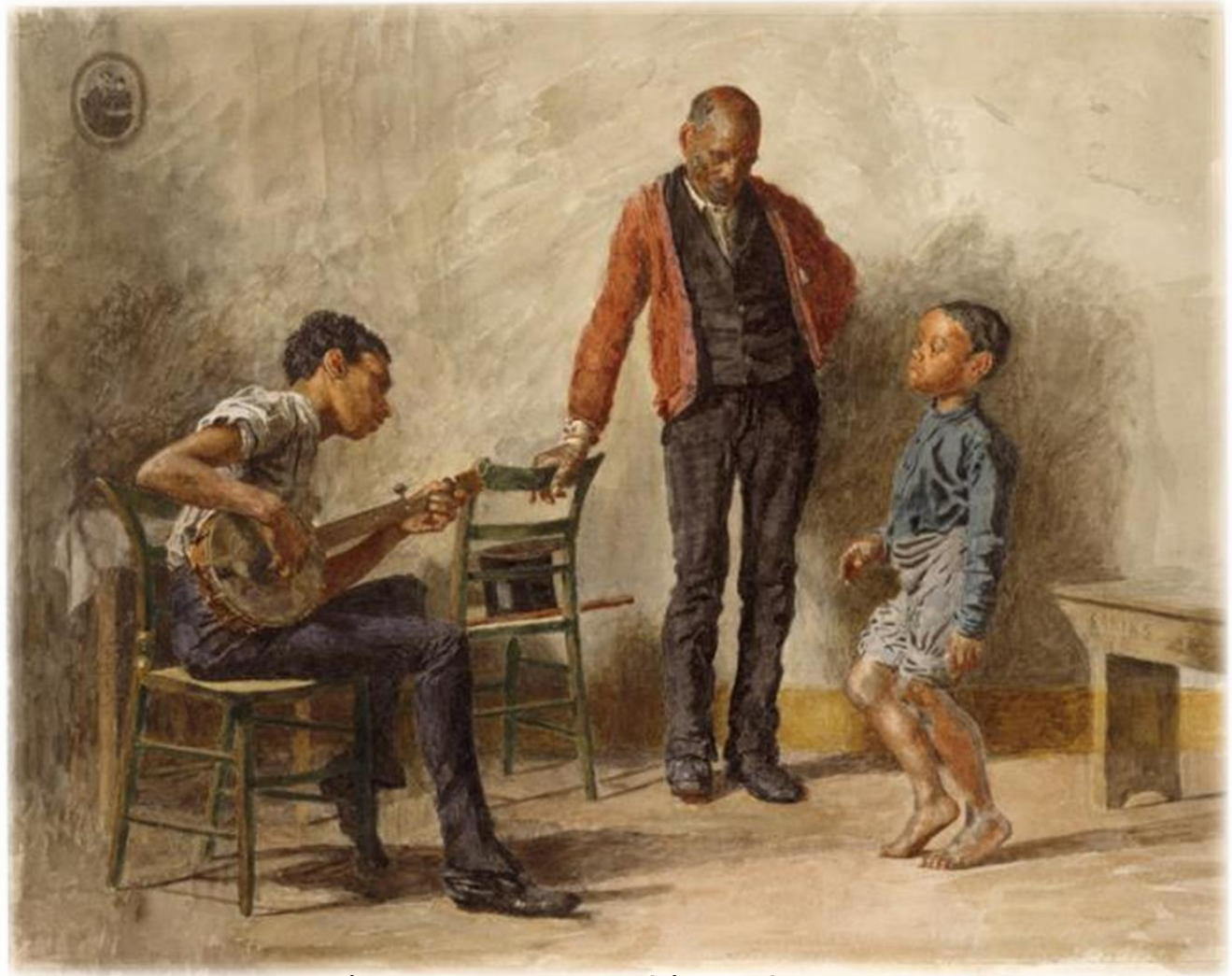
Dancing Lesson, Eakins, Thomas