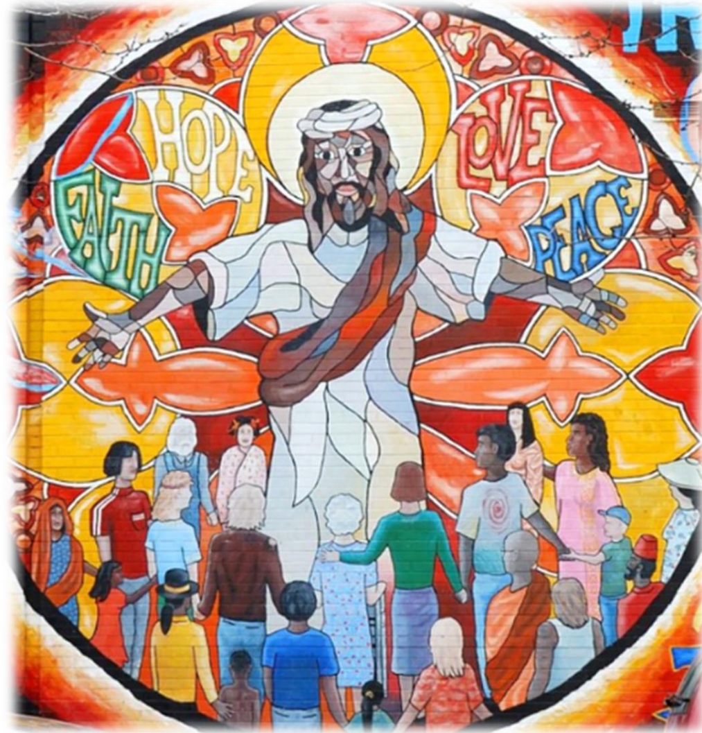
Jesus Mural of Faith, Hope, Love, and Peace

The Holy Gospel of Christ according to Luke 4: 14-21