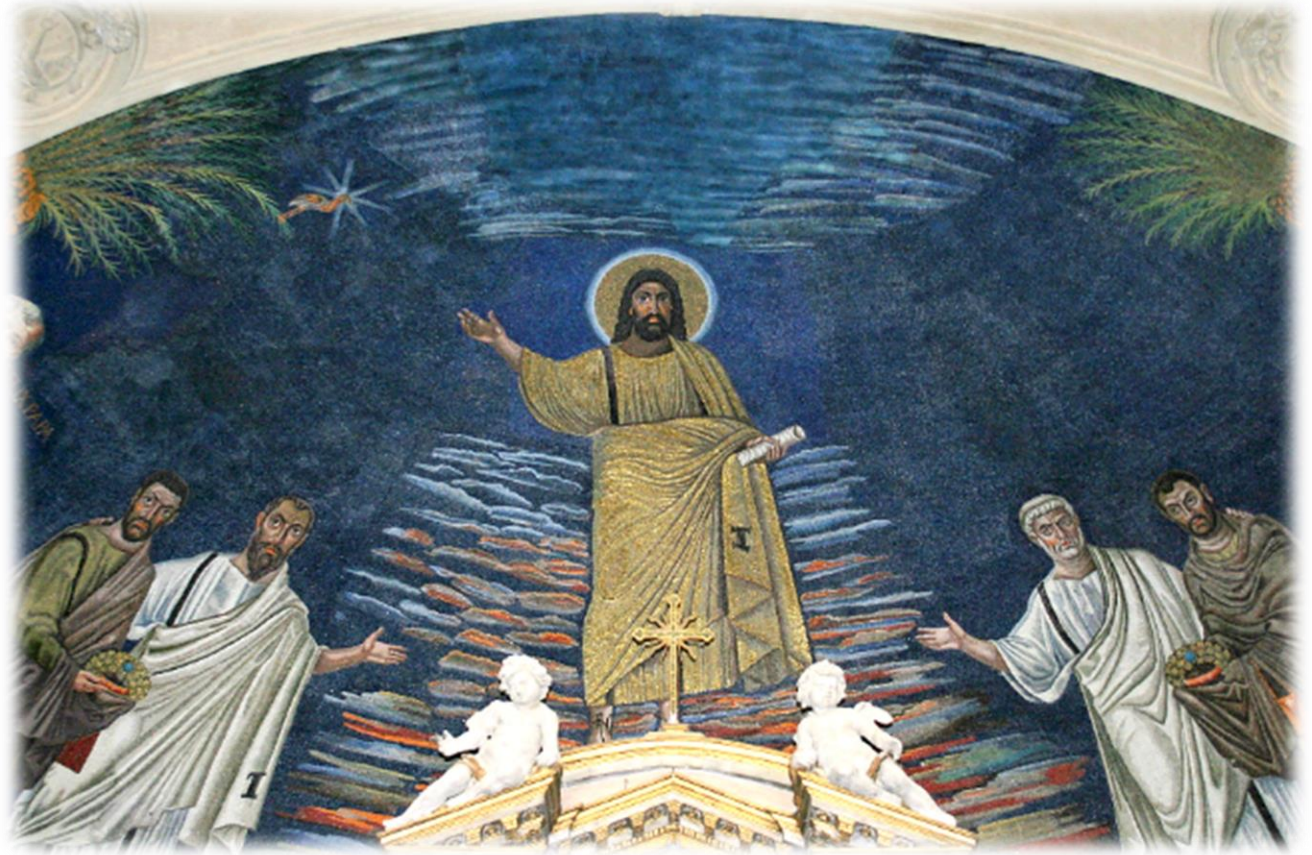
Apse Mosaic -- Basilica of Cosmas and Damien, Rome, Italy