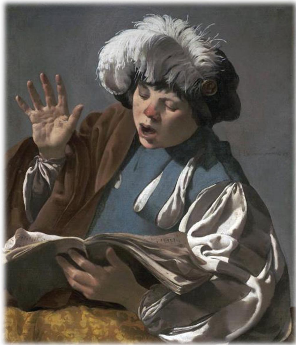
Boy Singing, Terbrugghen, Hendrik, 1588?-1629