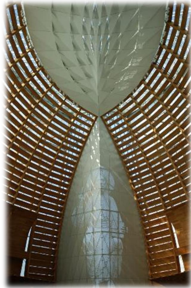
Cathedral of Christ the Light