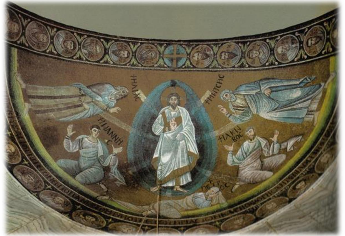
Transfiguration of Jesus Christ, Record number: [58648]

This is my beloved Son, with whom I am well pleased; listen to him. Matthew 17.5