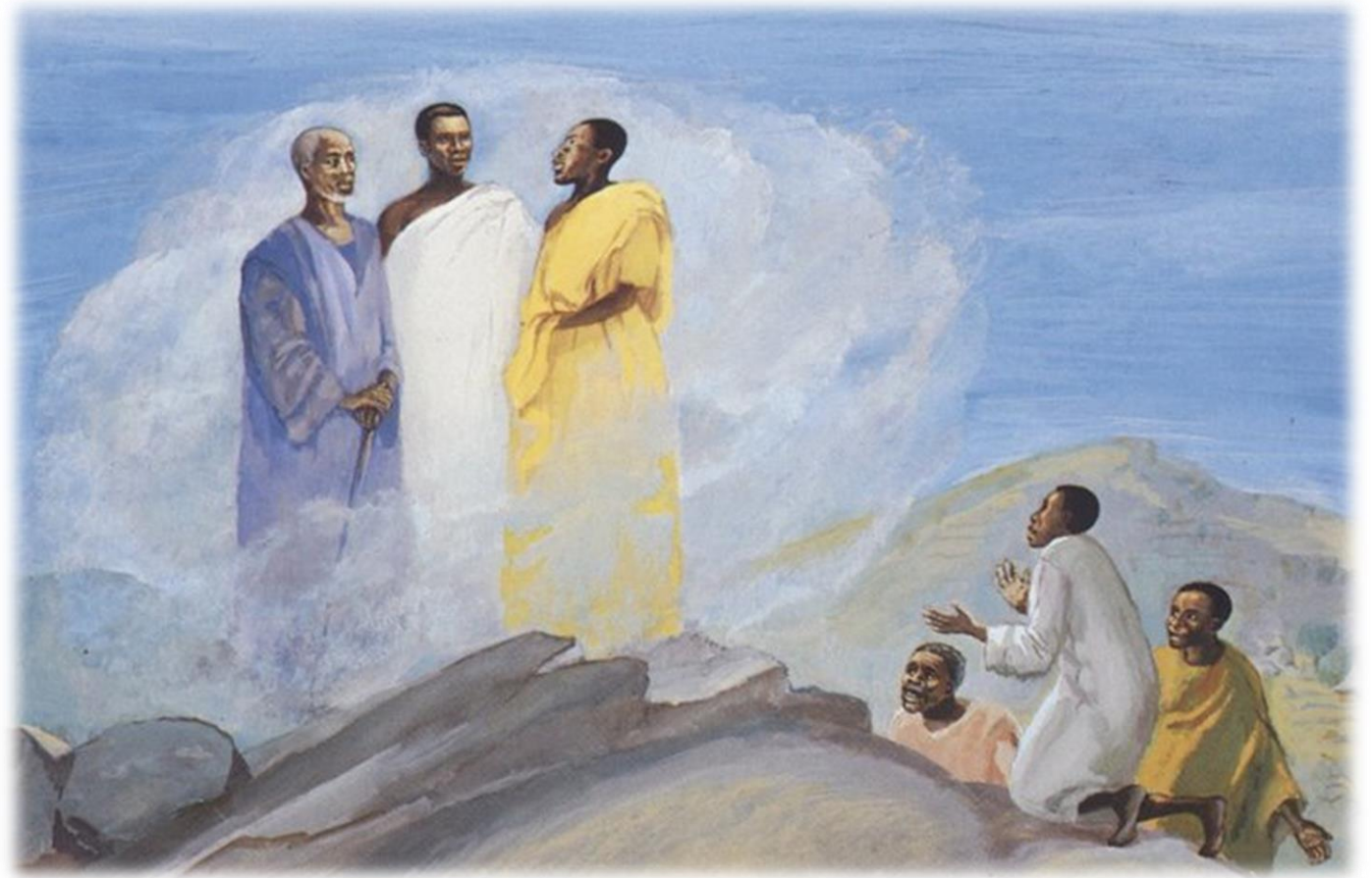
Transfiguration, Record number: [48307]