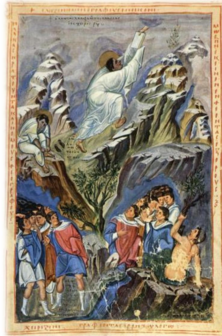
Moses receiving the tablets of the law on Mount Sinai, Record number: [55133]