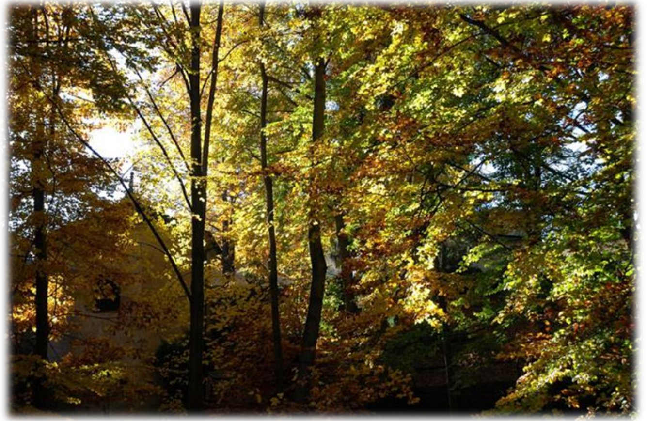
The Holy Mount of Varallo Sesia, Record number: [54285]

Gospel of Christ According to Luke 9: 28-36, (37-43)