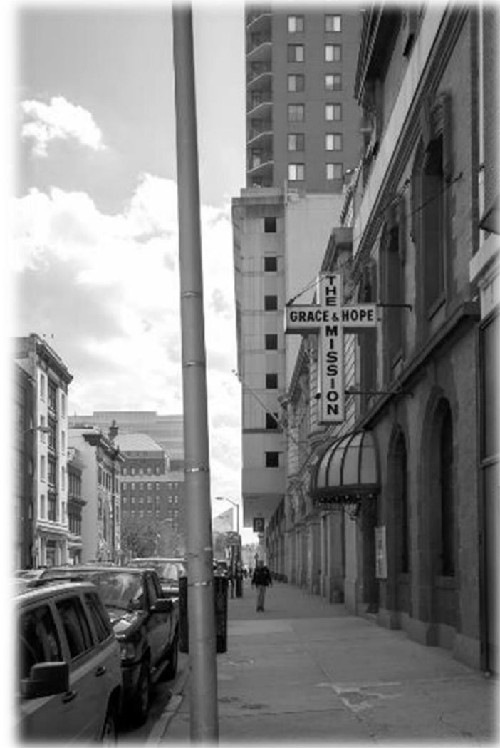
Grace and Hope Mission, Record number: [57194]