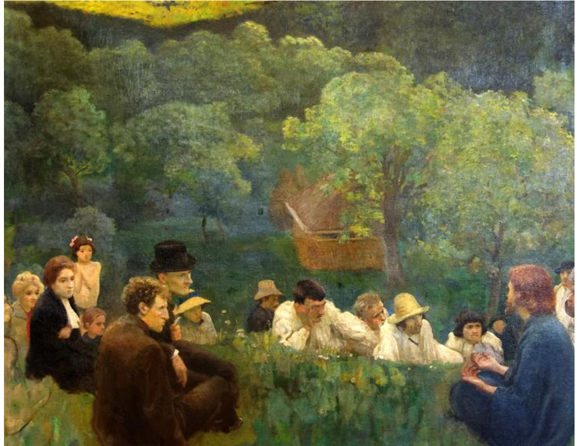
Sermon on the Mount, Karoly Ferenczy, Hungarian National Gallery, Budapest, Hungary