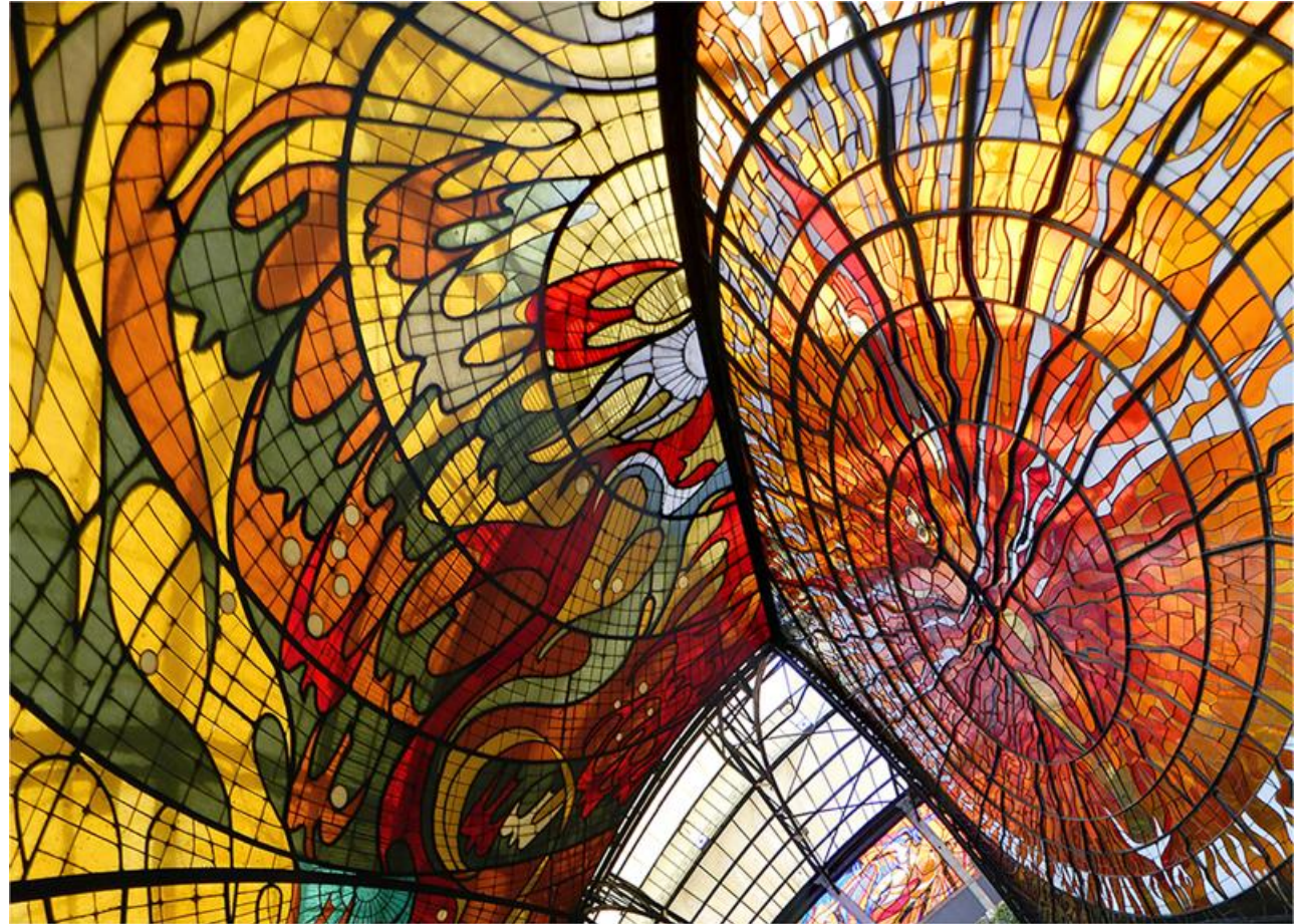
Cosmovitrail, Leopoldo Flores Toluca, Mexico