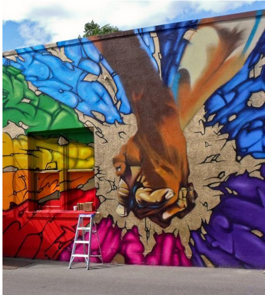
Elements of Peace, Kelowna, British Columbia