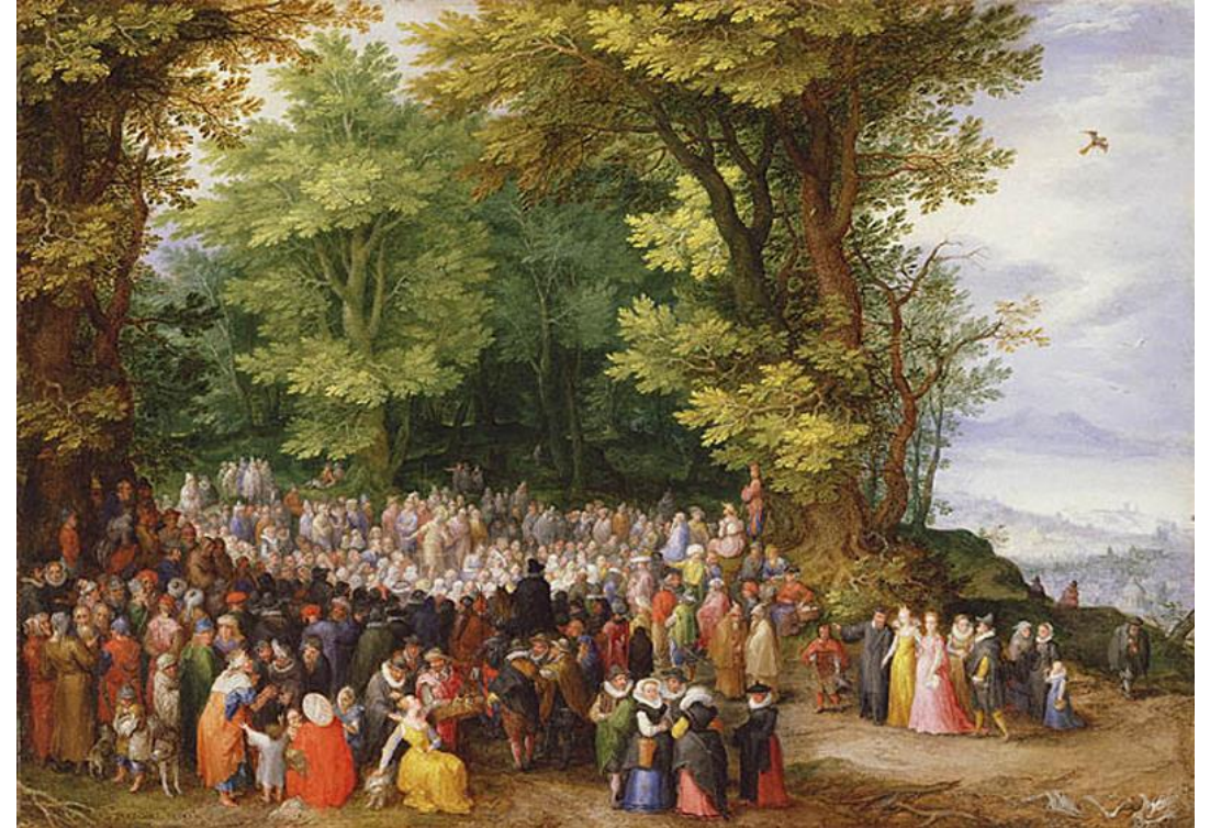
Sermon on the Mount, Jan Bruegel Getty Center, Los Angeles, California

Rejoice and leap for joy, for behold, your reward is great in heaven. Luke 6:23