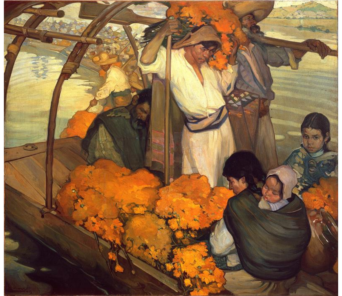
The Offering, Saturnio Hérran Museo Nacional de Arte, Mexico City, Mexico