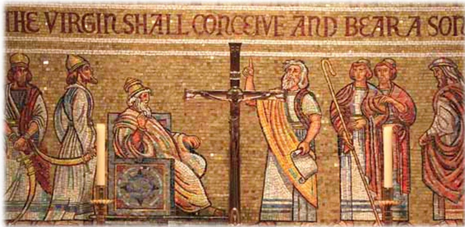
Emmanuel, God With Us, Anonymous Basilica of the National Shrine of the Immaculate Conception, Washington, D.C.