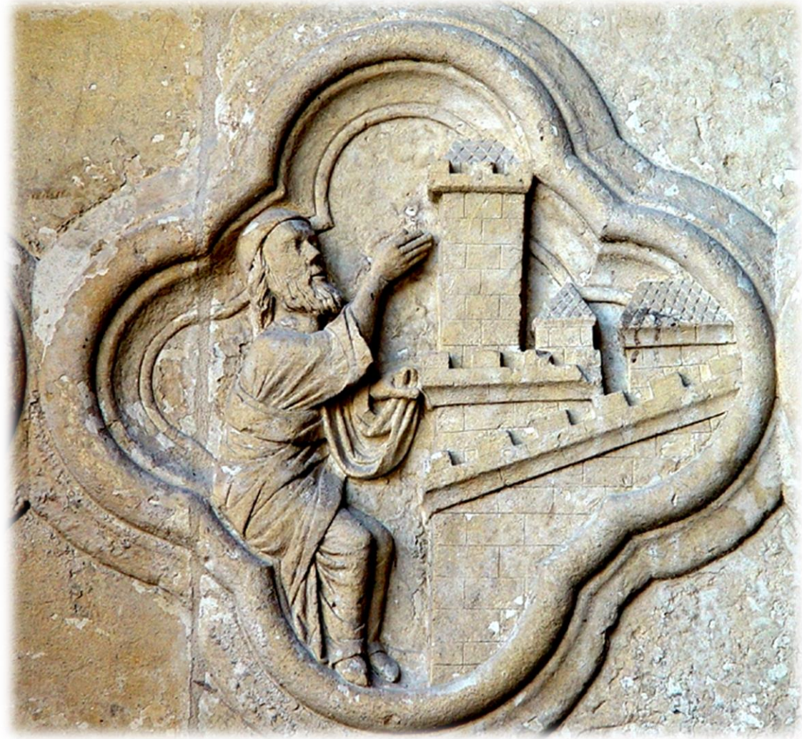
Isaiah Prophecy the Adoration of Christ Cathédrale d'Amiens, Amiens, France