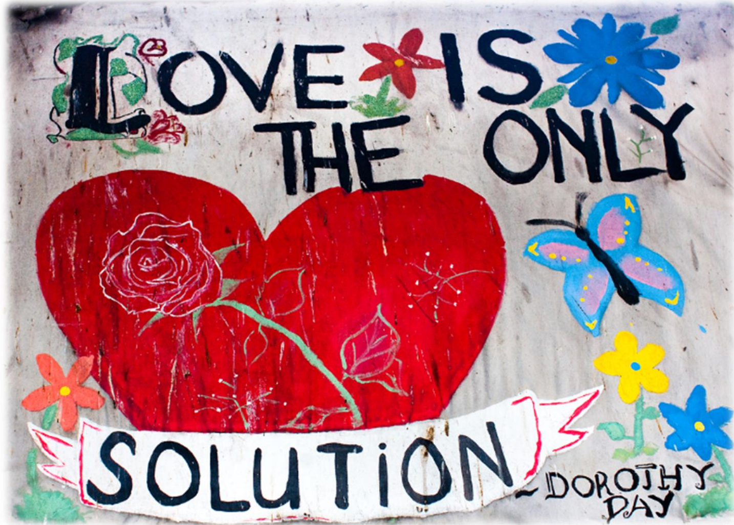
"Love is the Only Solution", Dorothy Day Mural in San Francisco, CA

As we await our coming Saviour, go in peace to love and serve the Lord. In the name of Christ. Amen.