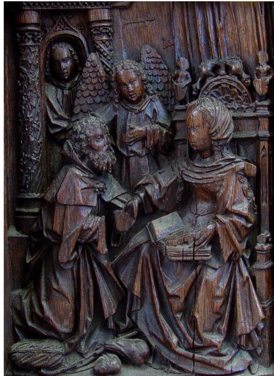
Joseph is betrothed to Mary Cathédrale d'Amiens, Amiens, France