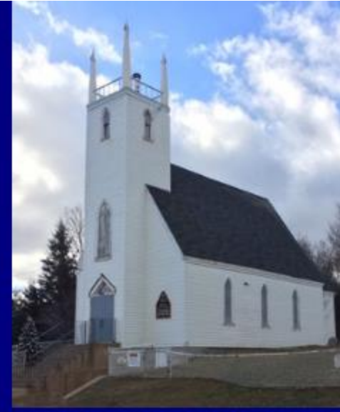
St. Mark's, Mill Cove