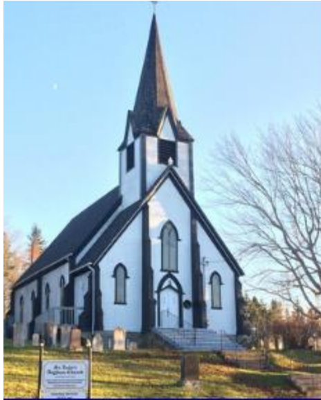
St. Luke's, Hubbards