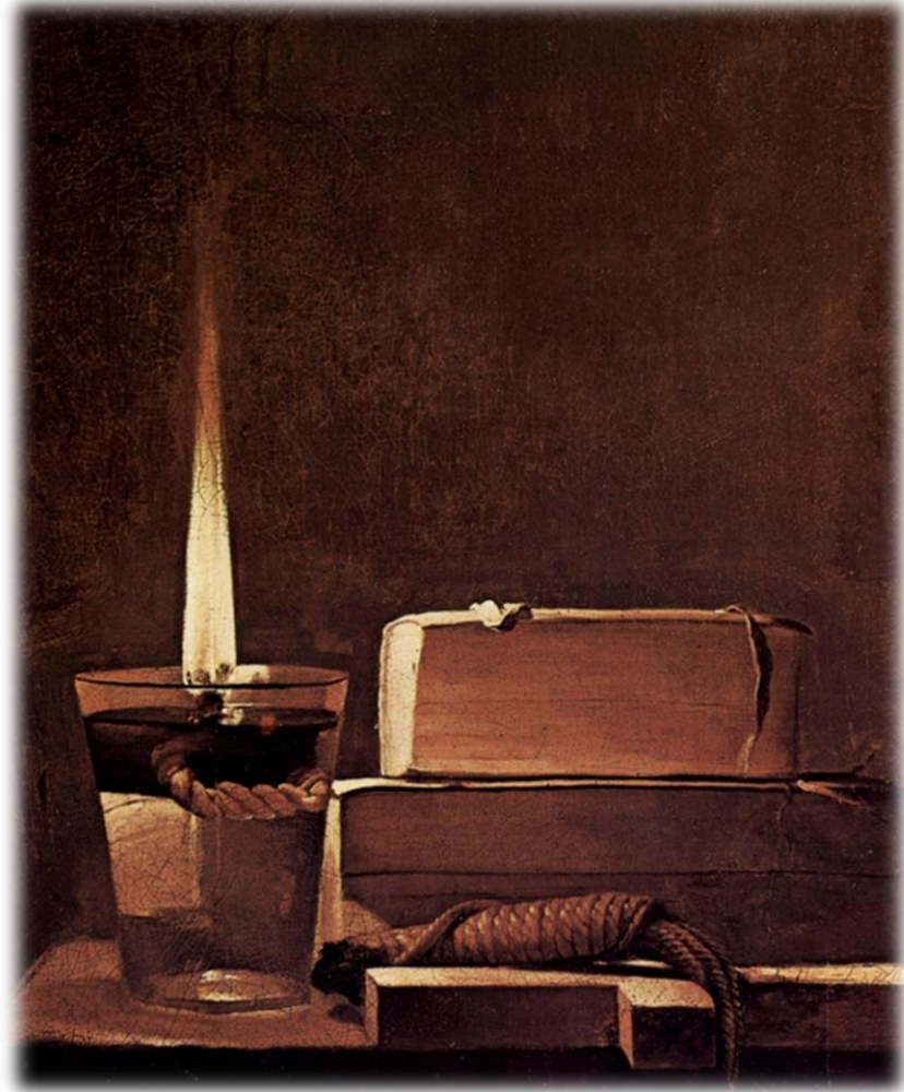
Atonement of Mary Magdalene, detail of candle and book Georges du Mesnil de la Tour, Wrightsman Collection, New York, NY