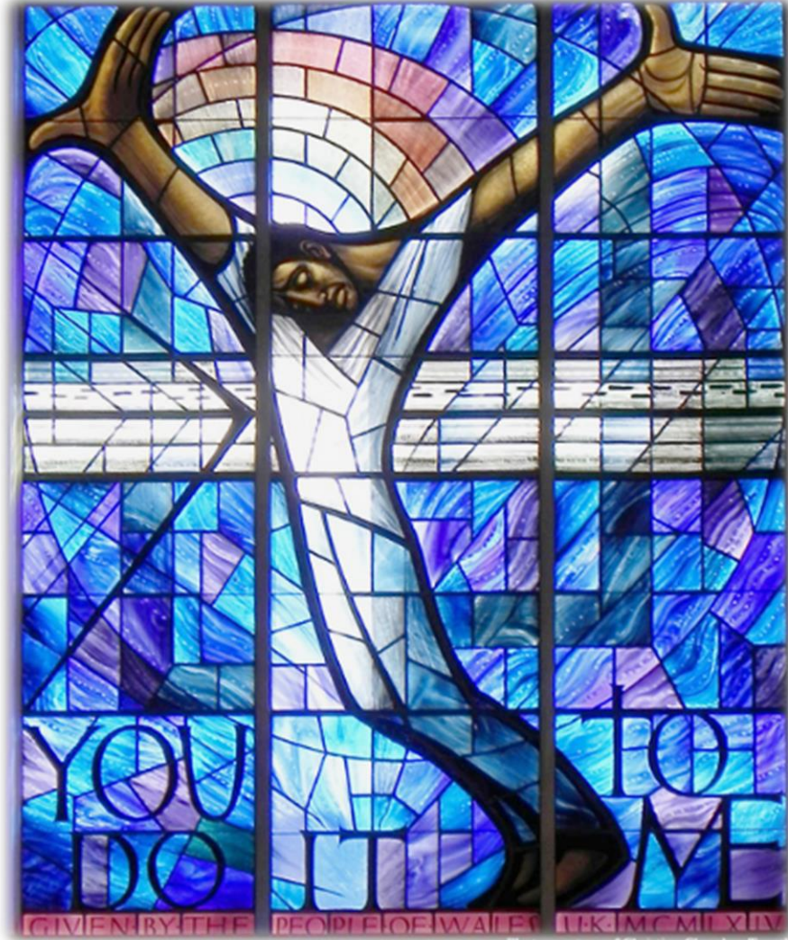
Christ Crucified, Stained glass window given by the people of Wales, Sixteenth Street Baptist Church, Birmingham, AL