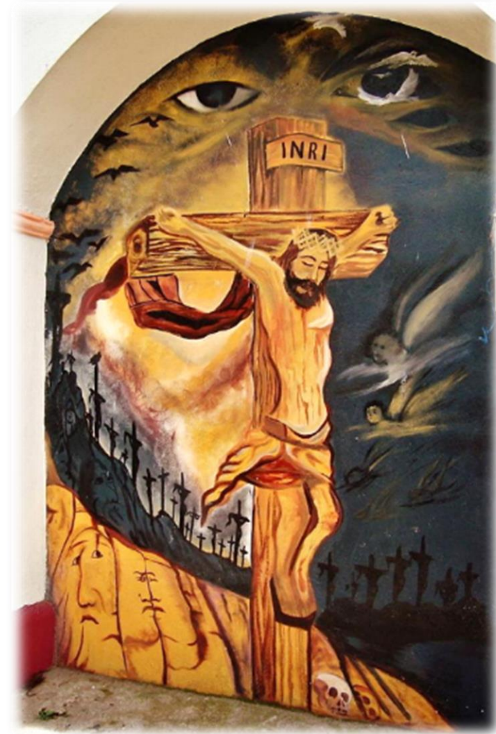
Crucifixion, Parish Church, Coatepec, Mexico

Christ the Lord became obedient unto death, Even death on a cross.