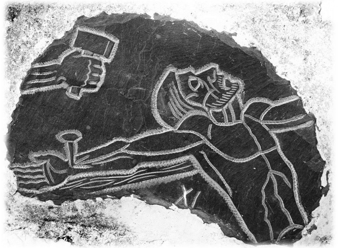
Nailed to the Cross -- Notre Dame de la Garde, Marseille, France