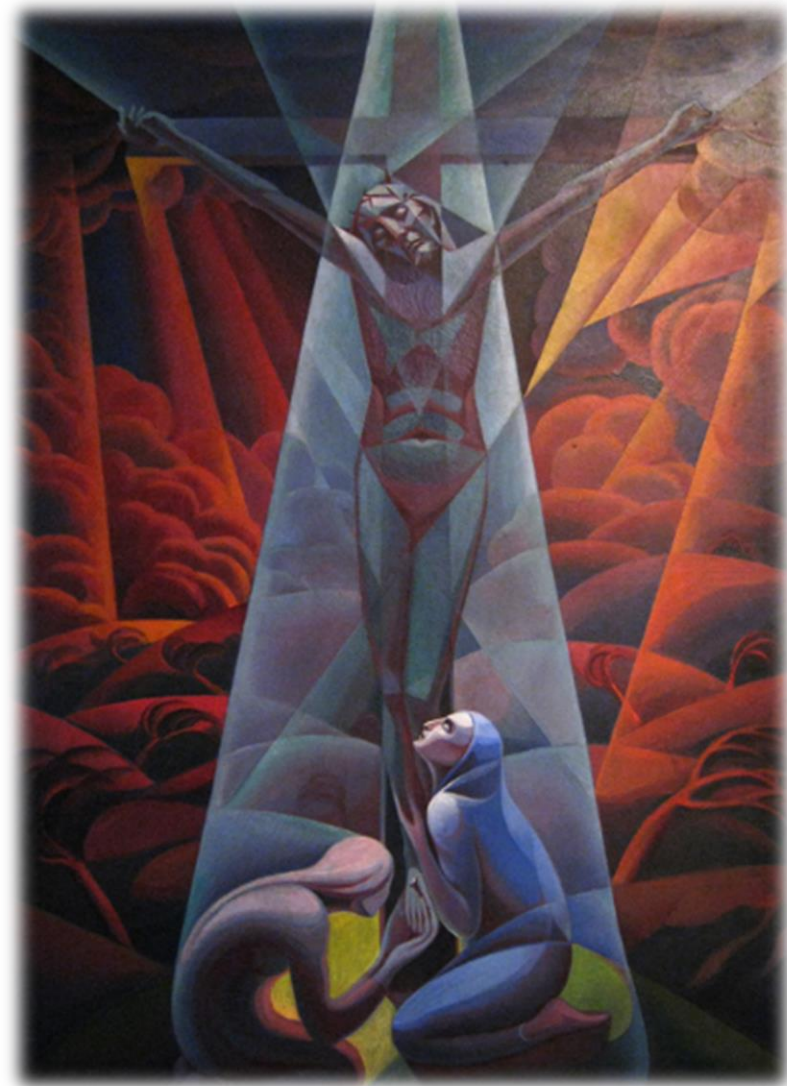
Crucifixion Gerardo Dottori, Vatican Museum, Vatican City