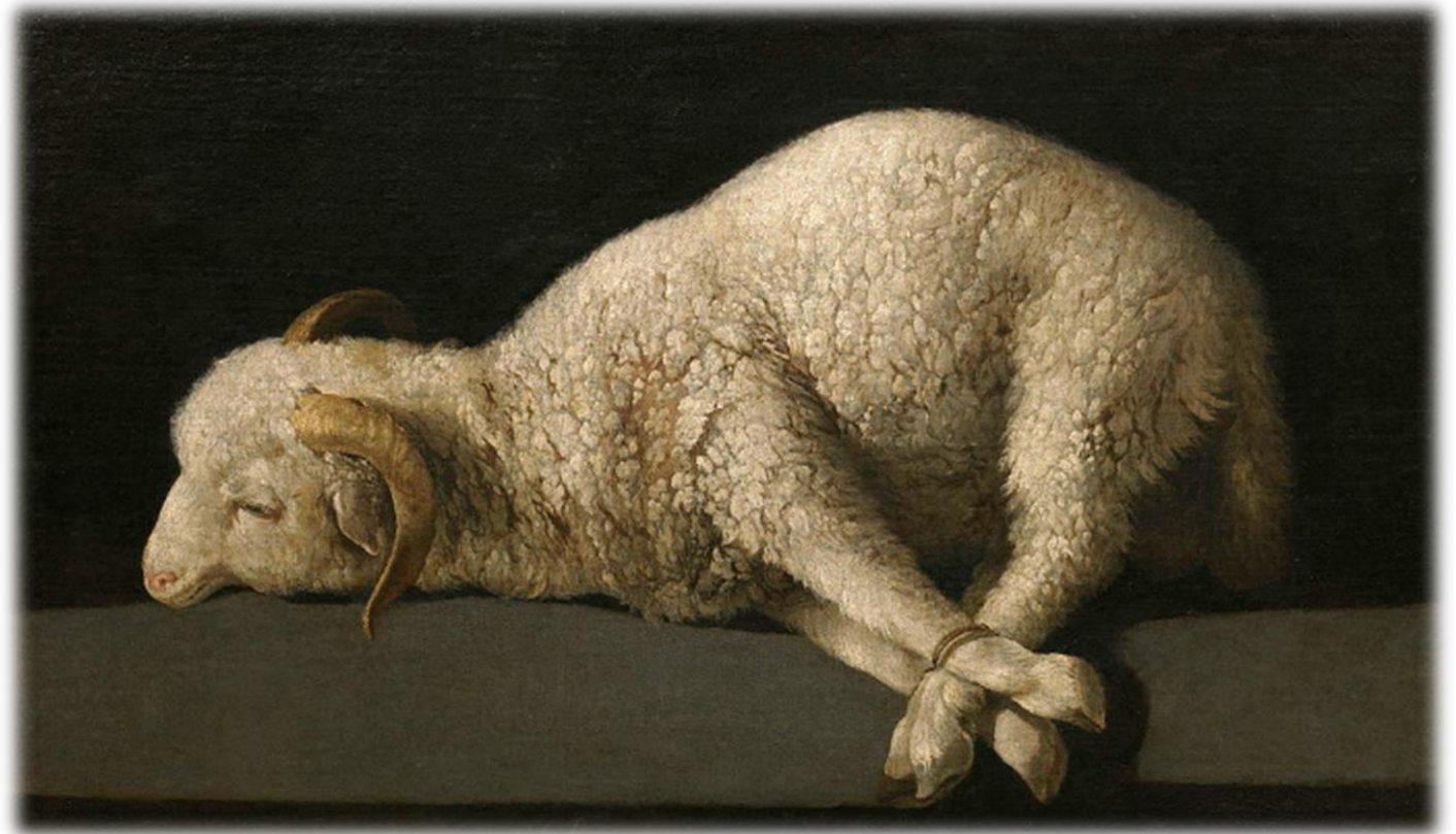
Lamb of God -- Francisco de Zurbarán, Prado, Madrid, Spain

First Reading: Exodus 12: 1-4, (5-10), 11-14