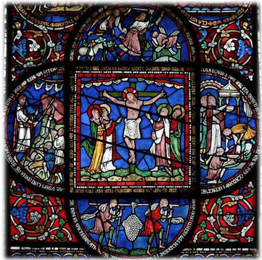
Crucifixion surrounded by scenes from Bible that presage Christ's life and sacrifice, Record number: [55084]