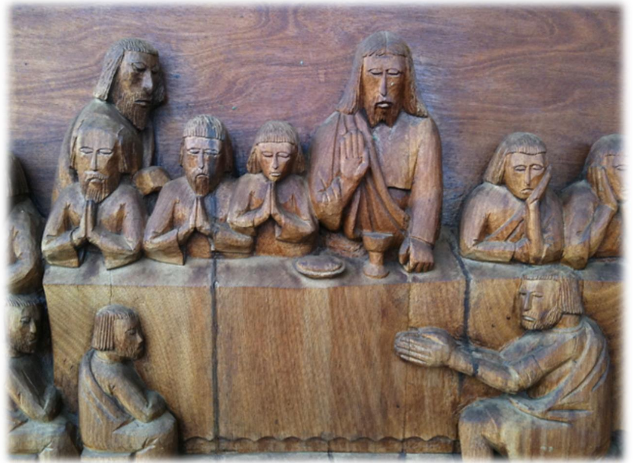
Last Supper Capetown, South Africa