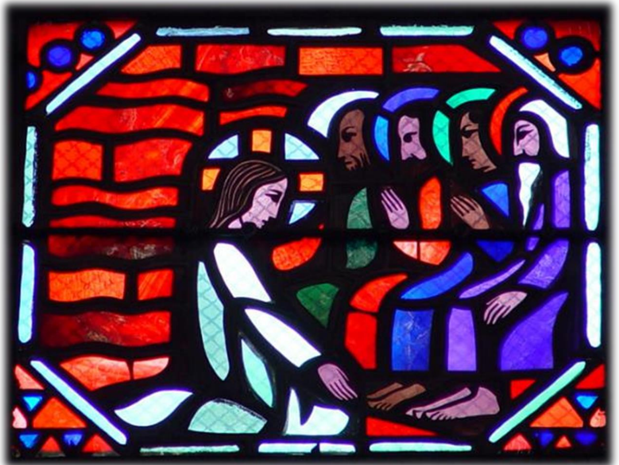
Christ Washes the Disciples' Feet -- Gaudin and Le Breton, Amiens Cathedral, Amiens, France